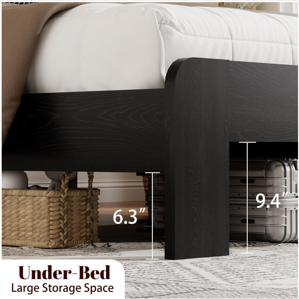
Image: A close-up view illustrating the generous under-bed storage space, showing suitcases and baskets stored beneath the frame.

Your browser does not support the video tag.