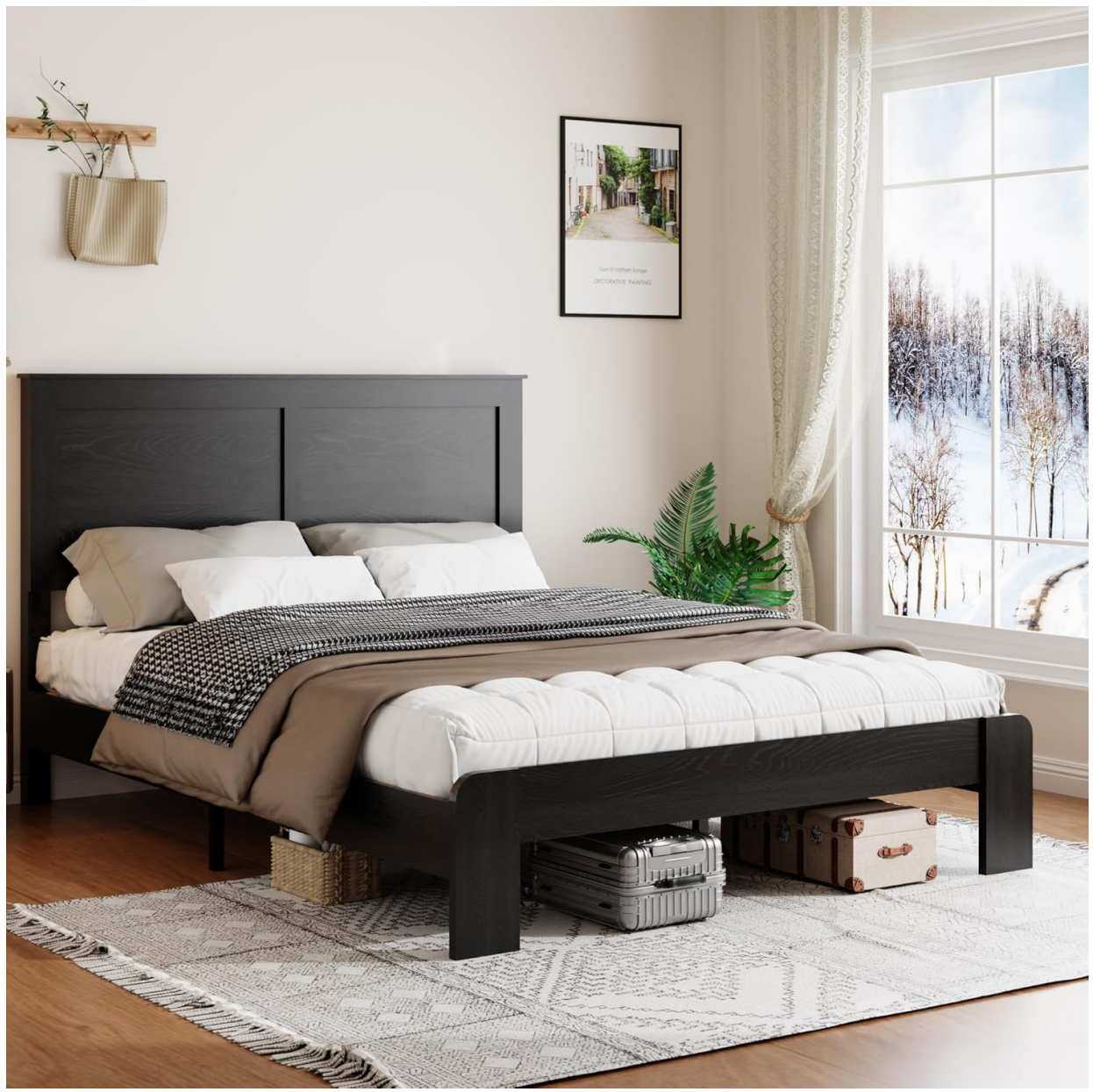
Image: The SAMTRA King Size Wooden Bed Frame in Rustic Black, featuring a headboard and ample under-bed space, set in a bedroom environment.