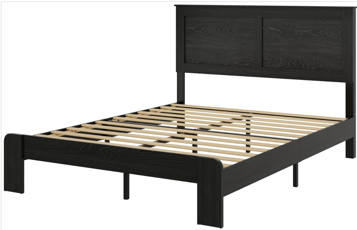
Image: The SAMTRA King Size Bed Frame shown without a mattress, clearly displaying the robust wood slat support system.