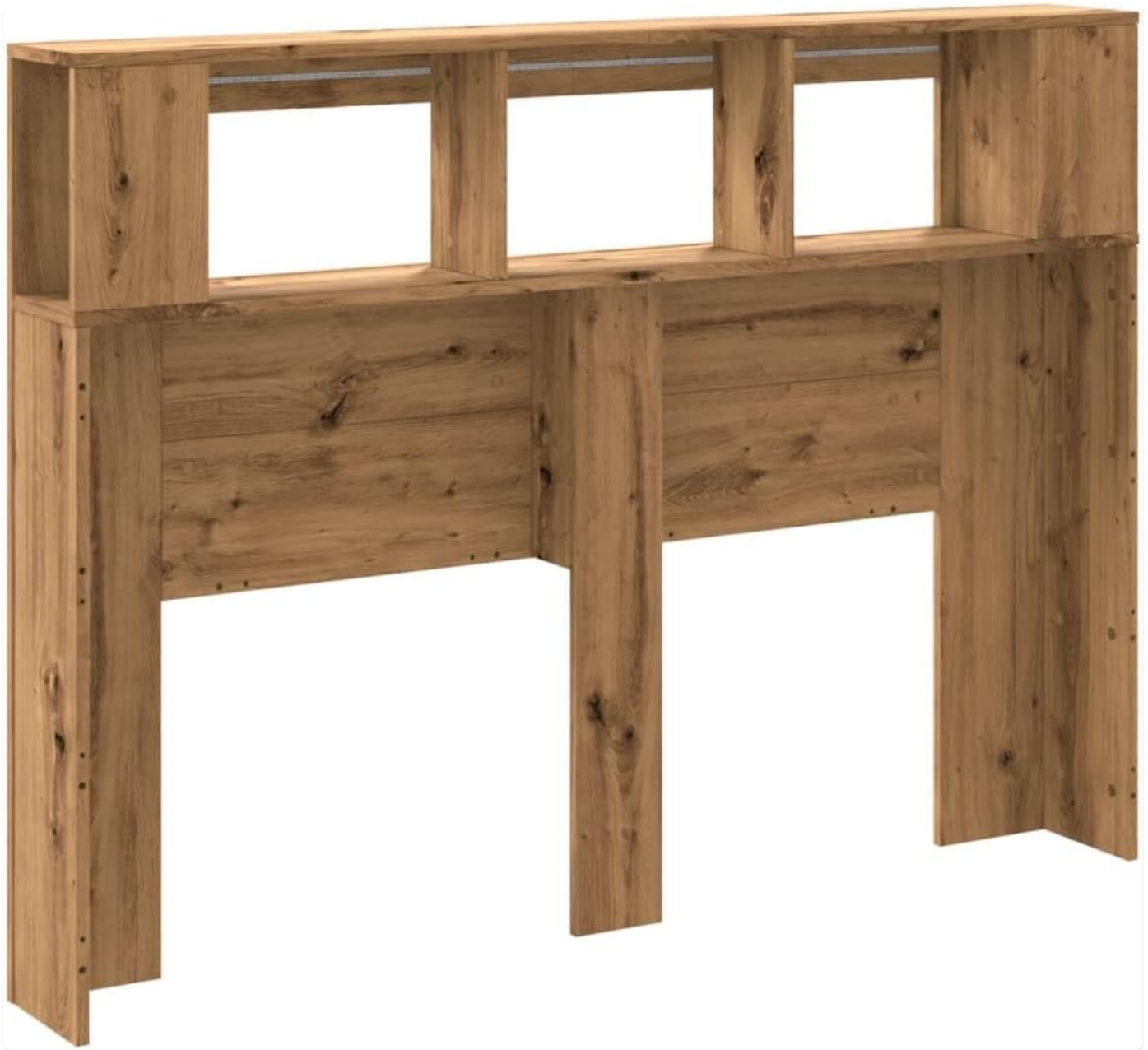
Image 4.2: Rear view of the headboard, highlighting the structural components and attachment points for assembly.