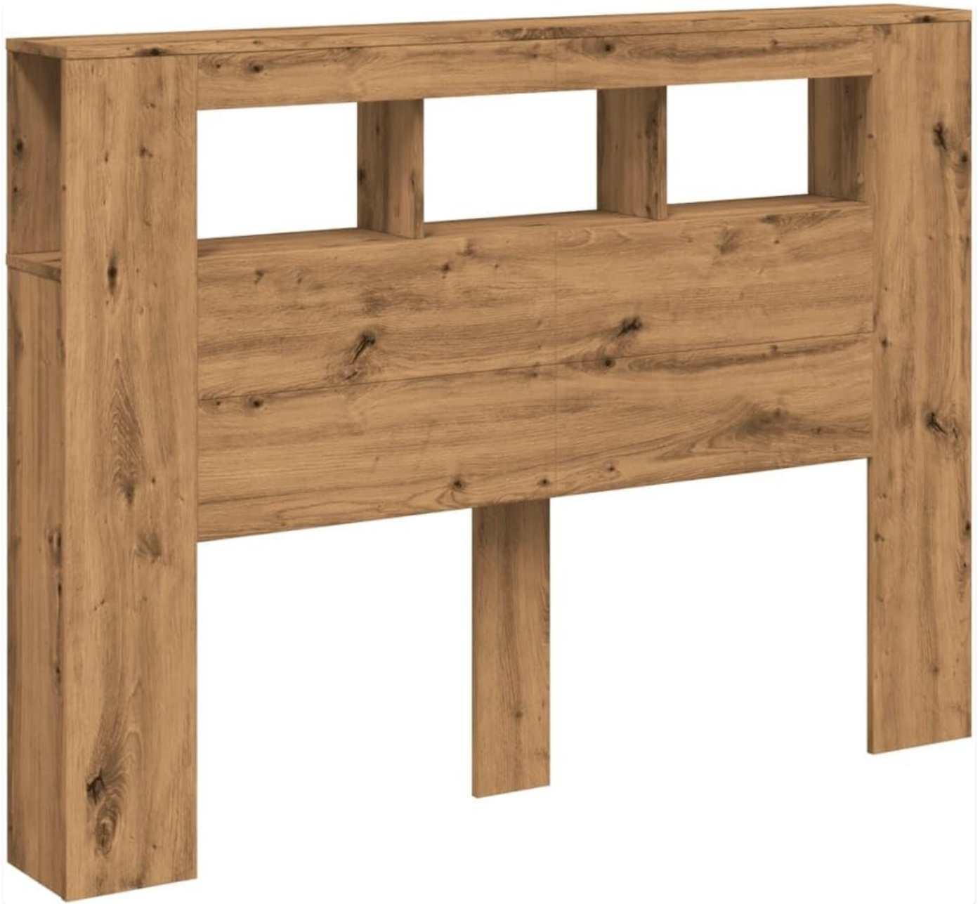
Image 1.1: Front view of the vidaXL LED Headboard, showcasing its artisan oak finish and integrated shelving.