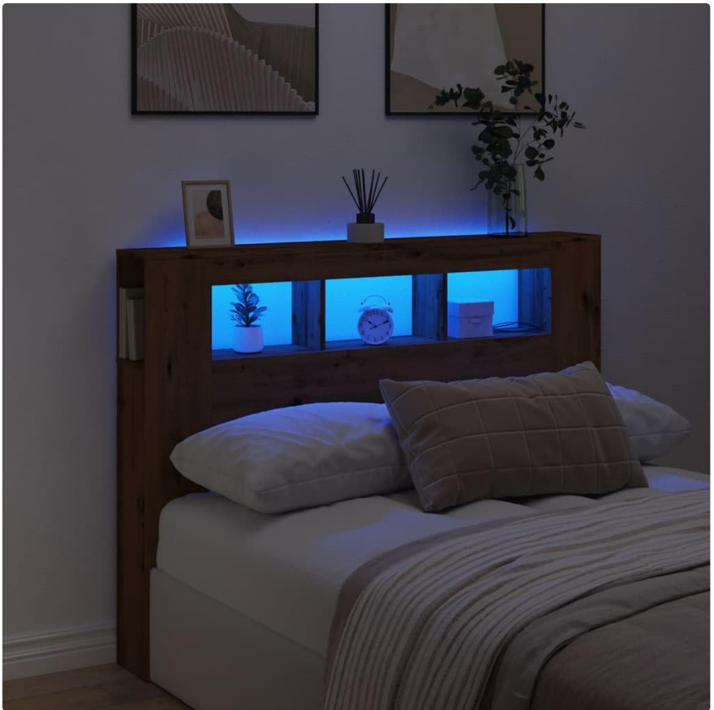
Image 5.1: Headboard with LED lights illuminated, demonstrating the ambient lighting effect.