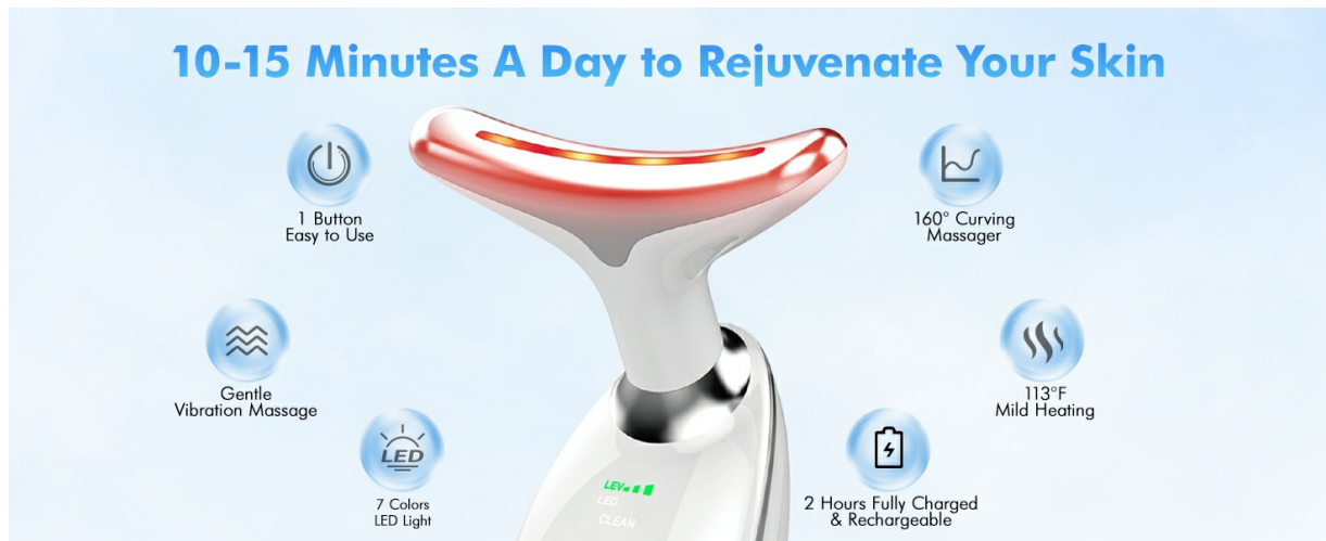
Image: Visual guide detailing the 7-color LED light therapy modes and their respective skin benefits.

Your browser does not support the video tag.