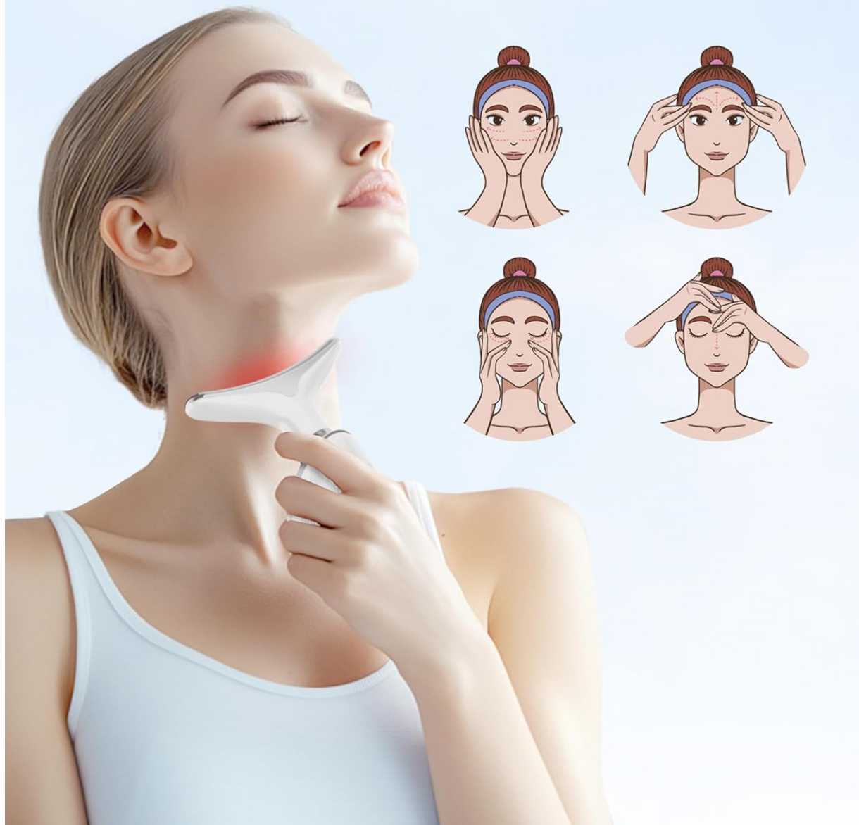
Image: Recommended facial massage techniques for different areas of the face and neck using the device.