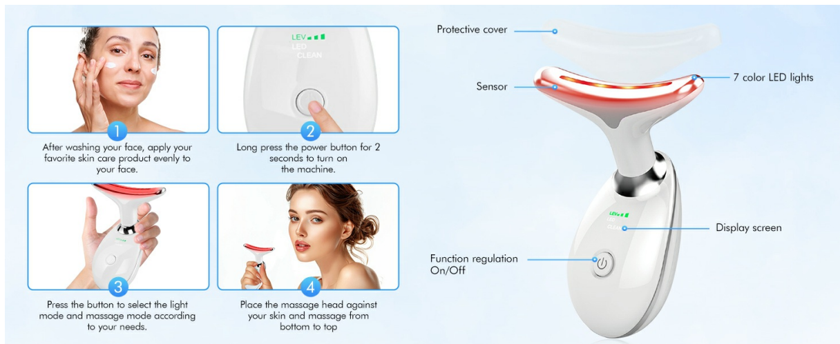
Image: Step-by-step guide illustrating the proper usage of the SDKWDH ES-1081 facial massager.