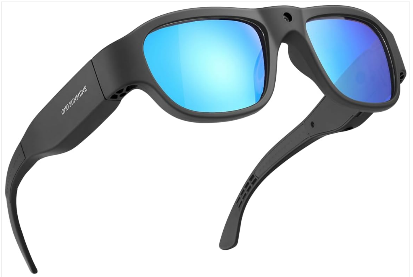
Figure 2.1: Front view of the OhO sunshine HD 1080p Video Recording Sunglasses, showcasing the black frame and blue polarized lenses.