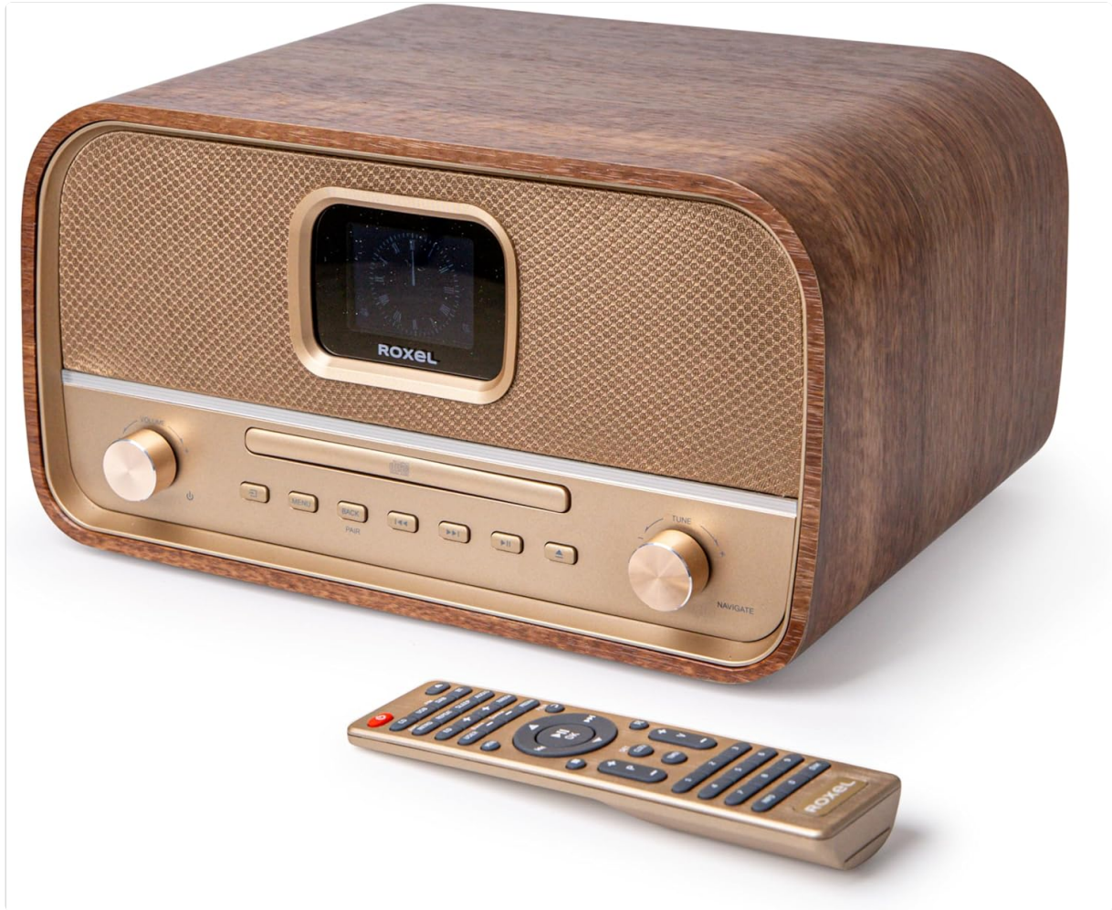
Figure 4.1: Front view of the Roxel Amber Hi-Fi System with its remote control. The unit features a central display, CD tray, and various control buttons and knobs.

Familiarize yourself with the components and controls of your Roxel Amber system.