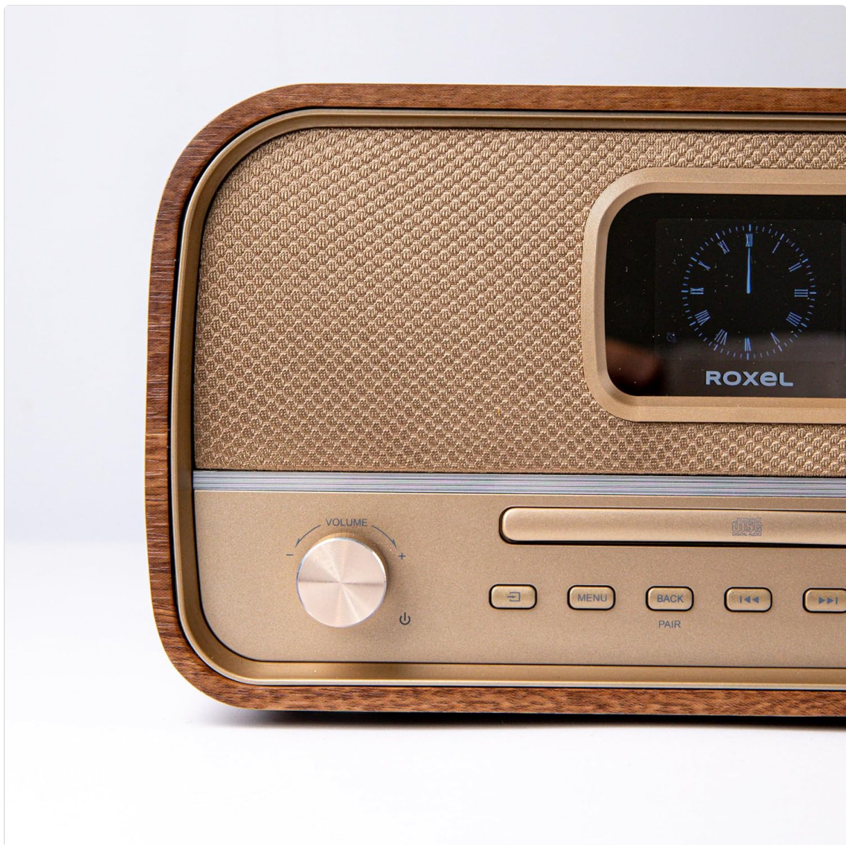
Figure 4.2: Close-up view of the front panel, showing the volume knob, power button, menu, back, pair, skip, play/pause, stop, eject, and tune/navigate controls, along with the color display.