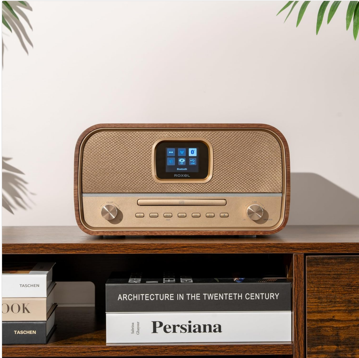
Figure 6.2: The display indicating that the system is in Bluetooth mode, ready for pairing.