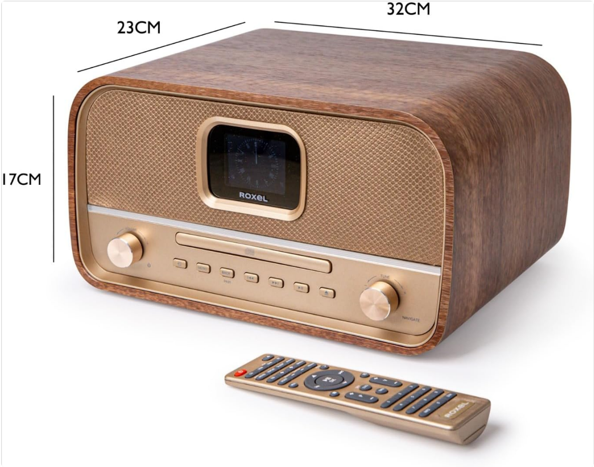
Figure 9.1: Dimensions of the Roxel Amber Hi-Fi System: approximately 32cm (width) x 17cm (height) x 23cm (depth).