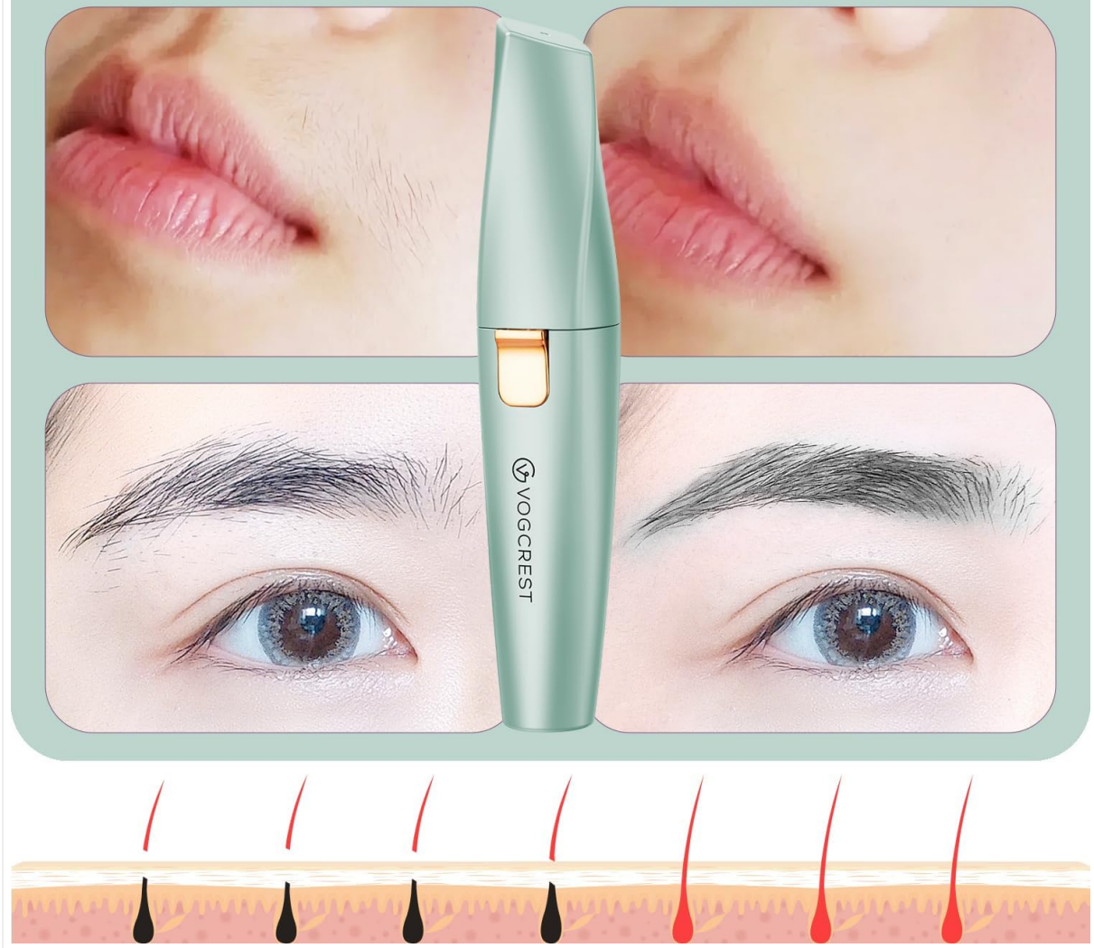
Image 5.3: Visual results of facial hair removal and eyebrow trimming.