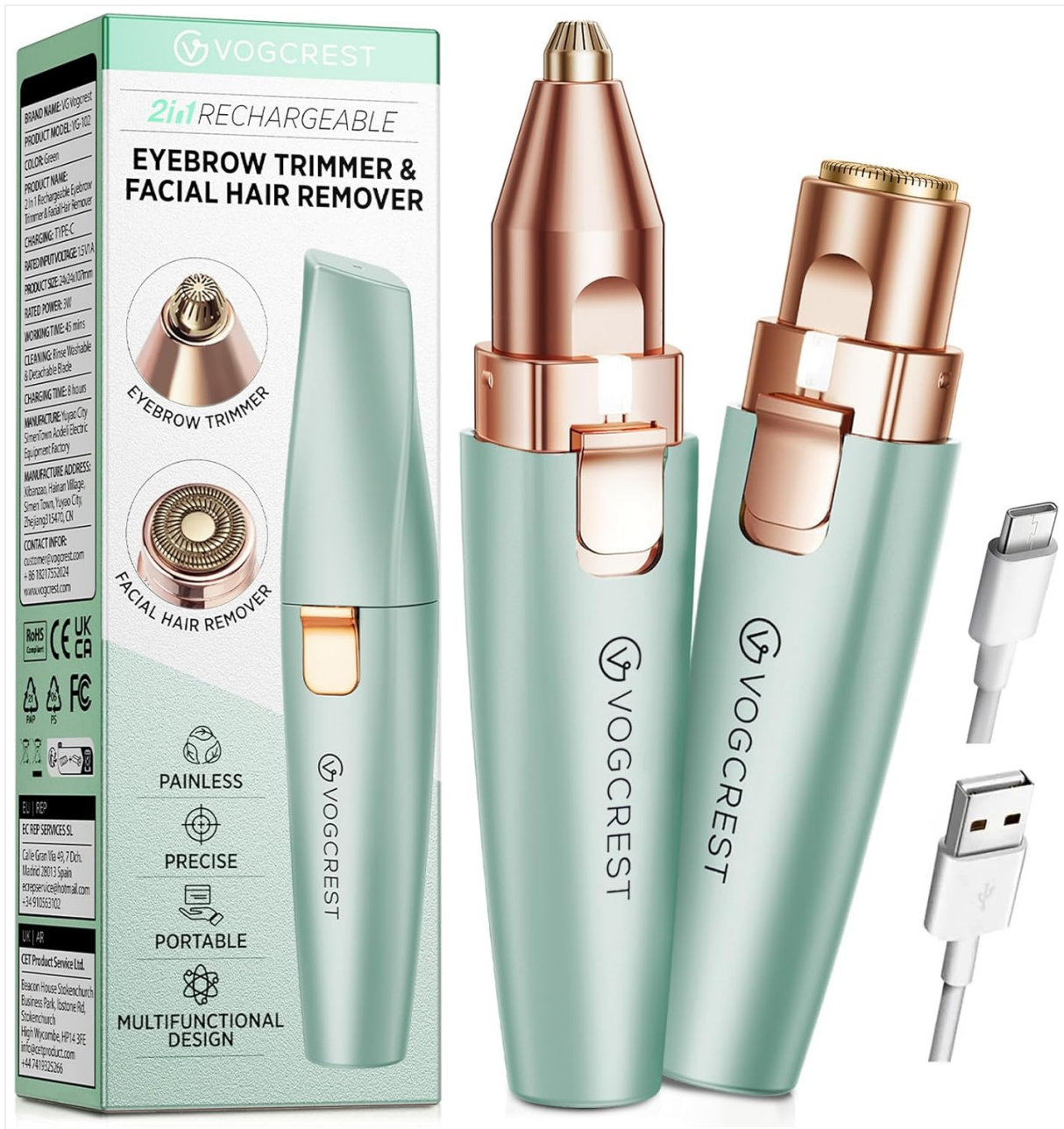
Image 1.1: The VG VOGCREST 2-in-1 Facial Trimmer, showcasing its sleek design.