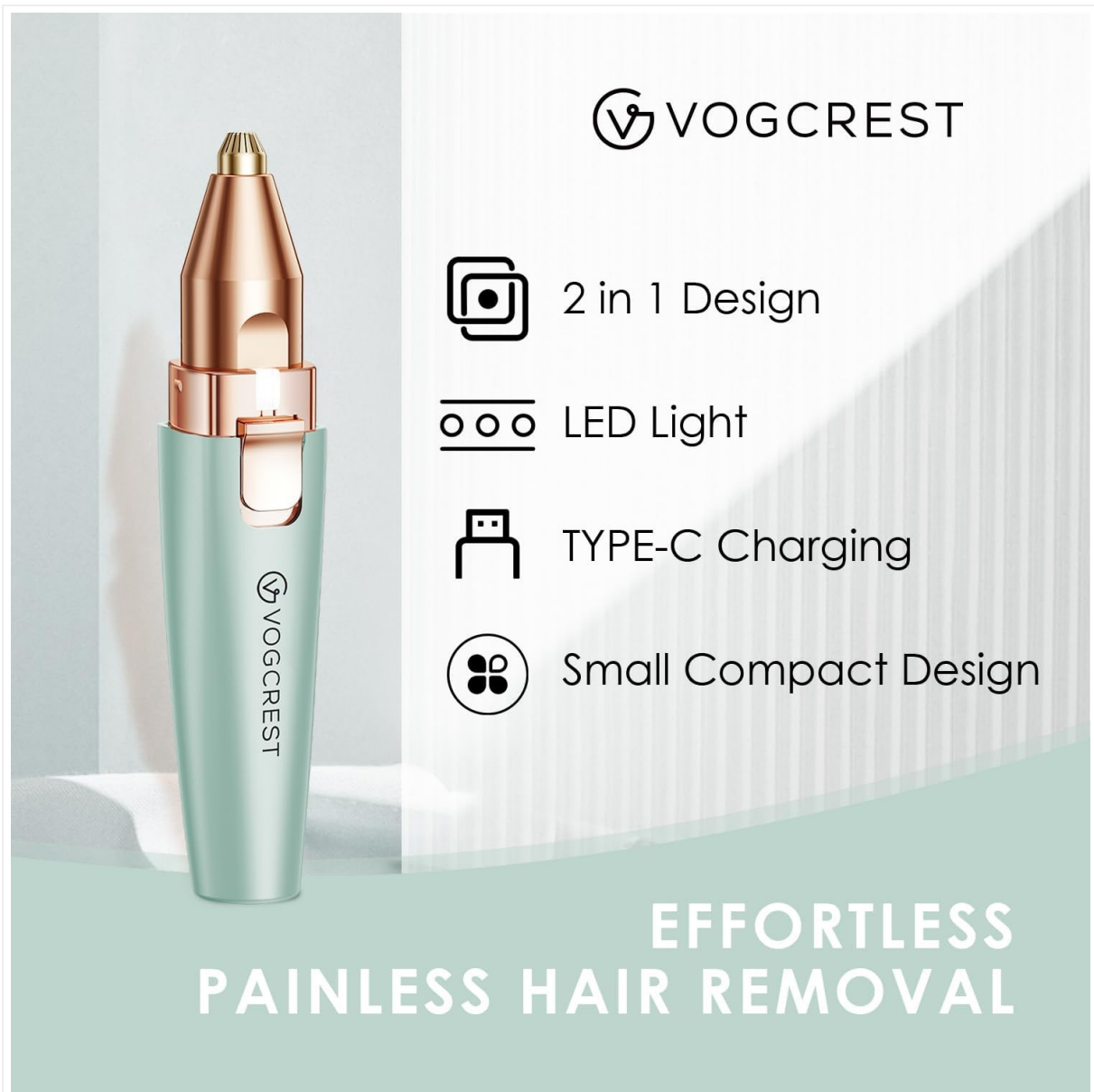
Image 1.2: Visual representation of the trimmer's key features: 2-in-1 design, LED light, Type-C charging, and compact size.