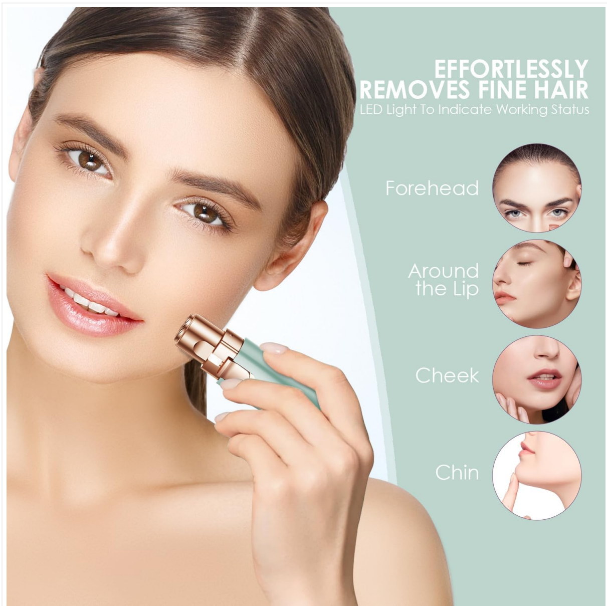
Image 1.3: Examples of facial areas where the trimmer can be effectively used.