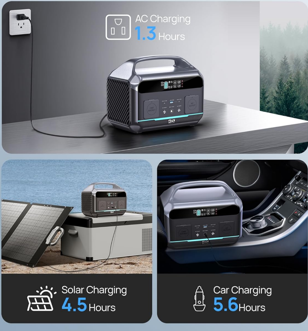
Figure 4.1: The NEO600 supports AC, Solar, and Car charging.

Your browser does not support the video tag.