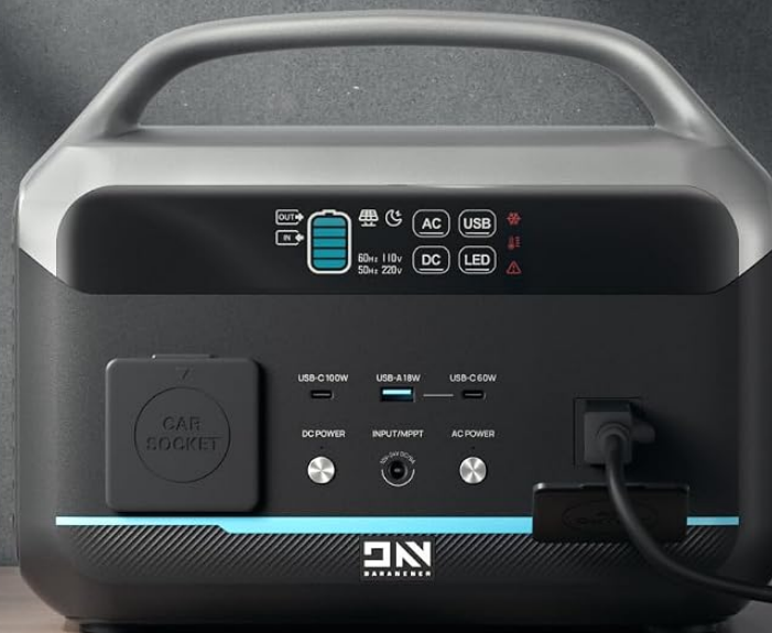
Figure 3.1: Overview of the 7-in-1 power station ports.