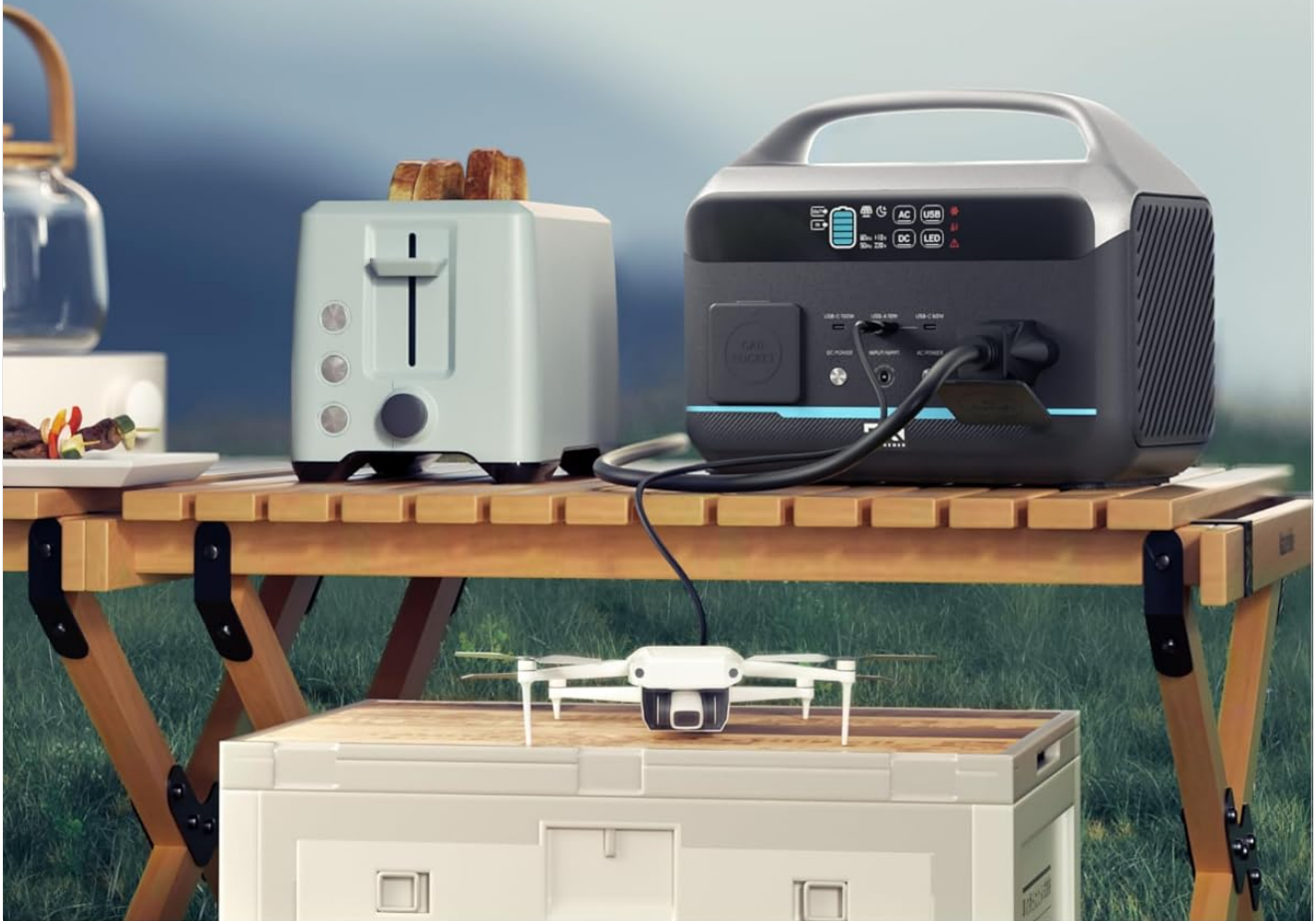
Figure 2.1: The NEO600 can power a variety of devices, including mini-fridges, fans, and drones.