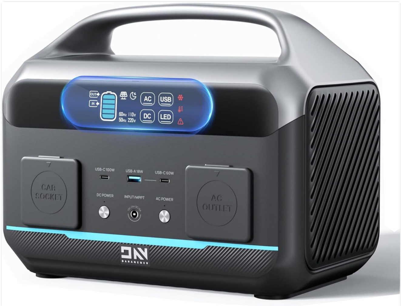
Figure 1.1: Front view of the DaranEner NEO600 Portable Power Station.