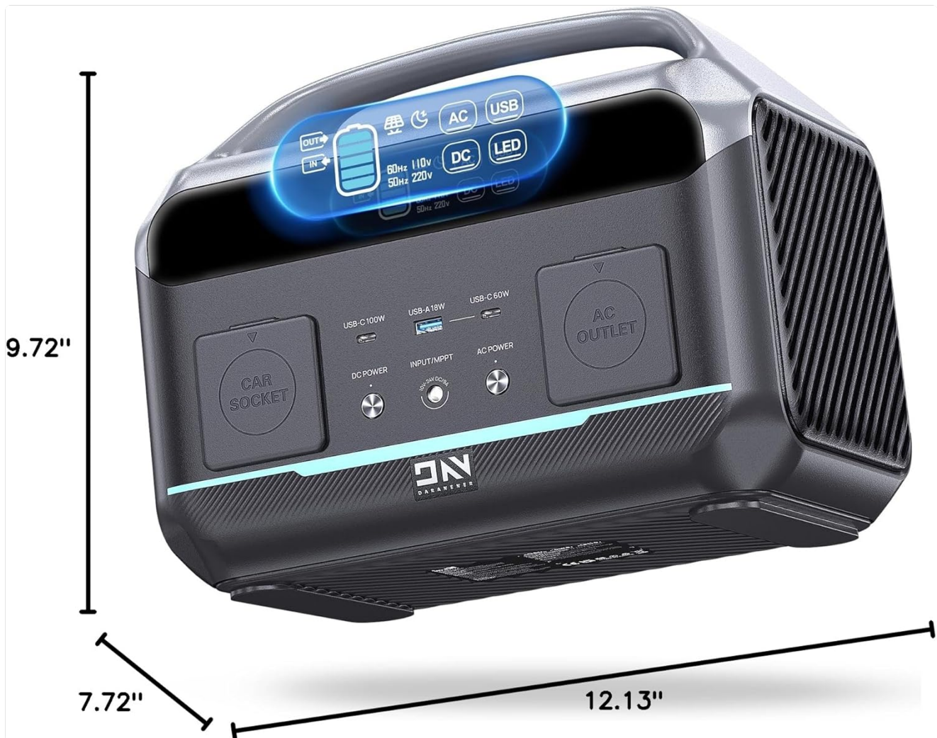
Figure 3.2: Detailed view of ports and dimensions (12.13"L x 7.72"W x 9.72"H).