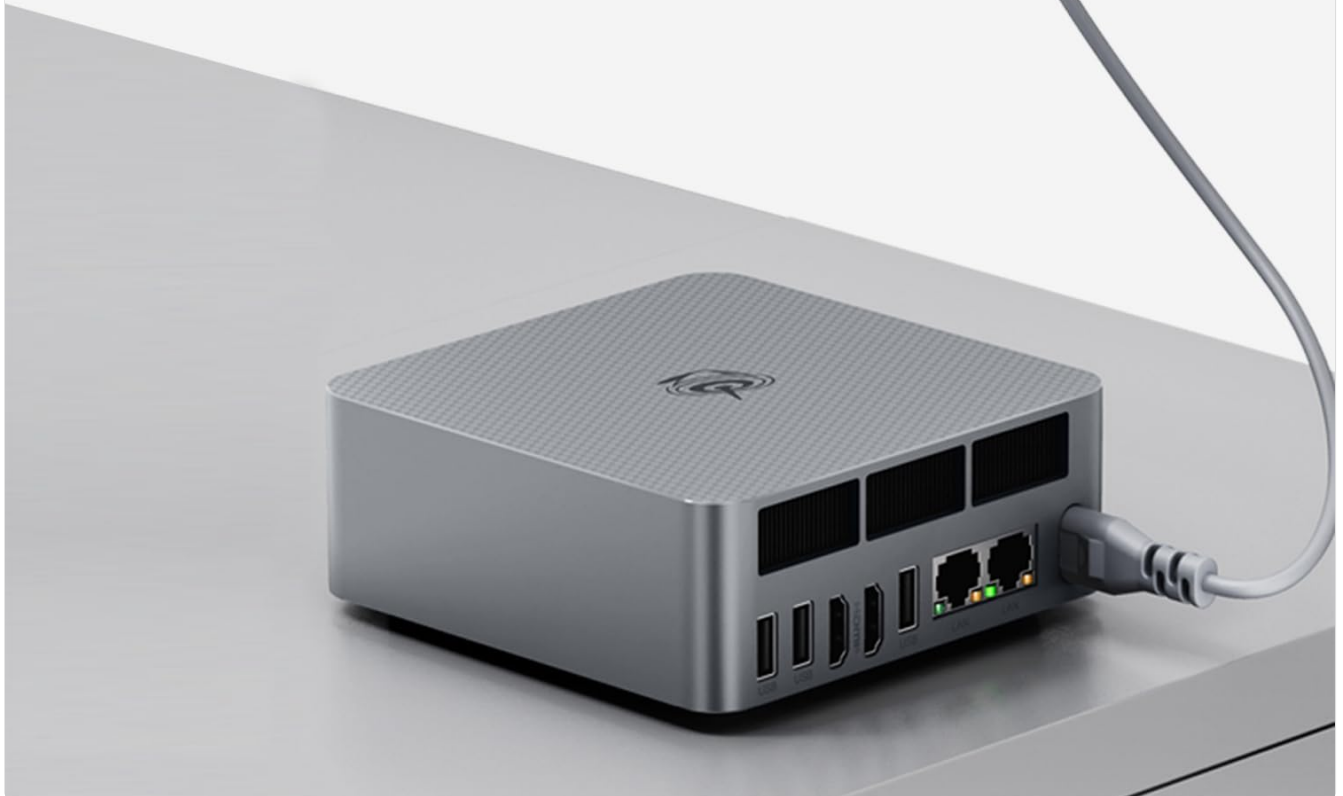
Figure 2: The Beelink EQR7 Mini PC connected to a power outlet, highlighting its built-in power supply.

Simplify your space with less cable clutter and fewer power strips