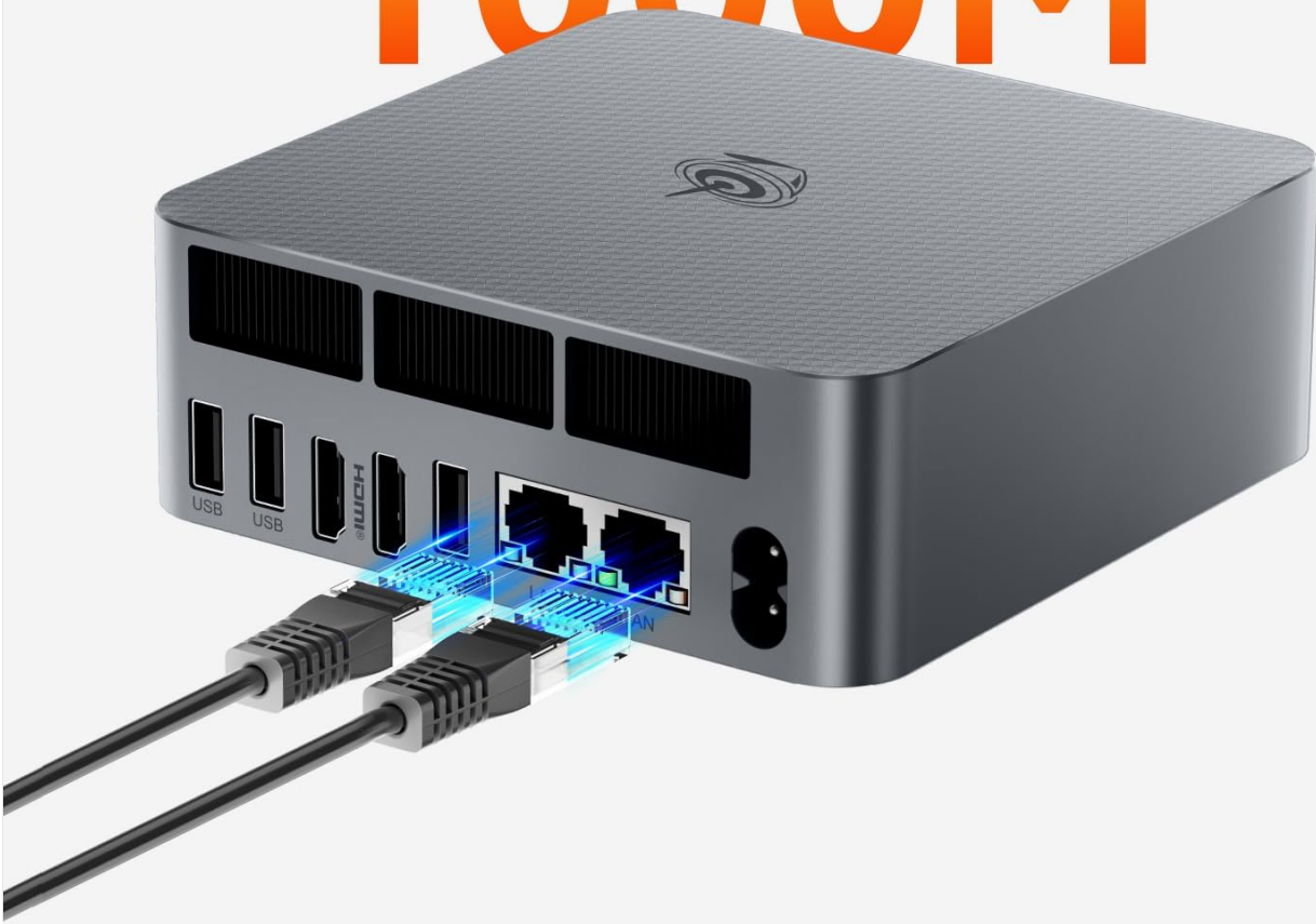
Figure 1: Front and rear view of the Beelink EQR7 Mini PC showing various ports including USB, HDMI, USB-C, and Ethernet.