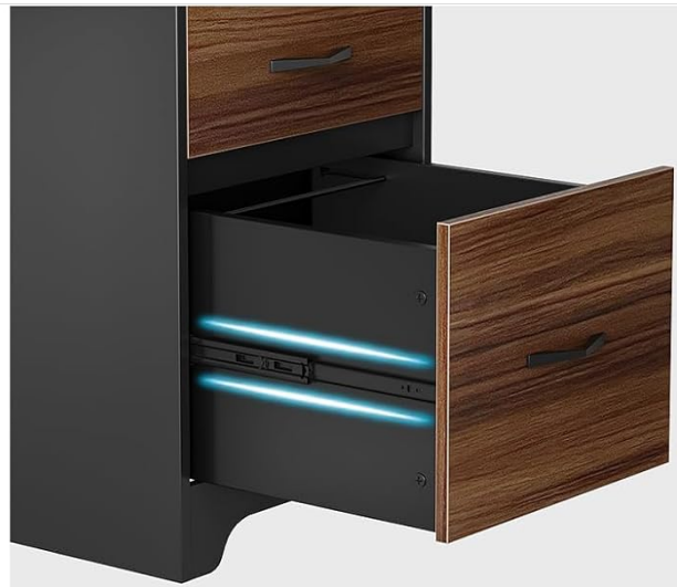
Smooth Drawer Hinges