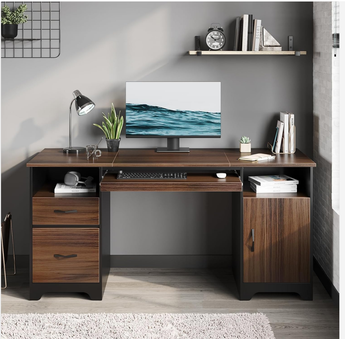
Figure 2.1: Bestier 59" Executive Desk (Cherry finish)