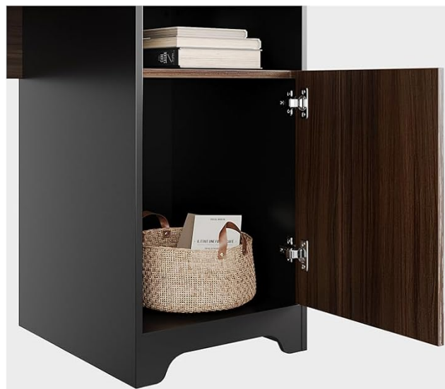
Dust-Free Storage Cabinet