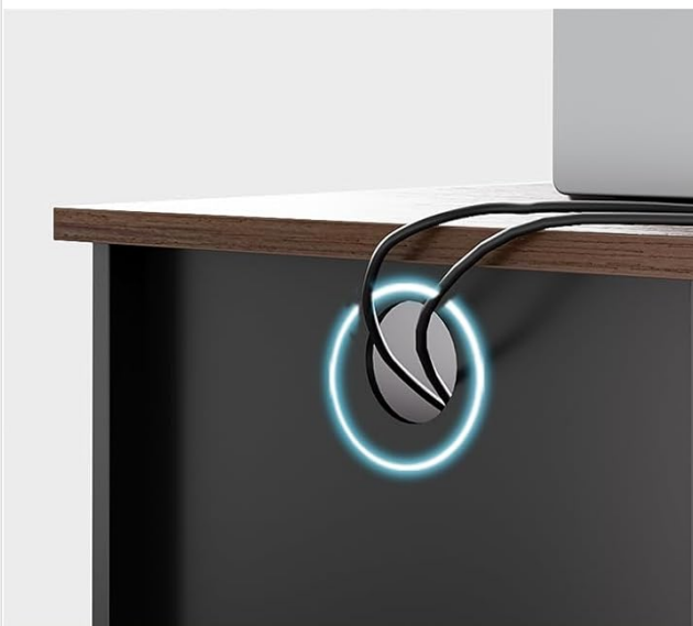
Cable Management Hole