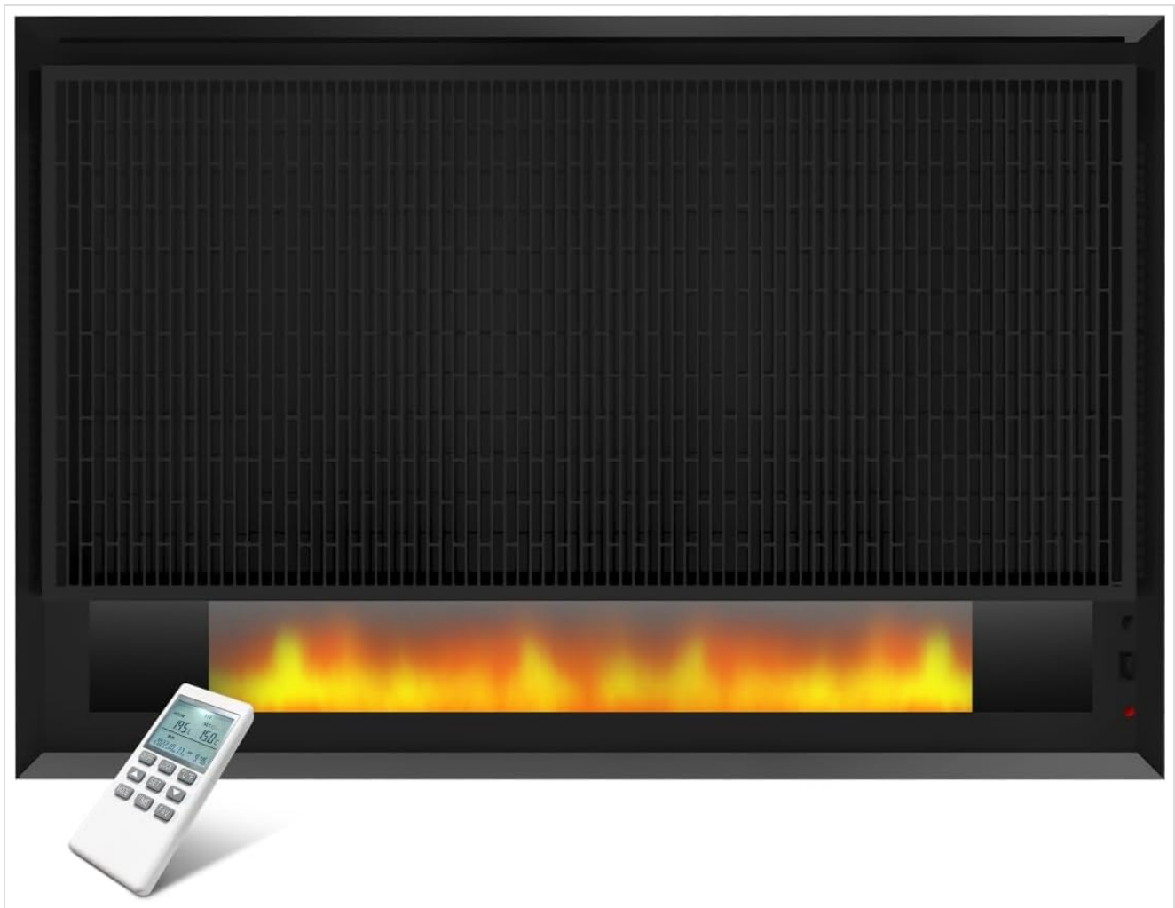
Image 2.1: The BYECOLD 36-inch electric fireplace unit shown with its remote control.