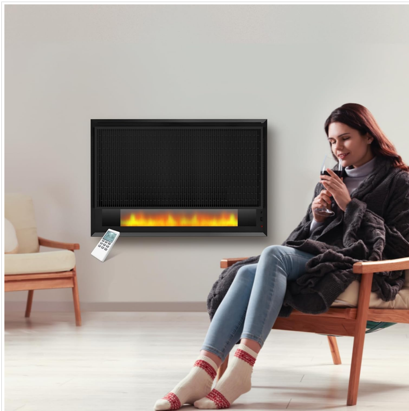
Image 4.1: The electric fireplace installed on a wall, providing warmth and ambiance to a room.