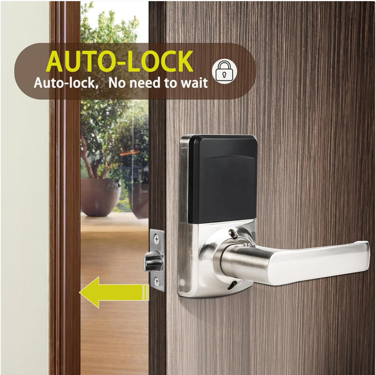
Figure 3.3: Illustration of the auto-lock mechanism engaging.