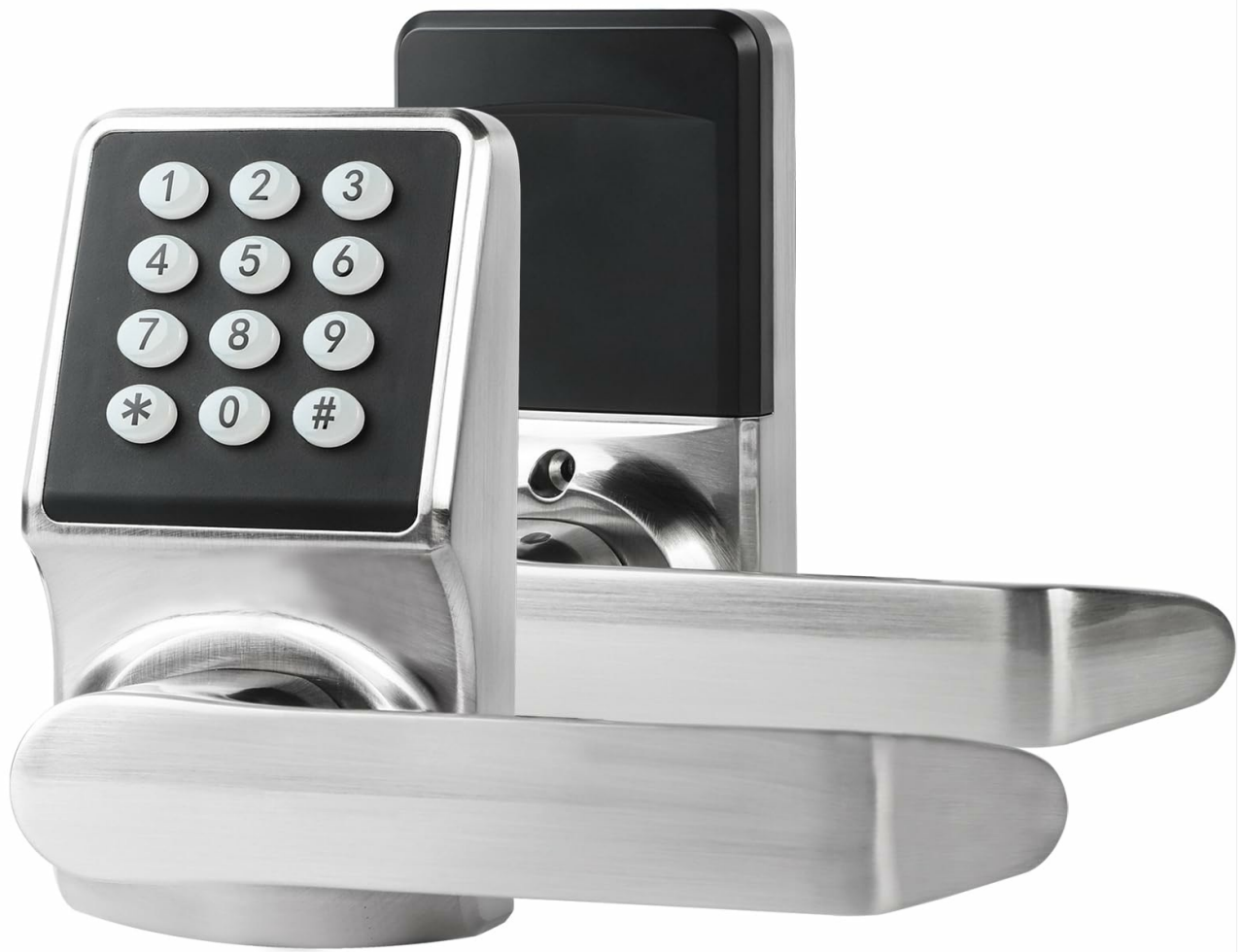
Figure 1.1: User interacting with the keypad of the JESSTTI Keyless Entry Door Lock.