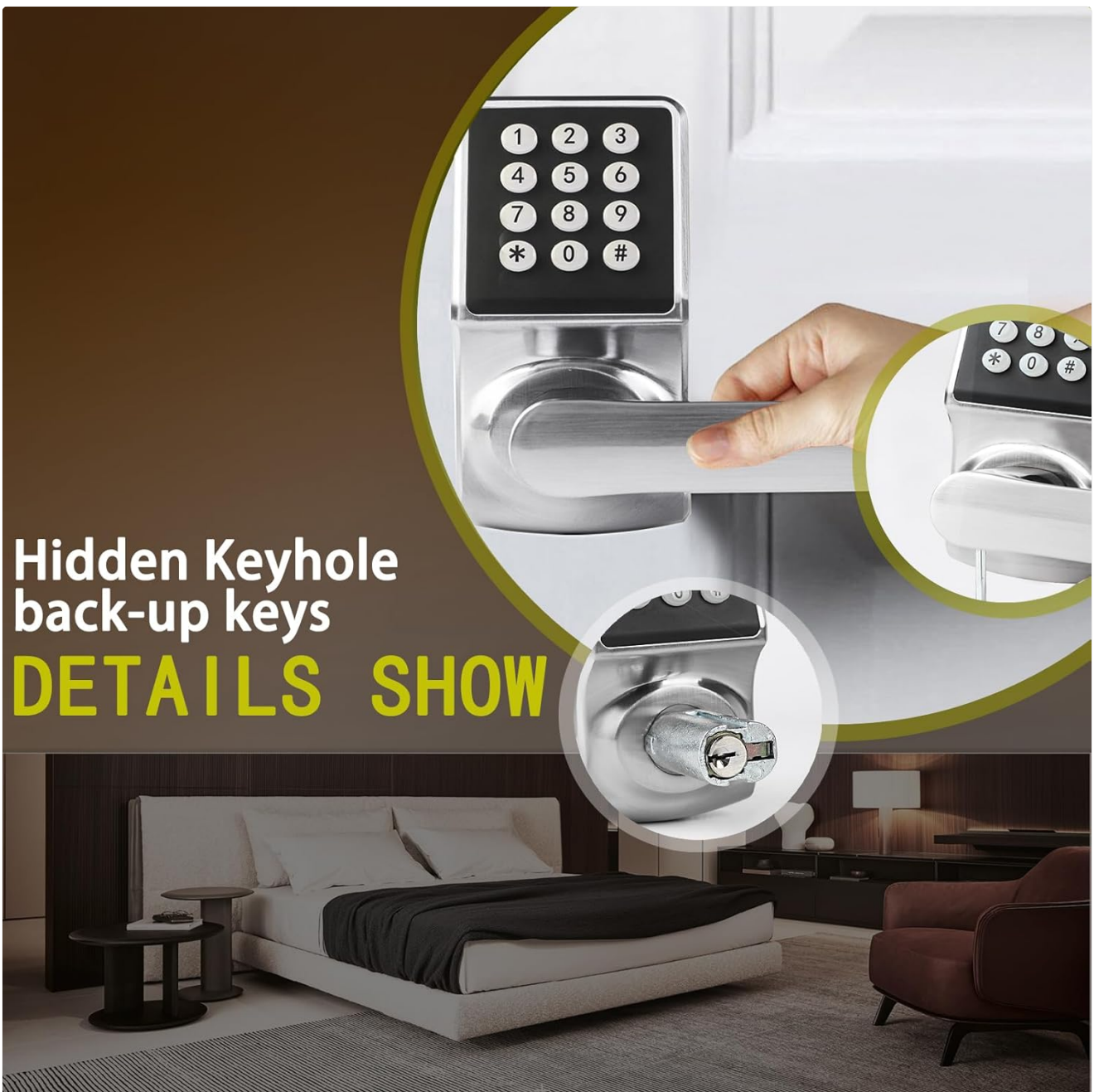
Figure 3.2: Location of the hidden keyhole for emergency access.