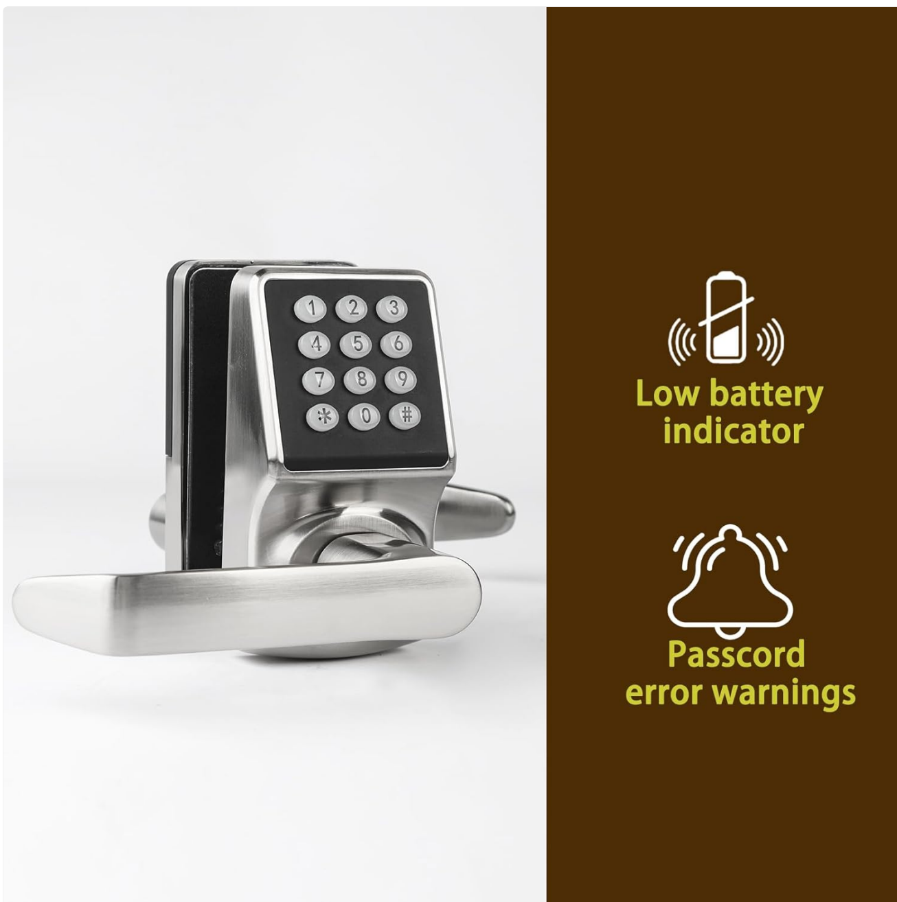
Figure 4.1: Visual representation of the low battery indicator.