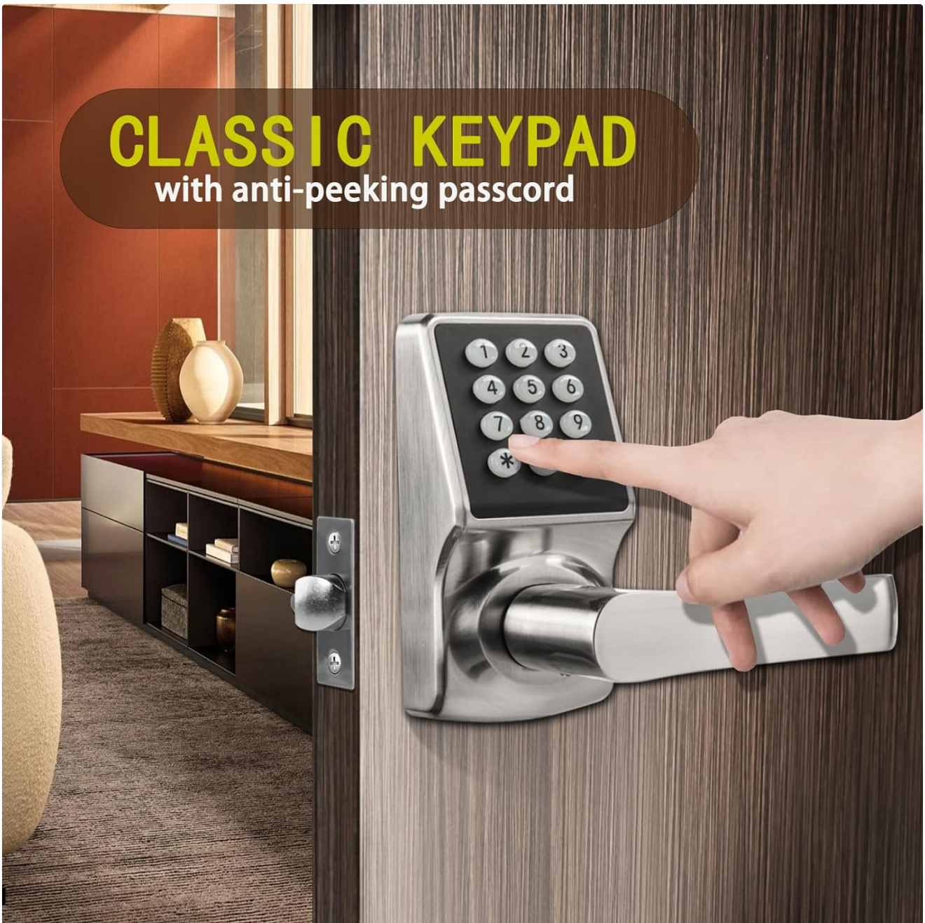
Figure 3.1: Keypad with anti-peeping passcode functionality.