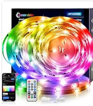
Image: The control box with clearly labeled buttons for mode, power, and music sync.