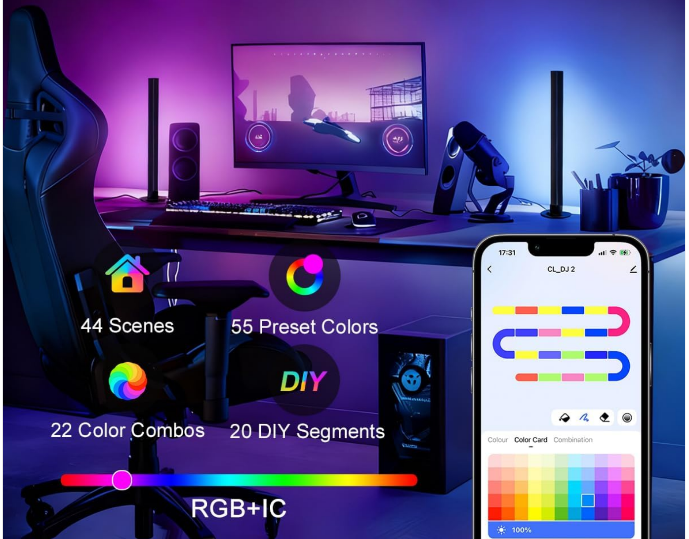
Image: The Smart Life app interface showing various customization options for the light bars.

DIY your lighting effects for gaming, studying, and relaxing