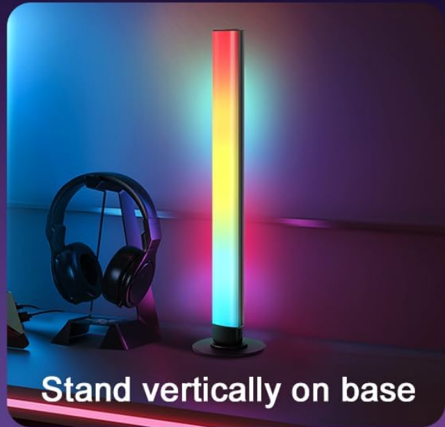
Stand vertically on base