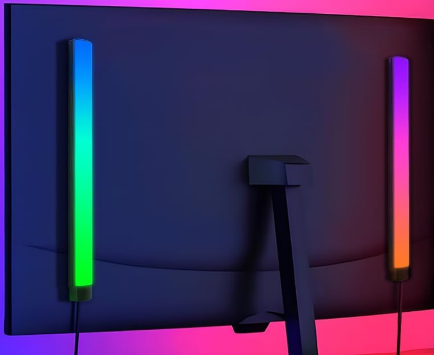
Image: Demonstrates horizontal, vertical, and mounted placement options for the light bars.