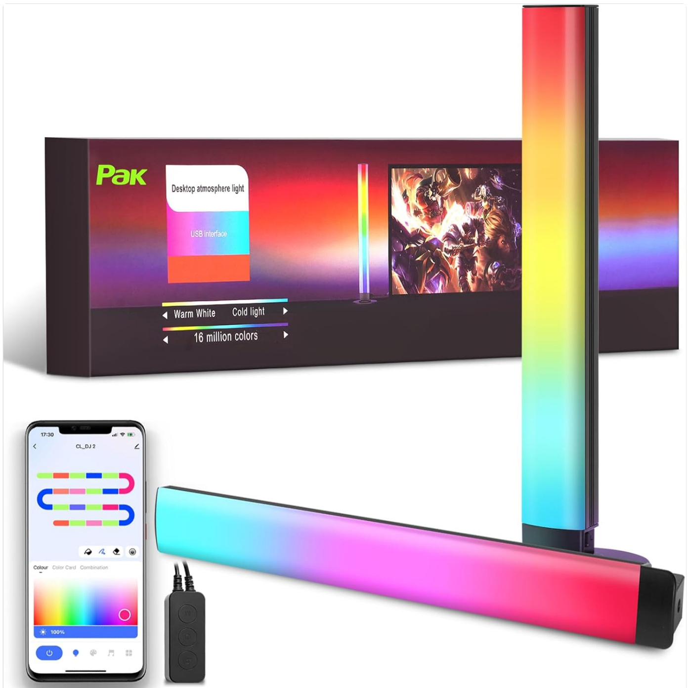
Image: Pak Smart RGB+IC LED Light Bars, showing the product and its retail packaging.