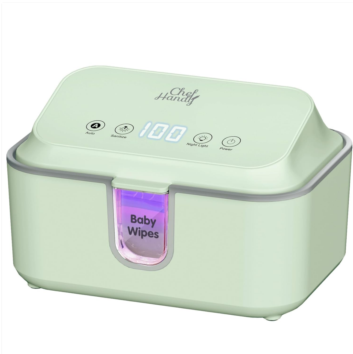
Image: The Chefhandy Baby Wipe Warmer in green, featuring a digital display and control buttons on the lid.