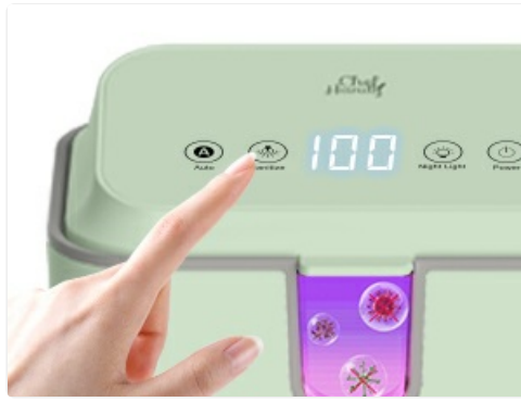
Image: A close-up of a finger pressing the sanitize button on the control panel of the wipe warmer, with a visual representation of germs being eliminated.