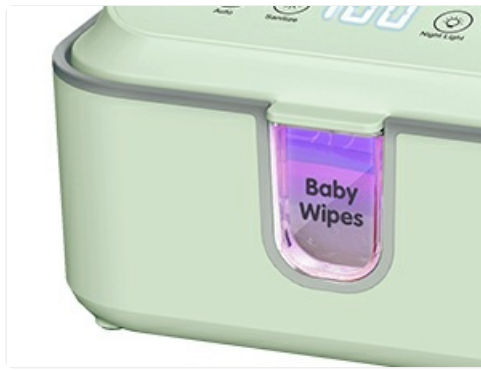
Image: A close-up of a finger pressing the power button on the control panel of the wipe warmer.