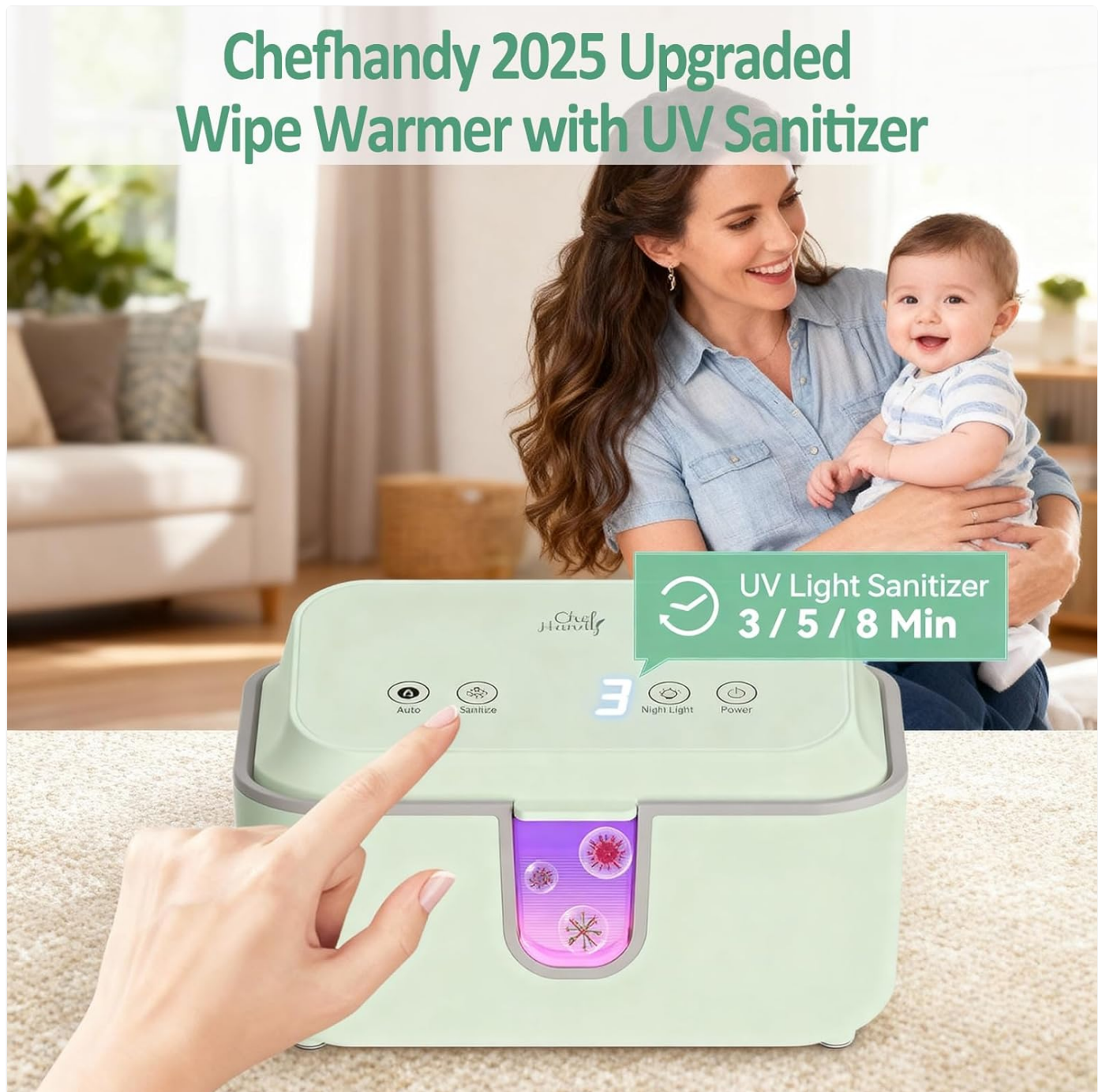
Image: Diagram illustrating the various components and features of the wipe warmer, including the control panel and wipe dispensing area.