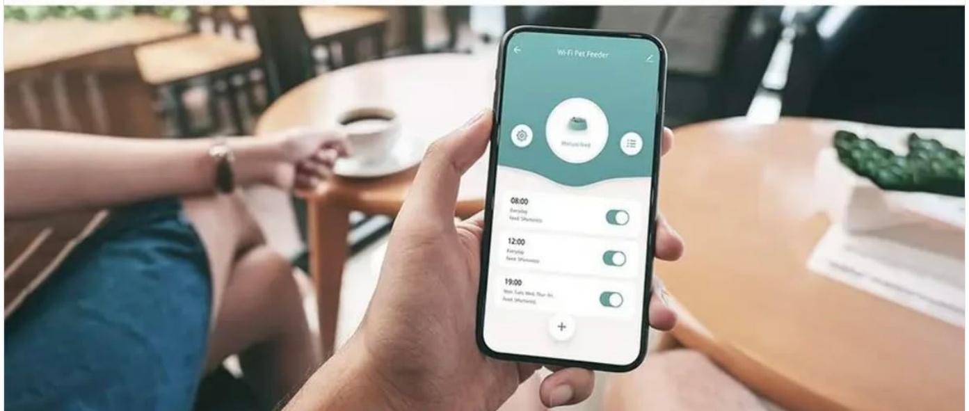
Figure 3: Wi-Fi Connectivity and App Interface. This image highlights the 2.4G Wi-Fi compatibility and shows the mobile application used for scheduling and control.