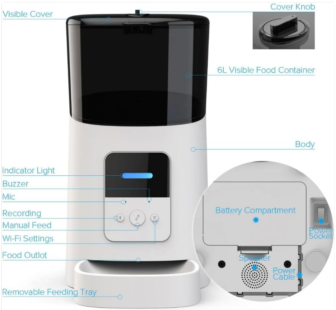
Figure 2: Dual Power Protection. This image illustrates the battery compartment and DC power input, highlighting the feeder's ability to operate on both power sources.