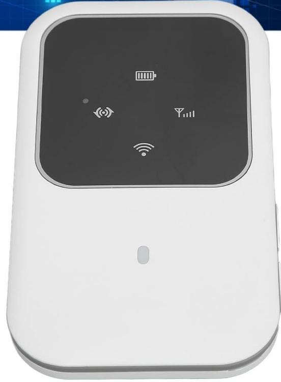
Figure 2: Close-up of the H80's LED smart display, showing indicators for WiFi, signal strength, and battery status.

WiFi LED smart display Easy to operate Lightweight and slim design Easy to carry