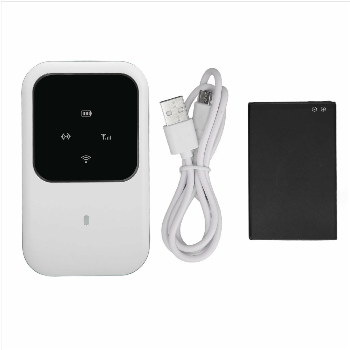
Figure 1: Front view of the Ivifloae H80 Mobile Hotspot, showing the LED display and compact design.