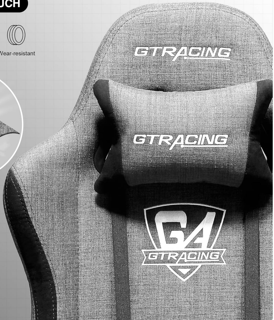
Image: GTPLAYER Gaming Chair GT505F-2024 in a typical office or gaming environment.