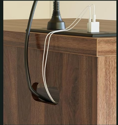
Figure 4: Power Strip, Adjustable Shelf, and Lock Details. Features include a side lock, adjustable shelves, and a cable management hole.