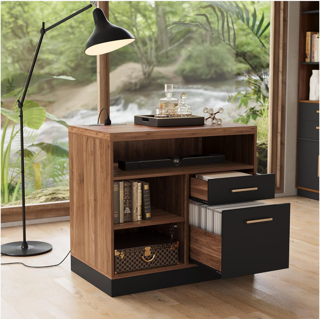
Figure 1: Product Dimensions. Overall dimensions are 19.5"D x 31.5"W x 29.4"H.

Place the cabinet on a flat, stable surface. Consider proximity to power outlets for convenient use of the integrated power strip. The cabinet features adjustable leveling screws for minor height adjustments on uneven floors.