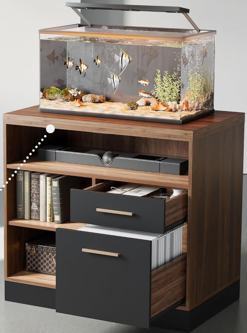
Figure 2: Enhanced Stability. The cabinet features a 1.18-inch thick top panel for stability, supporting up to 300 lbs.