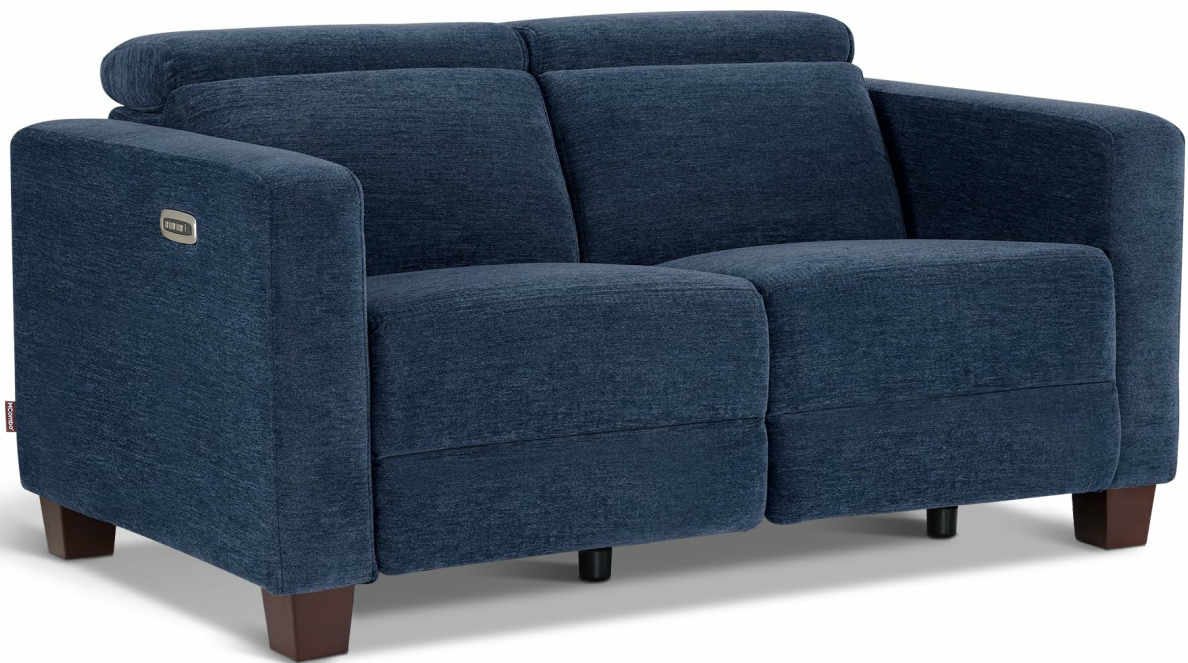
Image: The MCombo 62.2" Reclining Loveseat in Navy Blue, showcasing its modern design.