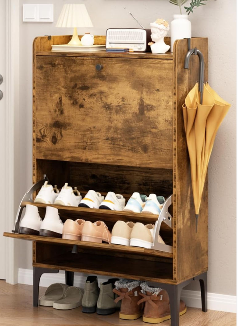
Image: Demonstration of the adjustable and removable internal partitions for flexible shoe storage.