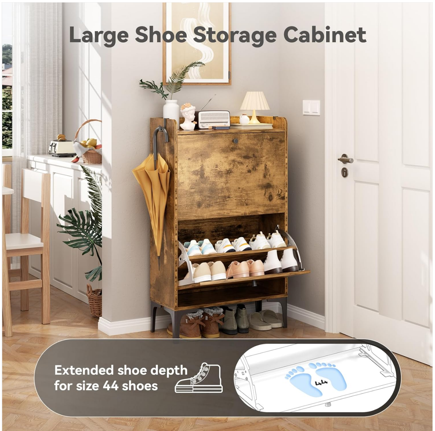
Image: The shoe cabinet in use, highlighting its capacity and additional storage features like the top surface and space beneath.