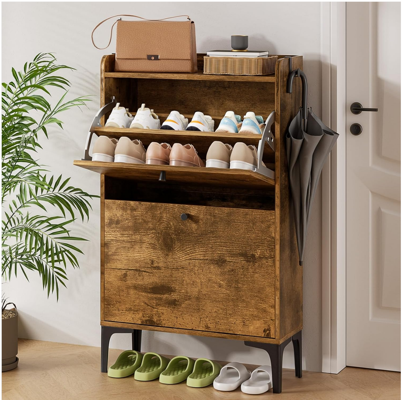
Image: The Dripex Modern Shoe Storage Cabinet, showcasing its design and storage capacity in an entryway setting.