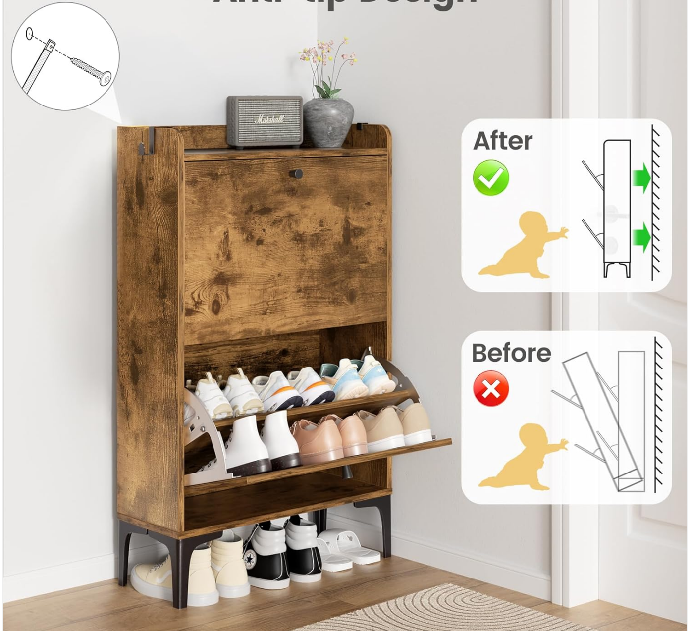
Image: Illustration of the anti-tip mechanism, demonstrating how to safely secure the cabinet to a wall.