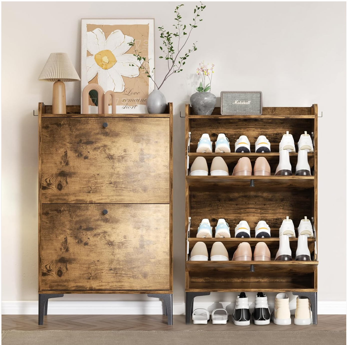
Image: Visual representation of the cabinet's dimensions.