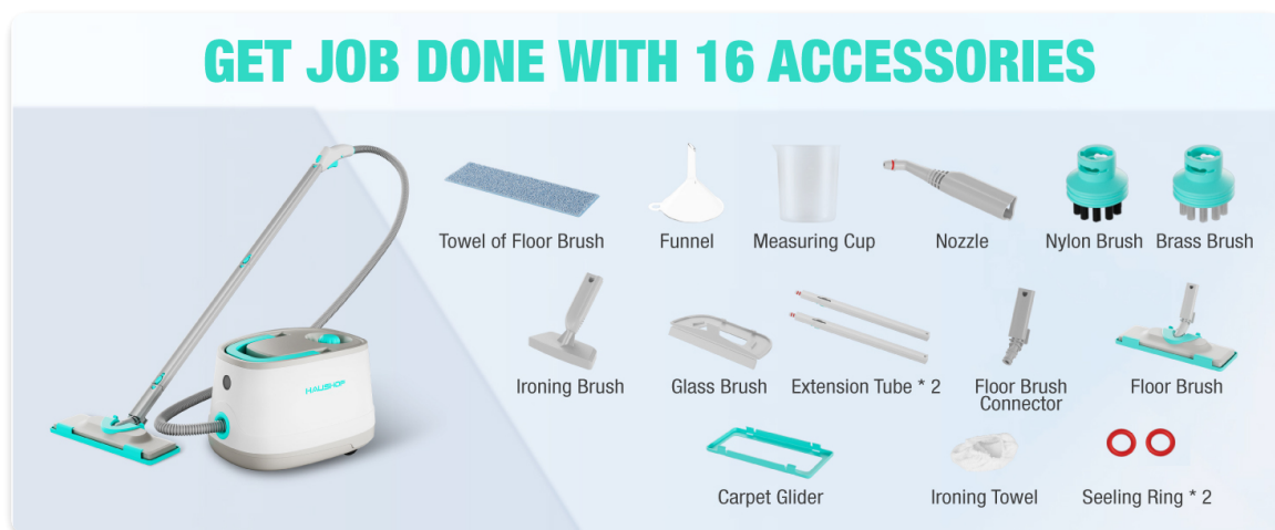
Figure 8: Wide application of the steam cleaner.