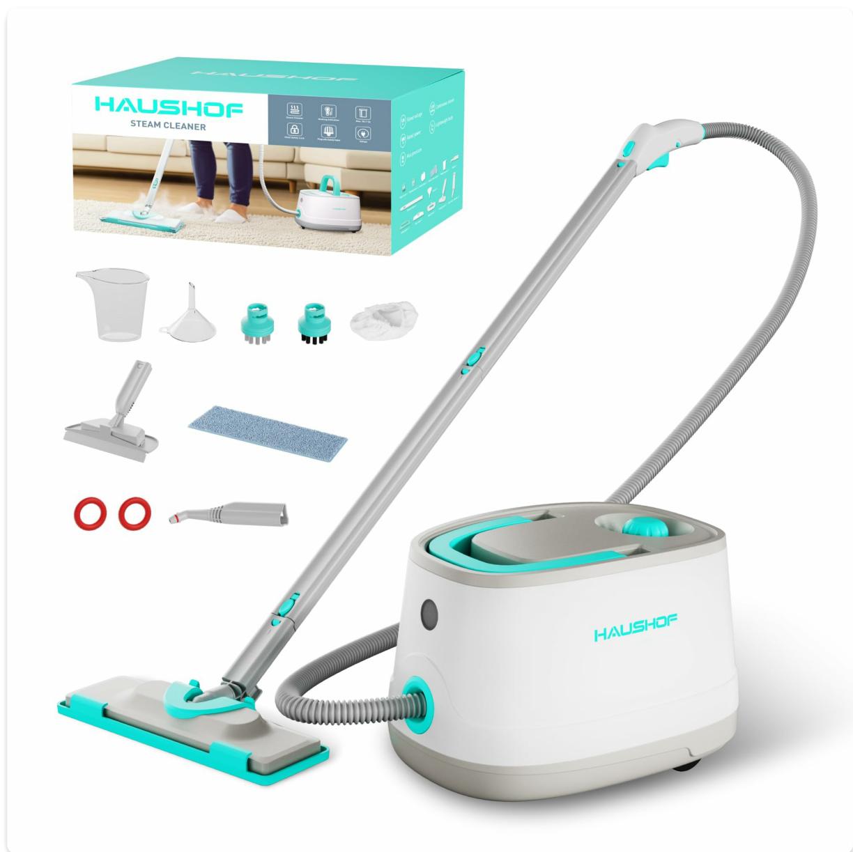
Figure 1: HAUSHOF Steam Cleaner main unit with various attachments.