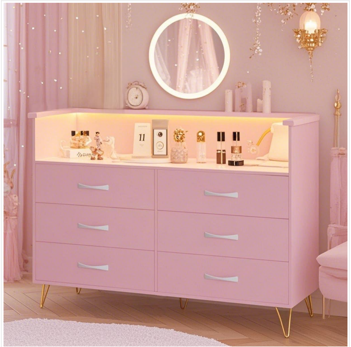
Figure 3.1: Fully assembled Patikuin Pink Dresser. This image shows the dresser in a typical bedroom environment.