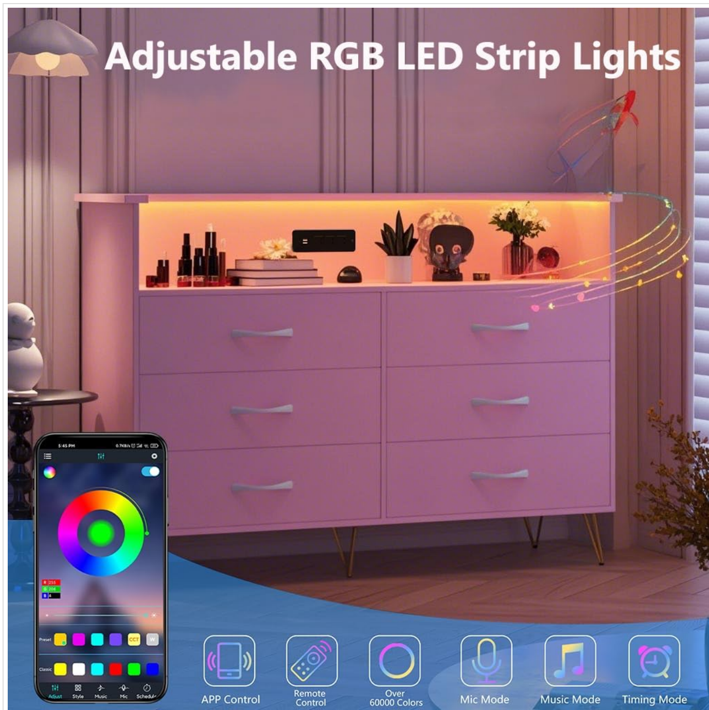
Figure 4.1: LED lighting in operation. This image shows the dresser's open shelf illuminated by the integrated LED strip.