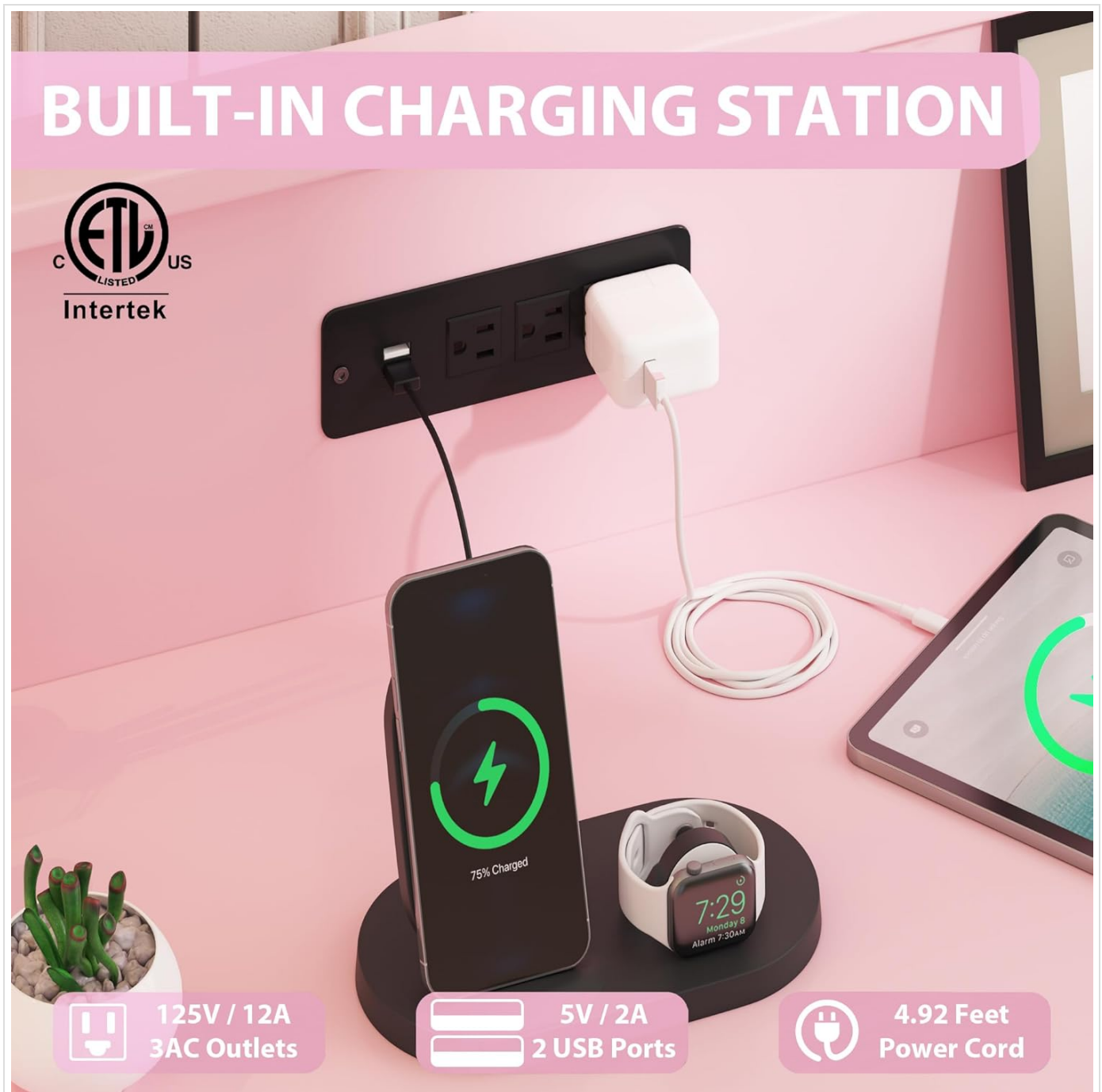
Figure 4.2: Detail of the charging station. This image highlights the AC outlets and USB ports available for device charging.