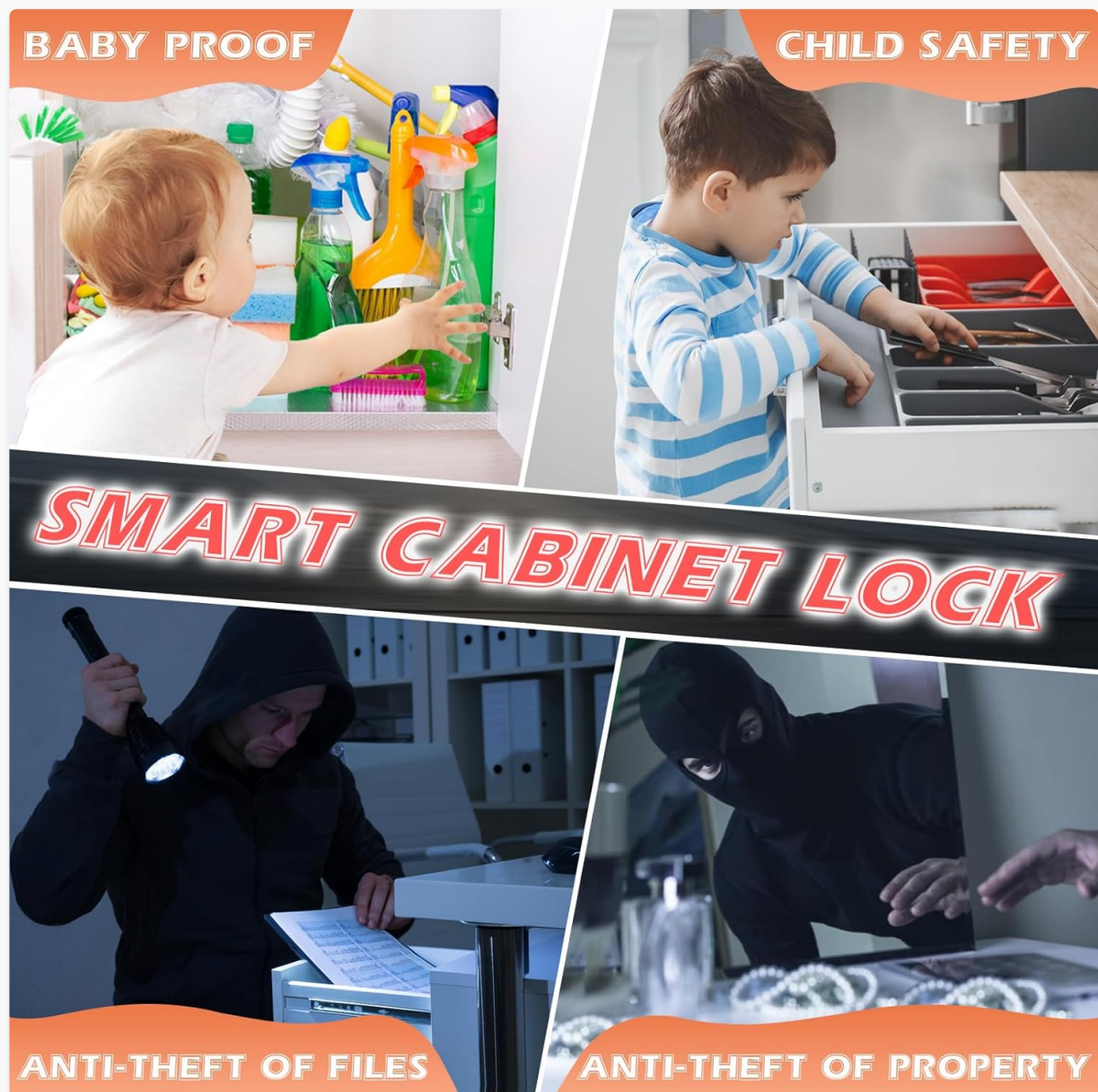
Image: Illustrates the use of the smart cabinet lock for child safety and anti-theft purposes.