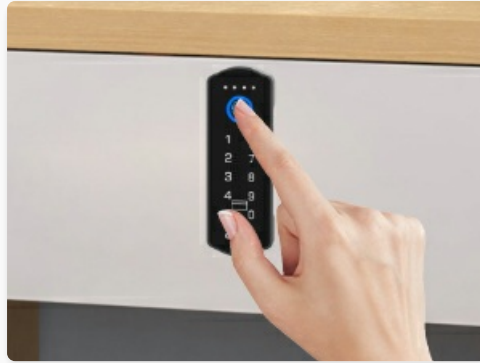
Image: Demonstrating fingerprint unlock on the smart cabinet lock.

Place your registered finger on the fingerprint sensor on the front lock body. The lock will disengage upon successful recognition.