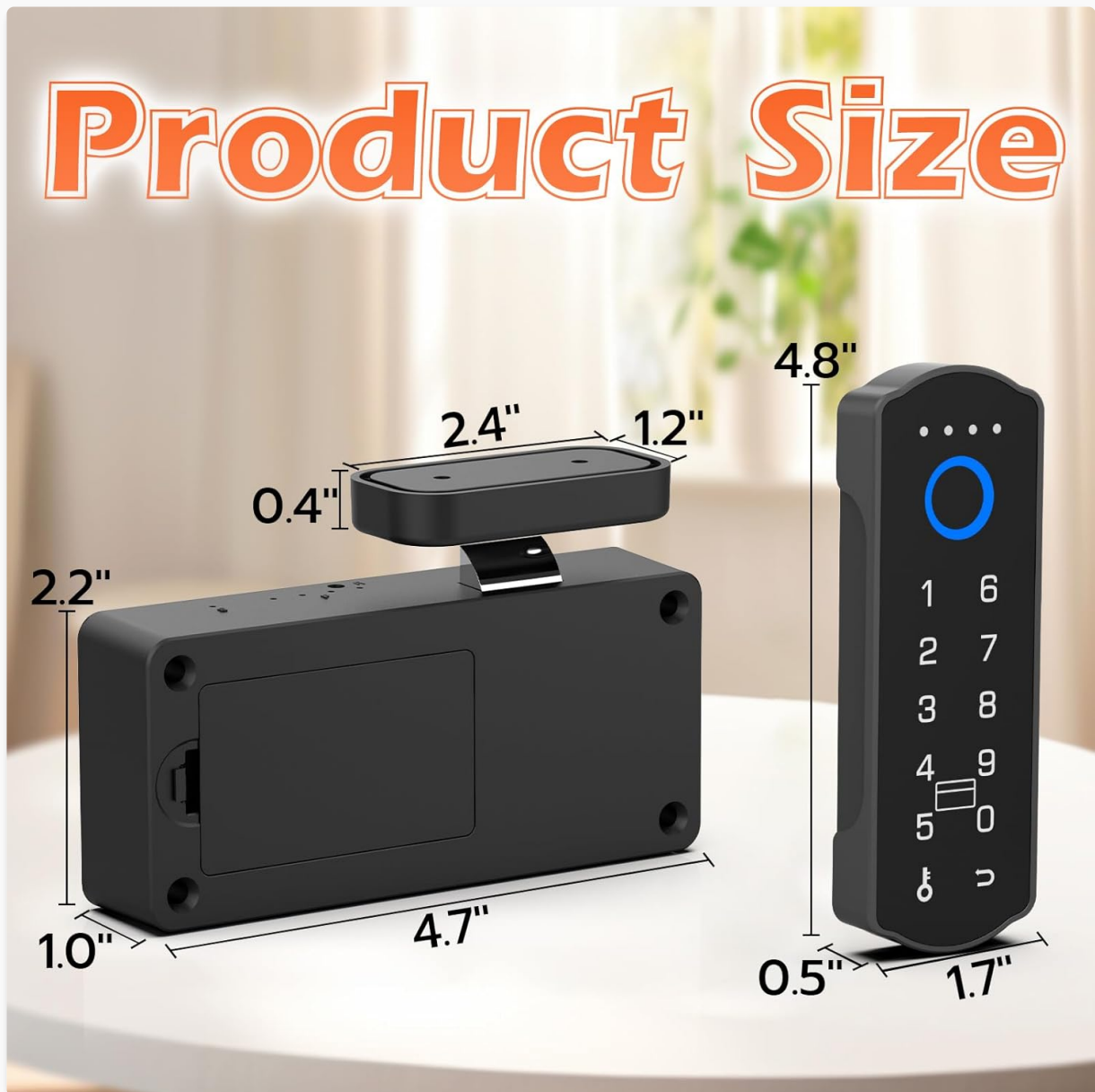
Image: Detailed product dimensions for the Eesemart Smart Cabinet Lock.