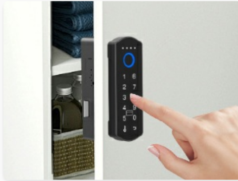
Image: Demonstrating passcode entry for unlocking the smart cabinet lock.

Enter your registered passcode on the keypad. The lock will disengage upon correct entry.