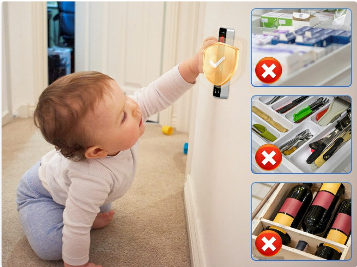
Image: The smart lock used for baby-proofing cabinets containing potentially harmful items.