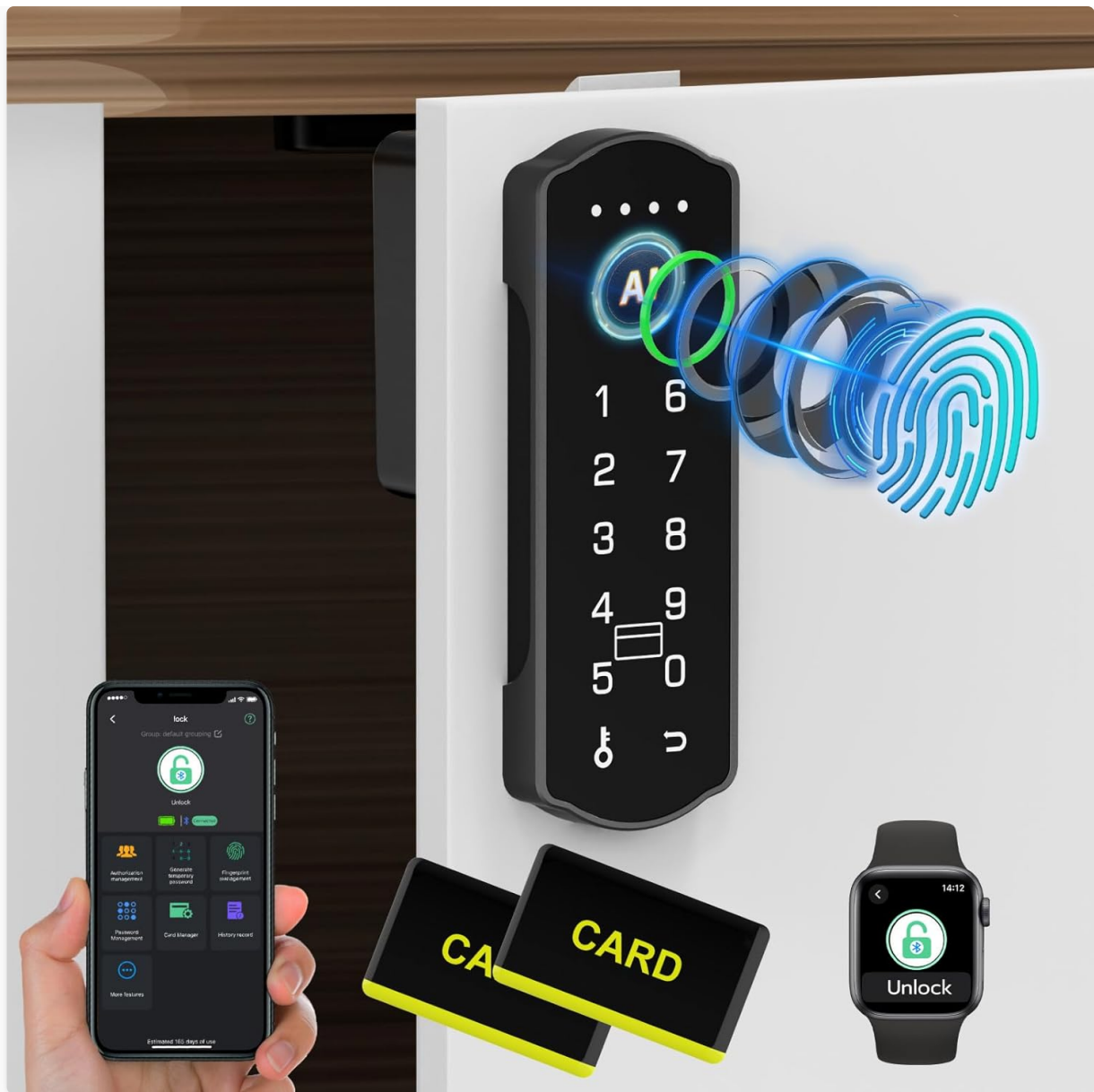
Image: Overview of the EseeSmart Smart Cabinet Lock components.