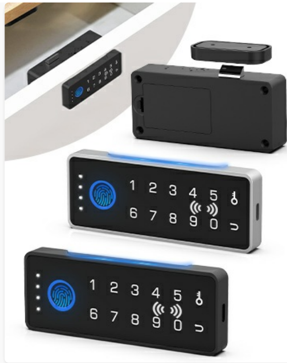
Image: All included components of the EseeSmart Smart Cabinet Lock.