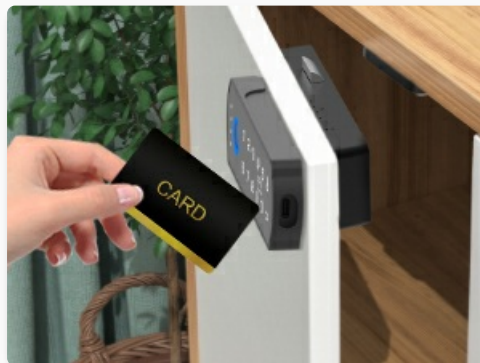
Image: Demonstrating RFID card usage to unlock the smart cabinet lock.

Swipe a registered RFID card over the designated area on the front lock body. The lock will disengage.