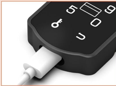
Emergency Power Via USB-C