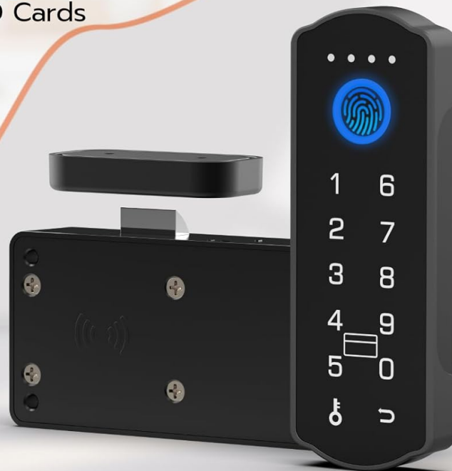
Image: Visual representation of the five available unlock methods for the smart cabinet lock.