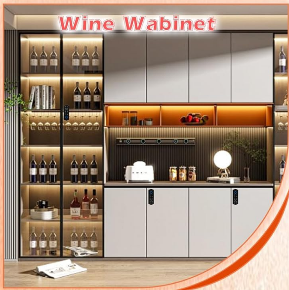
Image: Examples of the smart cabinet lock installed in various furniture types like drawers, wardrobes, and filing cabinets.