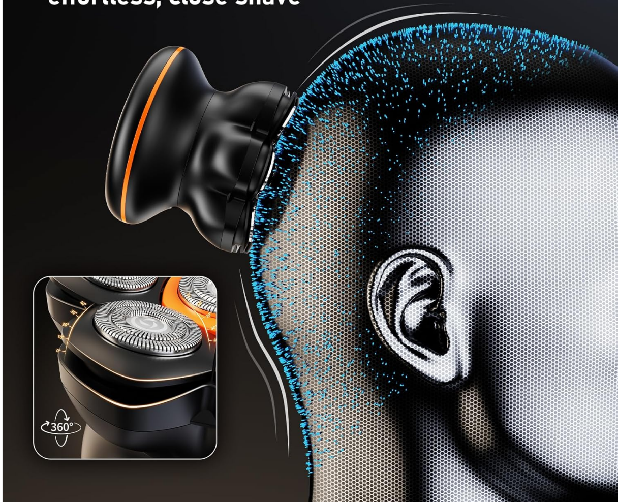
Figure 3.2: The magnetic shaving head separated from the shaver body, illustrating the ease of detachment for cleaning.

Contours seamlessly to your head for an effortless, close shave