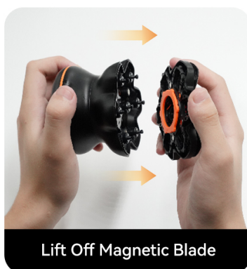
Lift Off Magnetic Blade