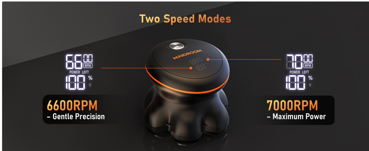
Figure 4.4: The shaver's LED display showing the two available speed modes: 6600 RPM for gentle precision and 7000 RPM for maximum power.

To switch between speeds, press the power button briefly while the shaver is on.