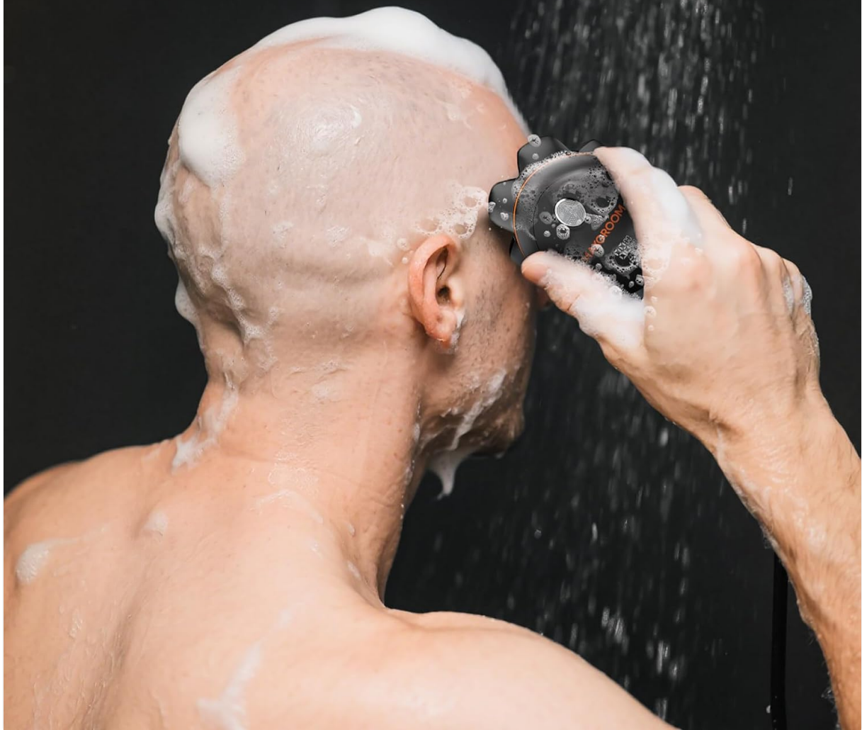
Figure 4.2: A user demonstrating the shower-safe use of the MAXGROOM 7D Head Shaver, highlighting its waterproof capability.