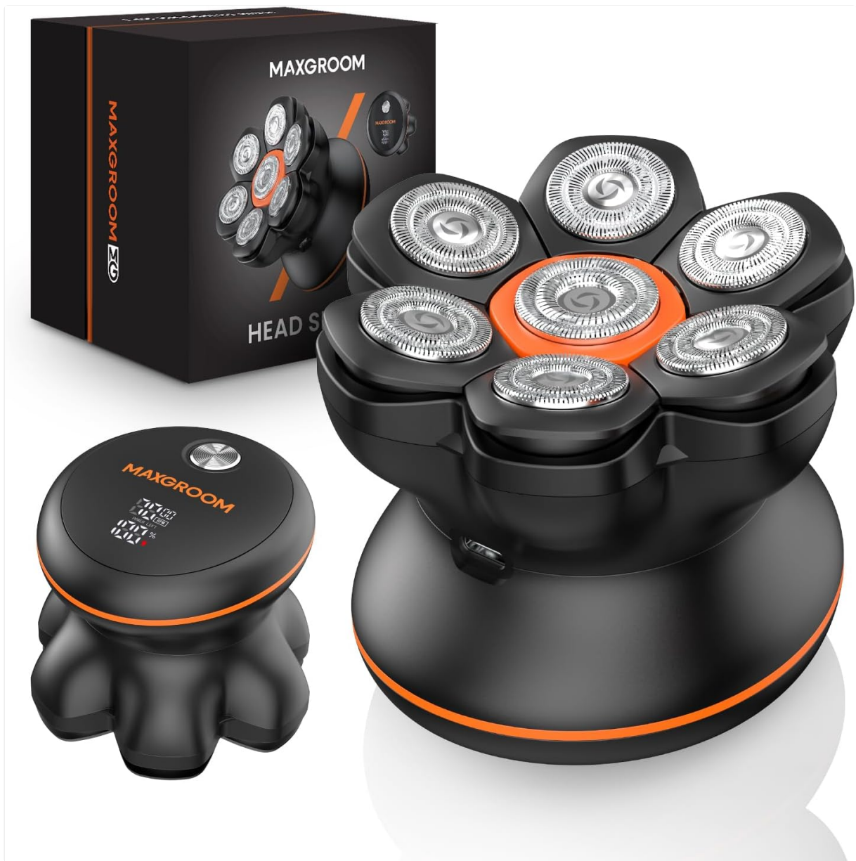
Figure 2.1: MAXGROOM 7D Head Shaver with its charging base. The shaver features a multi-blade head for comprehensive coverage.