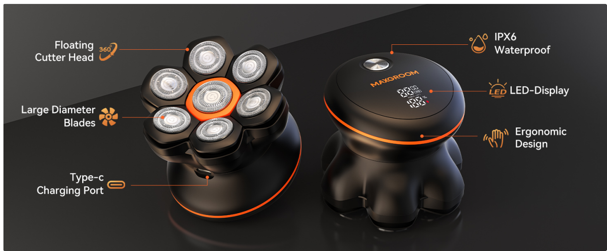
Figure 2.2: Visual representation of the shaver's key features, including the floating cutter head, large diameter blades, Type-C charging port, IPX6 waterproof rating, LED display, and ergonomic design.