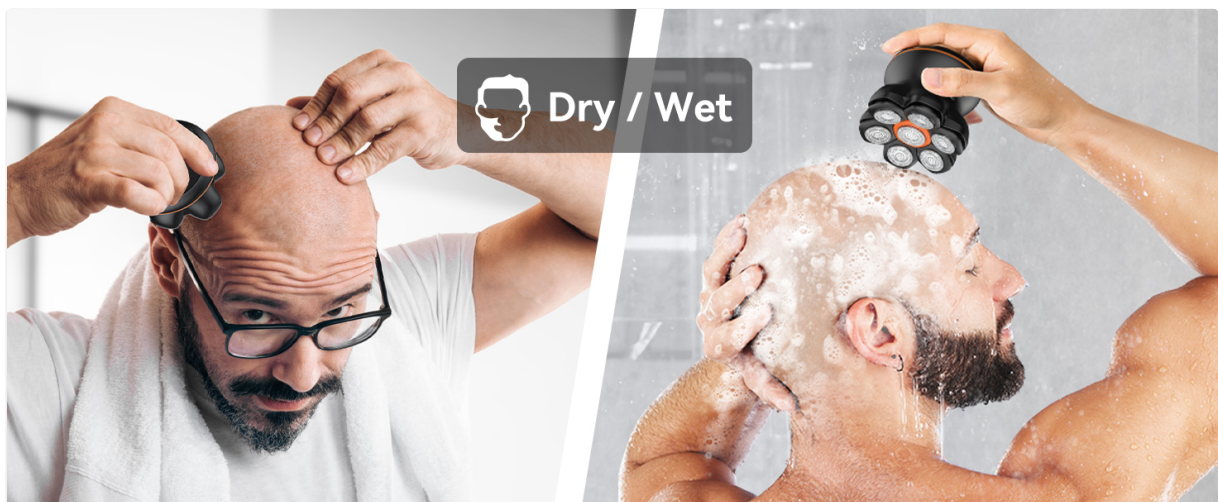
Figure 4.3: Illustrates the versatility of the shaver for both dry shaving (left) and wet shaving in the shower (right).