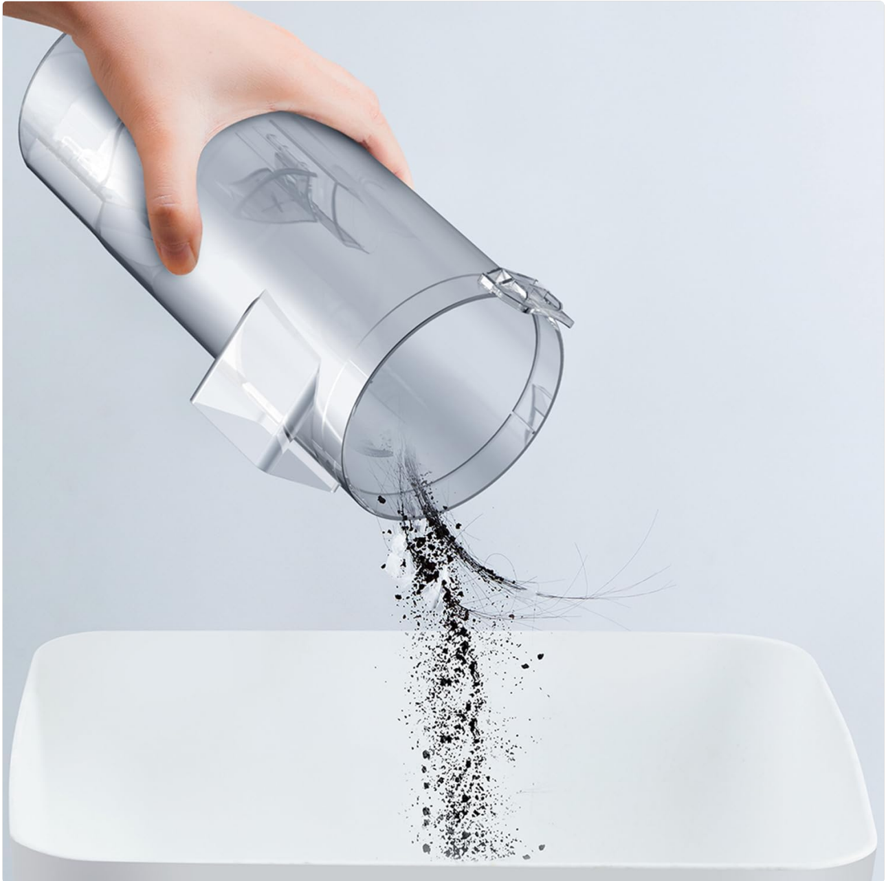
Image: A hand holding the transparent dust cup of the Deerma DX810 vacuum cleaner, demonstrating the process of emptying collected dust and debris into a waste bin.