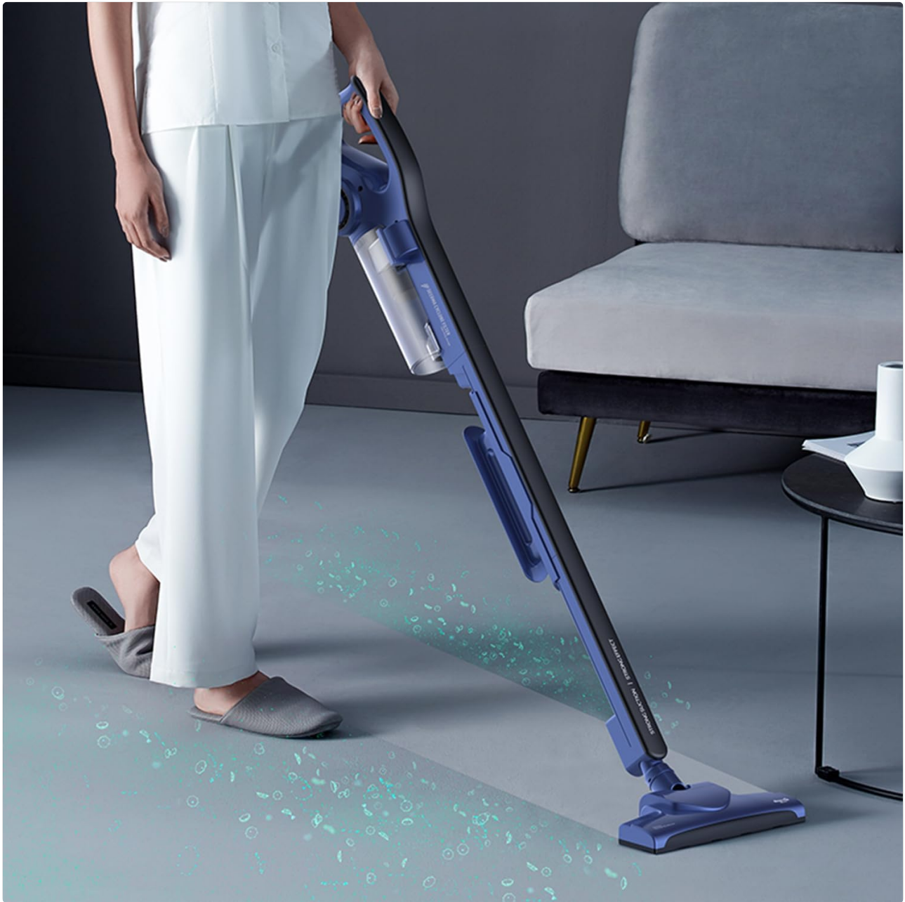
Image: A person operating the Deerma DX810 in stick vacuum mode on a hard floor, demonstrating its ease of use for general floor cleaning.