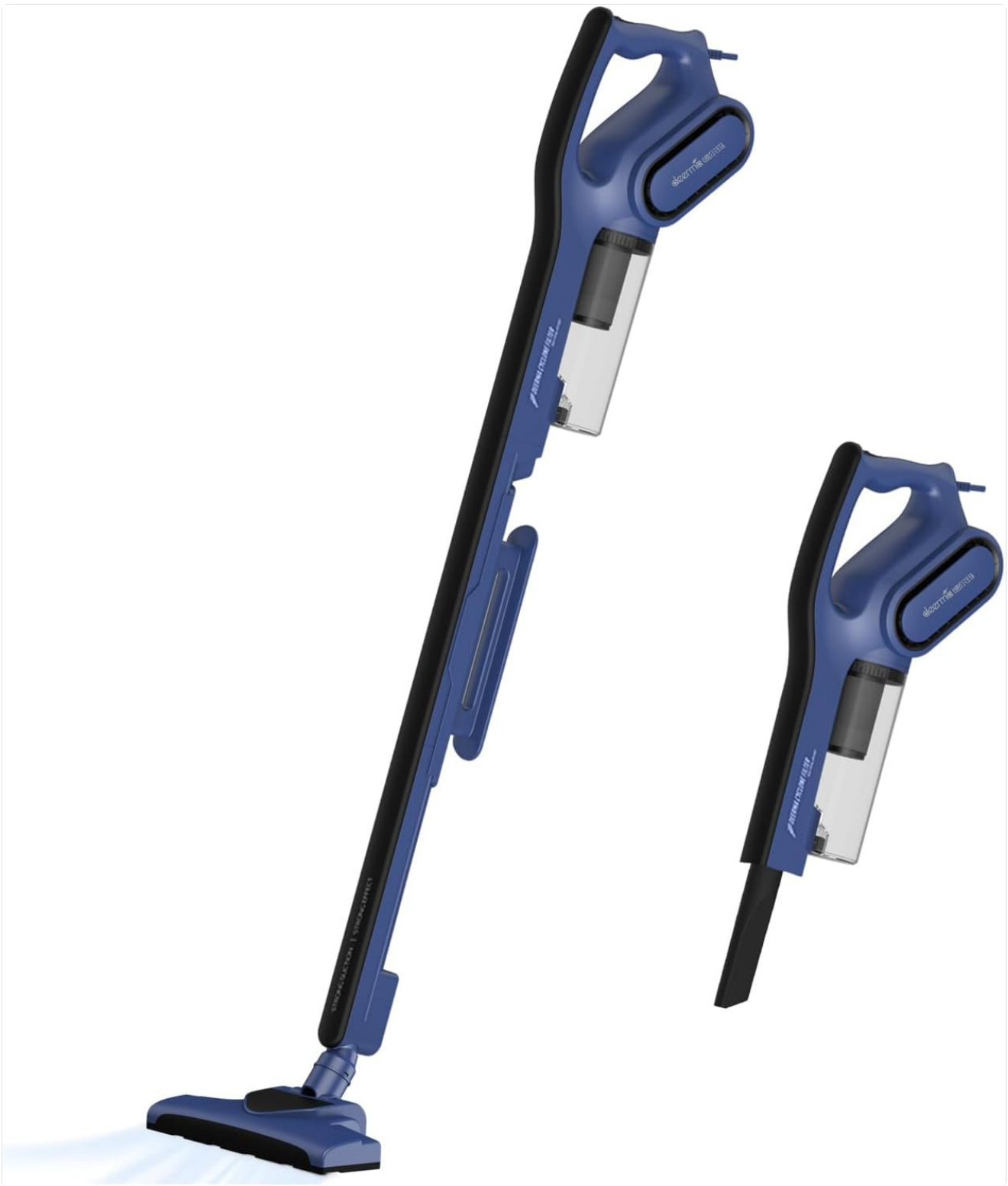
Image: The Deerma DX810 vacuum cleaner shown in both its full stick configuration and as a compact handheld unit, highlighting its dual functionality.