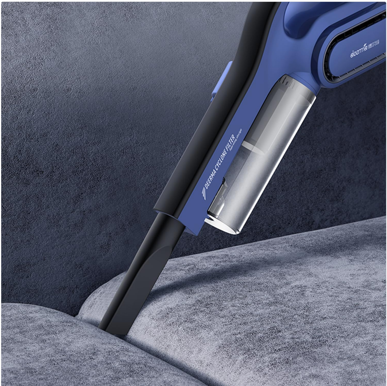
Image: A close-up of the Deerma DX810 being used in handheld mode with the crevice nozzle to clean between sofa cushions, illustrating its utility for tight spaces.