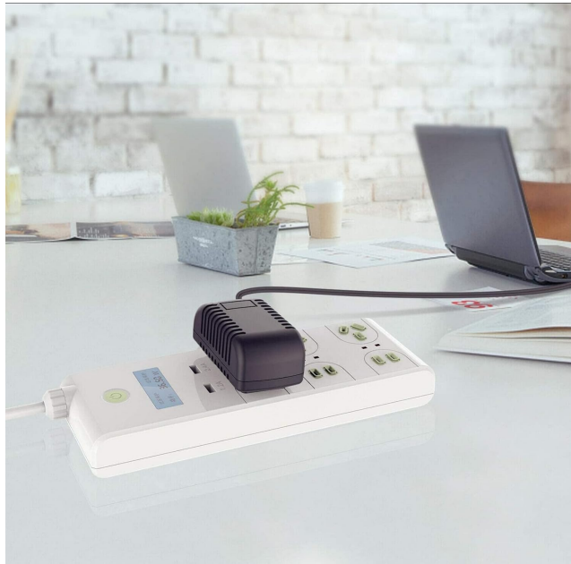
Figure 5.1: Adapter in use. This image shows the onerbl AC-DC Adapter plugged into a power strip, indicating its readiness for use in a typical office or home environment.