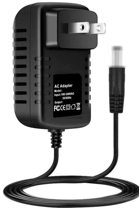
Figure 4.1: Front view of the onerbl AC-DC Adapter. This image displays the adapter's main body, the two-prong plug, and the DC output cable. The label on the adapter clearly shows "AC Adapter" and "Input: 100-240VAC 50/60Hz" and "Output:".