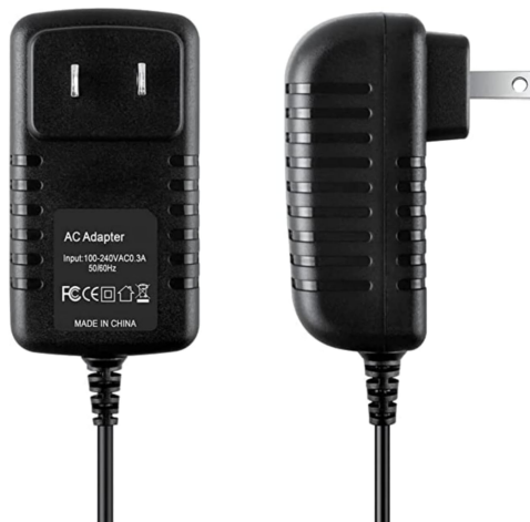
Figure 4.2: Front and side view of the onerbl AC-DC Adapter. This image provides two perspectives: one directly facing the adapter's label and plug, and another showing its side profile, highlighting its compact design. The label also indicates "MADE IN CHINA".