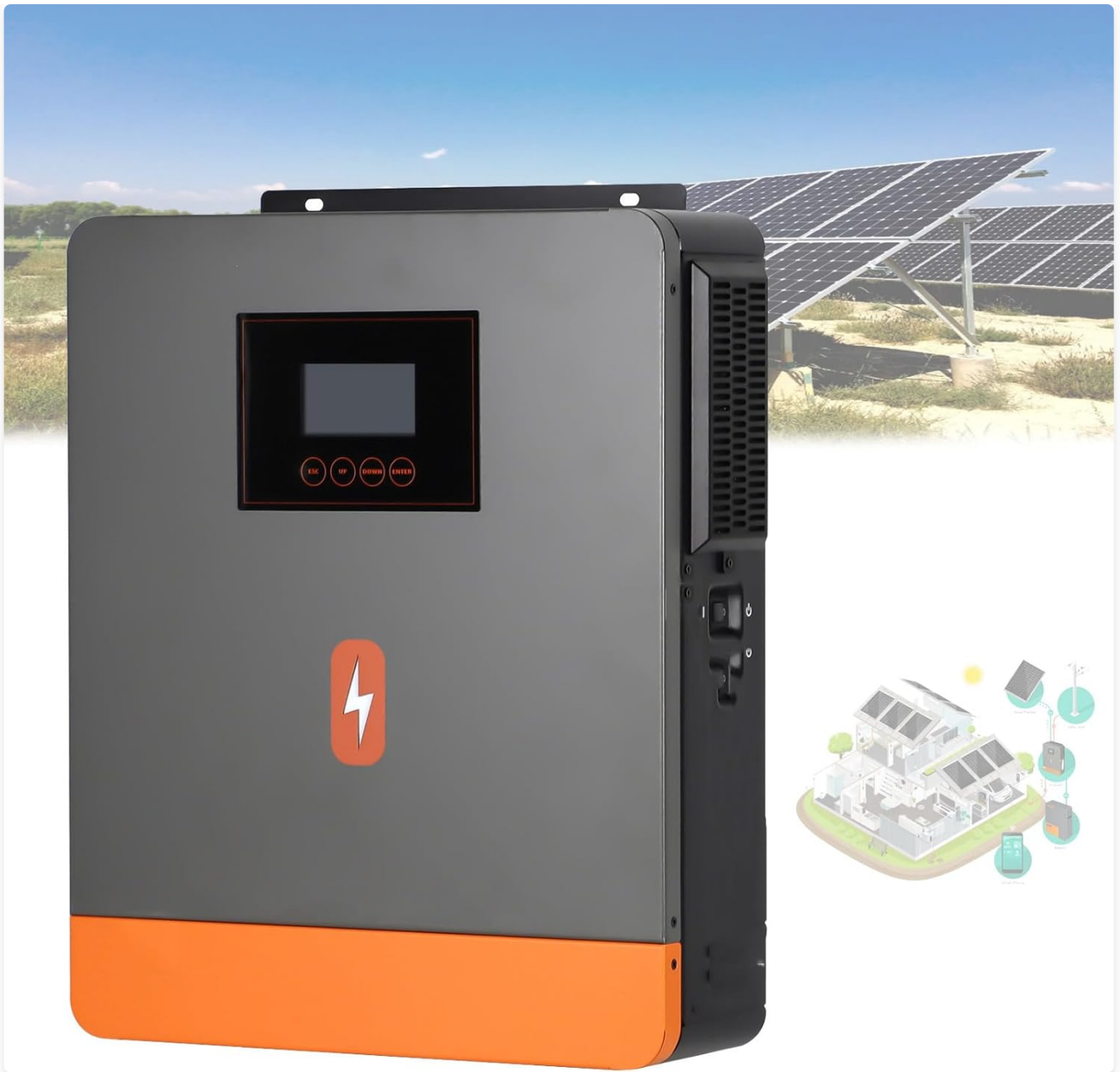
Image 1.1: LMFLXOFD 3600W Hybrid Pure Sine Wave Solar Inverter with solar panels.