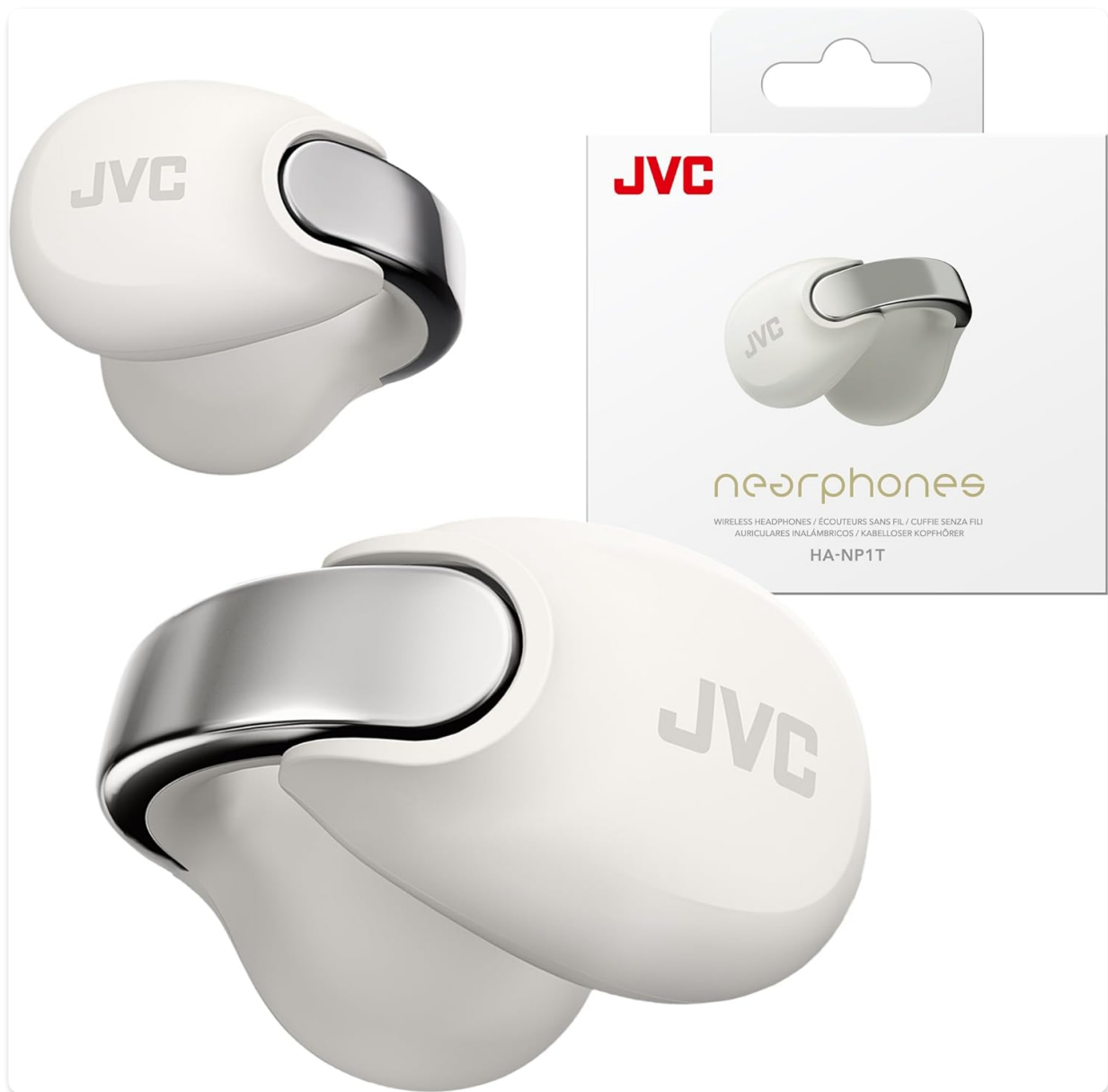
Image: JVC Nearphones HA-NP1T earbuds and their retail packaging, highlighting the product's design.