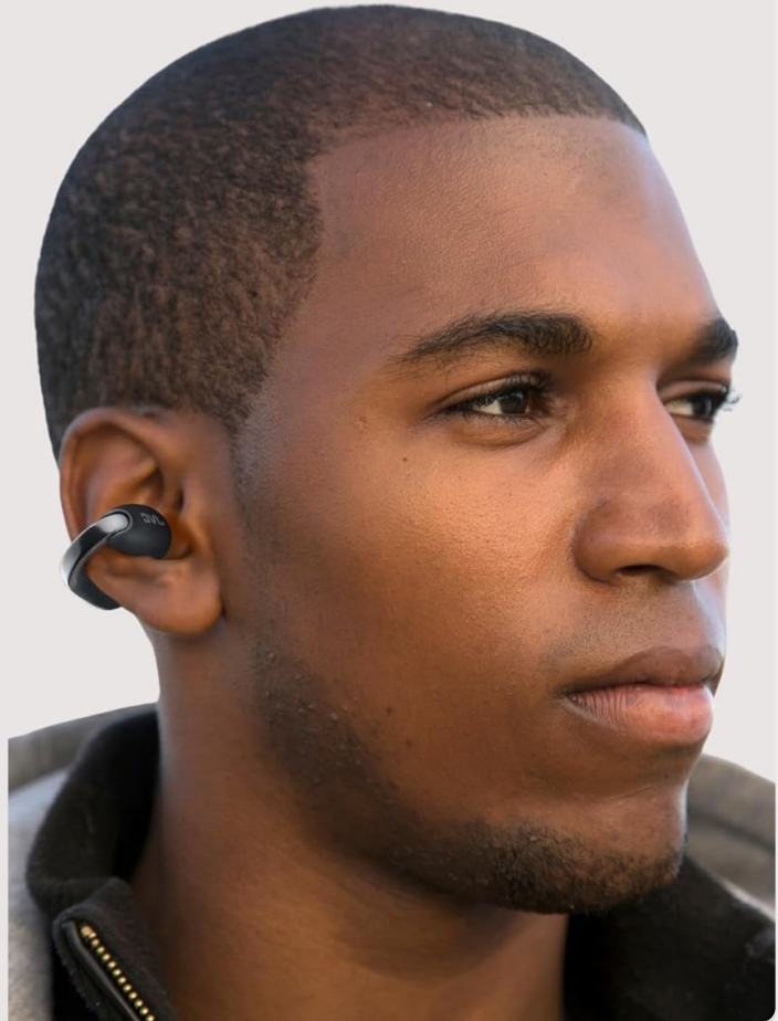
Image: A man wearing a JVC Nearphone HA-NP1T earbud, illustrating how the adaptable design fits securely and comfortably on the ear, weighing only 4.85g per ear.

Hugs your ears snugly weighing just 4.85g per ear