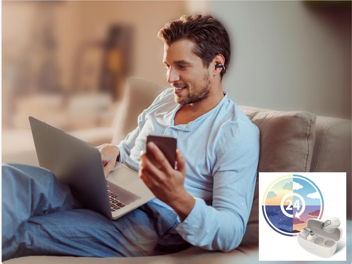
Image: A man wearing JVC Nearphones HA-NP1T while using a laptop and phone, illustrating the extended battery life feature.

Enjoy up to 8 hours of continuous playback on a single charge, plus an extra 16 hours from the compact charging case.