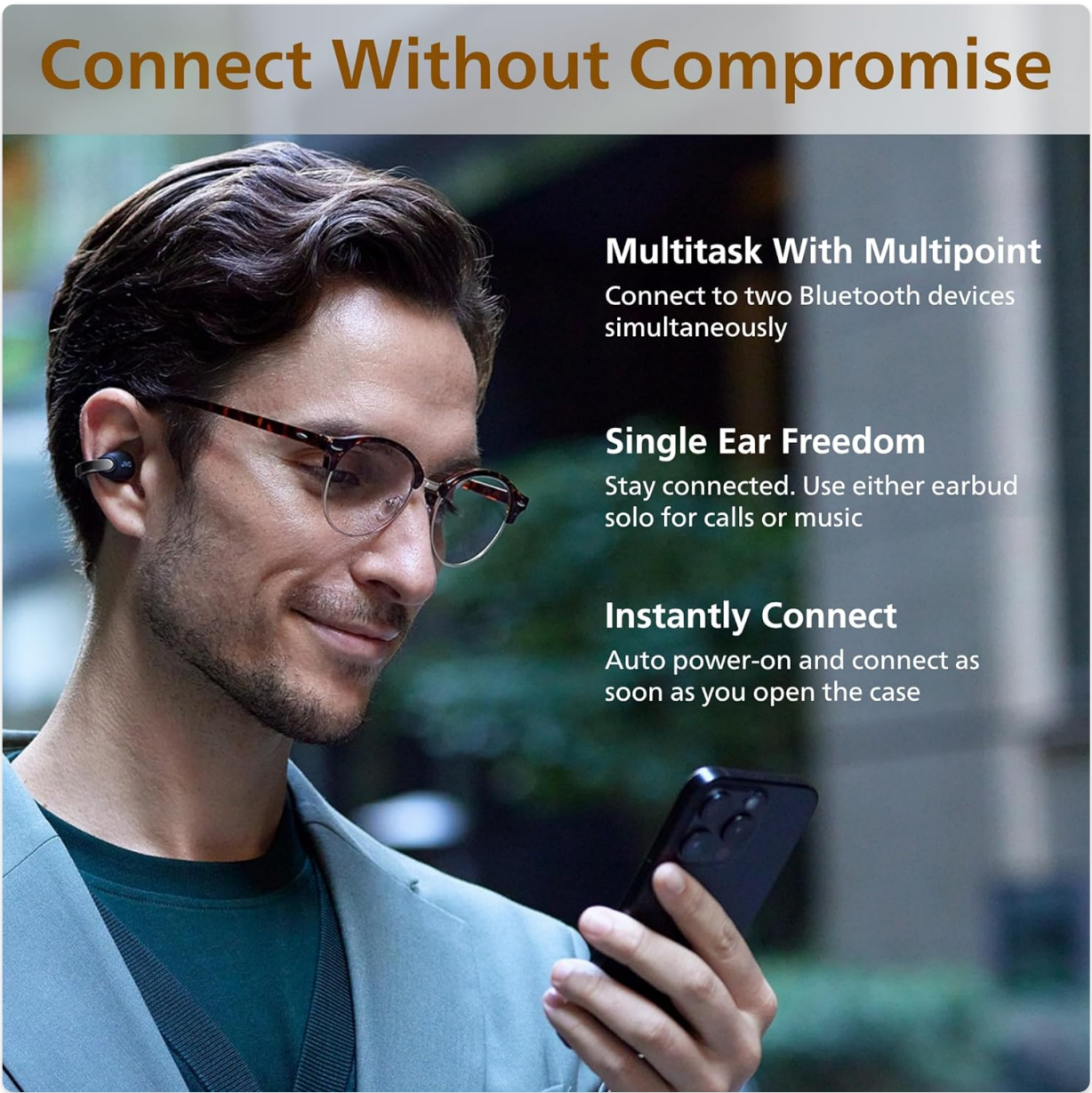
Image: A man interacting with his smartphone, illustrating the seamless connectivity features of the JVC Nearphones HA-NP1T, including the ability to multitask with multipoint connections, use a single earbud, and instantly connect upon opening the case.