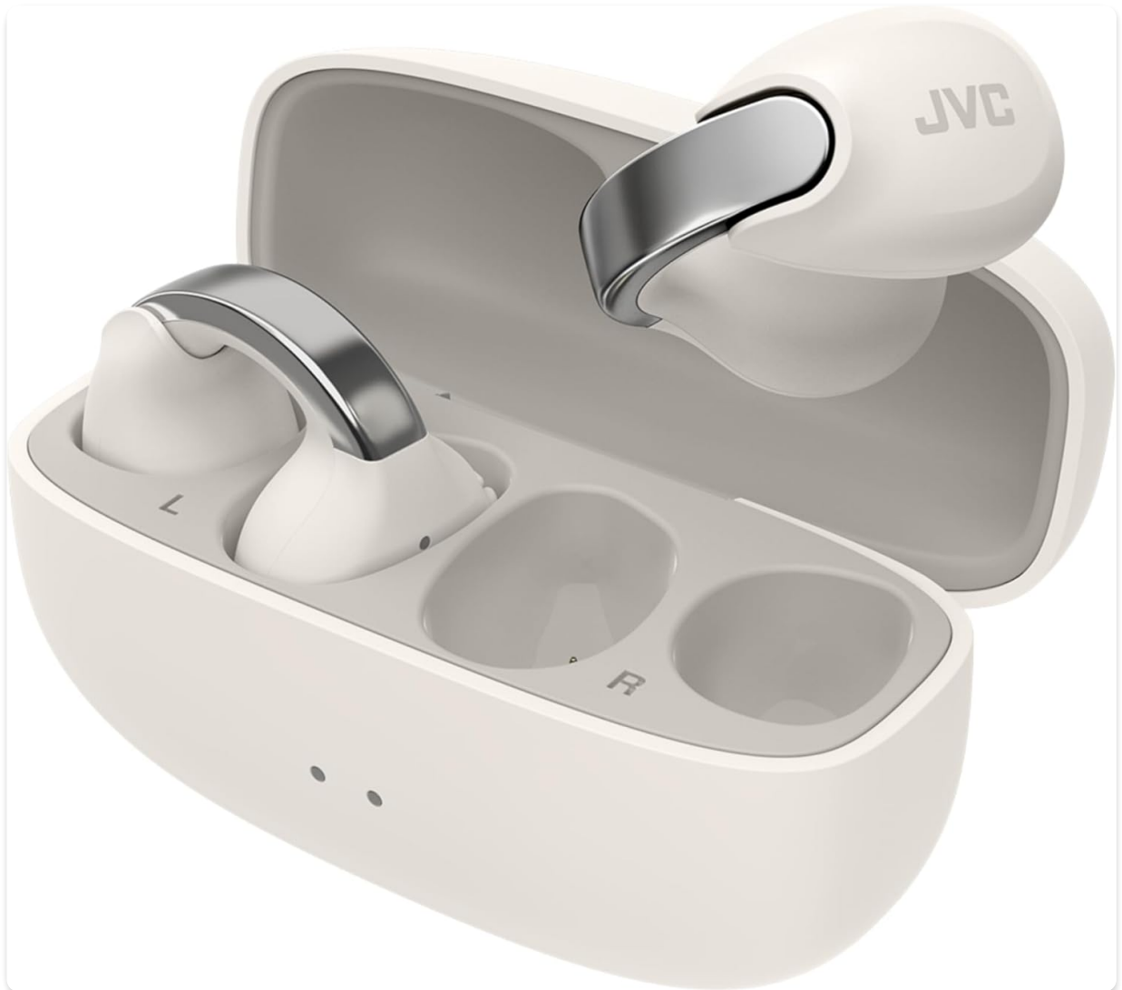
Image: The JVC Nearphones HA-NP1T earbuds placed inside their open charging case, showing the charging contacts and the compact design.

The JVC Nearphones HA-NP1T consist of two earbuds and a charging case. Each earbud features a control button and a microphone. The charging case includes a USB-C port for charging and LED indicators for battery status.