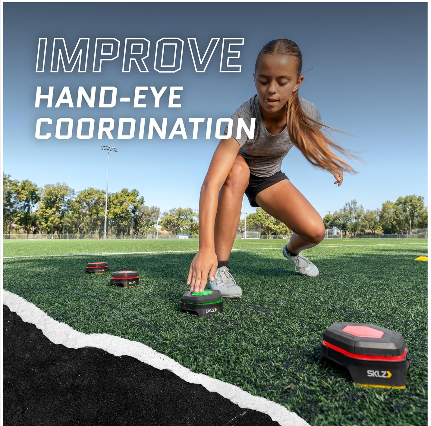
Image: A girl demonstrating improved hand-eye coordination by interacting with the pods on a field.

These games utilize the multi-directional activation of the pods, with bright LED lights (Red, Blue, Yellow, Green) keeping athletes engaged and responsive. The versatility allows for sport-specific training or general athletic performance development across various sports, ages, and skill levels.