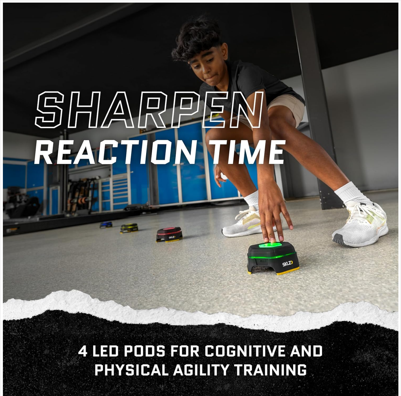
Image: An athlete engaging with a pod, illustrating the interactive nature of the training.

The main pod displays real-time scores, allowing you to track your progress and performance during each session. This instant feedback helps in monitoring improvement over time.