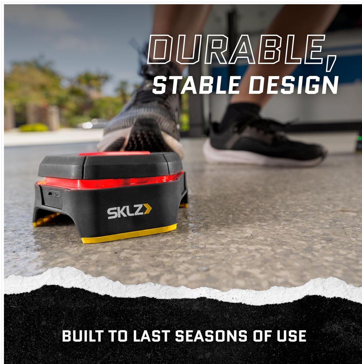
Image: A close-up view of a pod, highlighting its durable and stable design for long-term use.