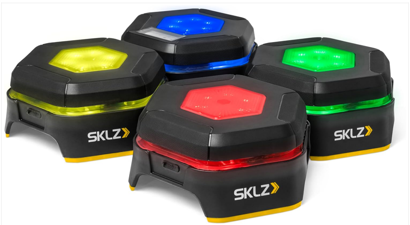
Image: The SKLZ Reactive Flash LED Training Pods, showcasing the four distinct colored pods.

The SKLZ Reactive Flash LED Training Pods are a cognitive agility tool designed to enhance reaction time, hand-eye coordination, speed, and quickness. This system utilizes four LED pods with pre-programmed games to facilitate engaging and effective training sessions. It supports various configurations, allowing for solo practice or multi-player challenges, and is built for durability across different training environments.