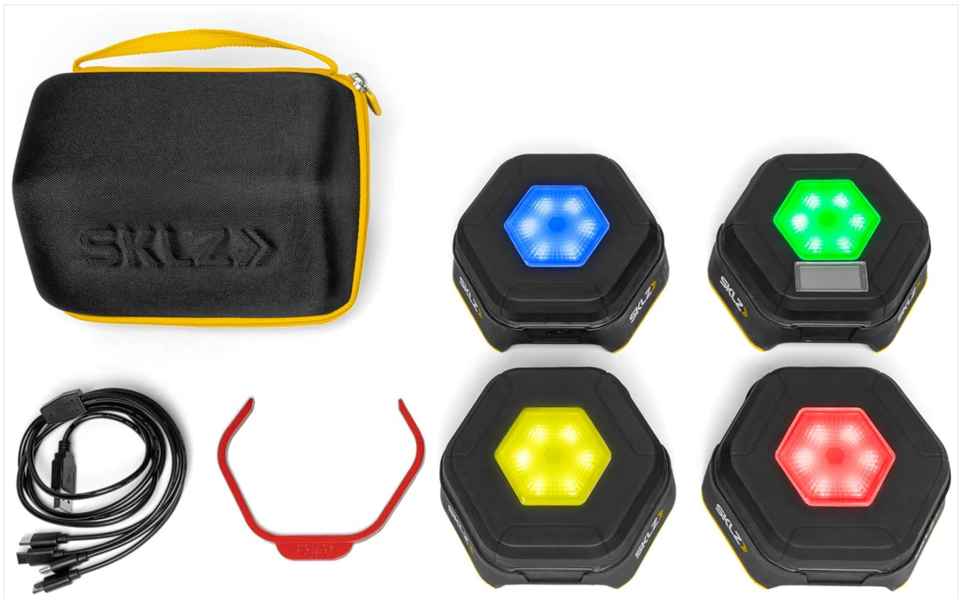
Image: Complete set of SKLZ Reactive Flash LED Training Pods, including pods, charging cable, and carrying case.