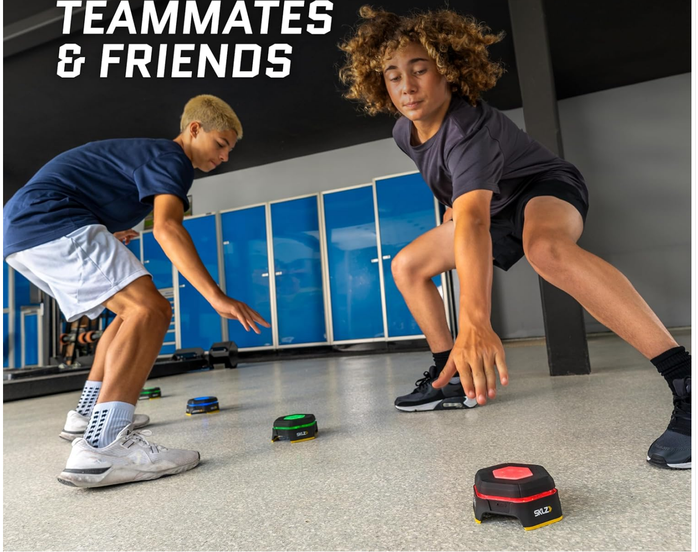
Image: Two athletes engaging in a multi-player session, highlighting the solo or team challenge options.