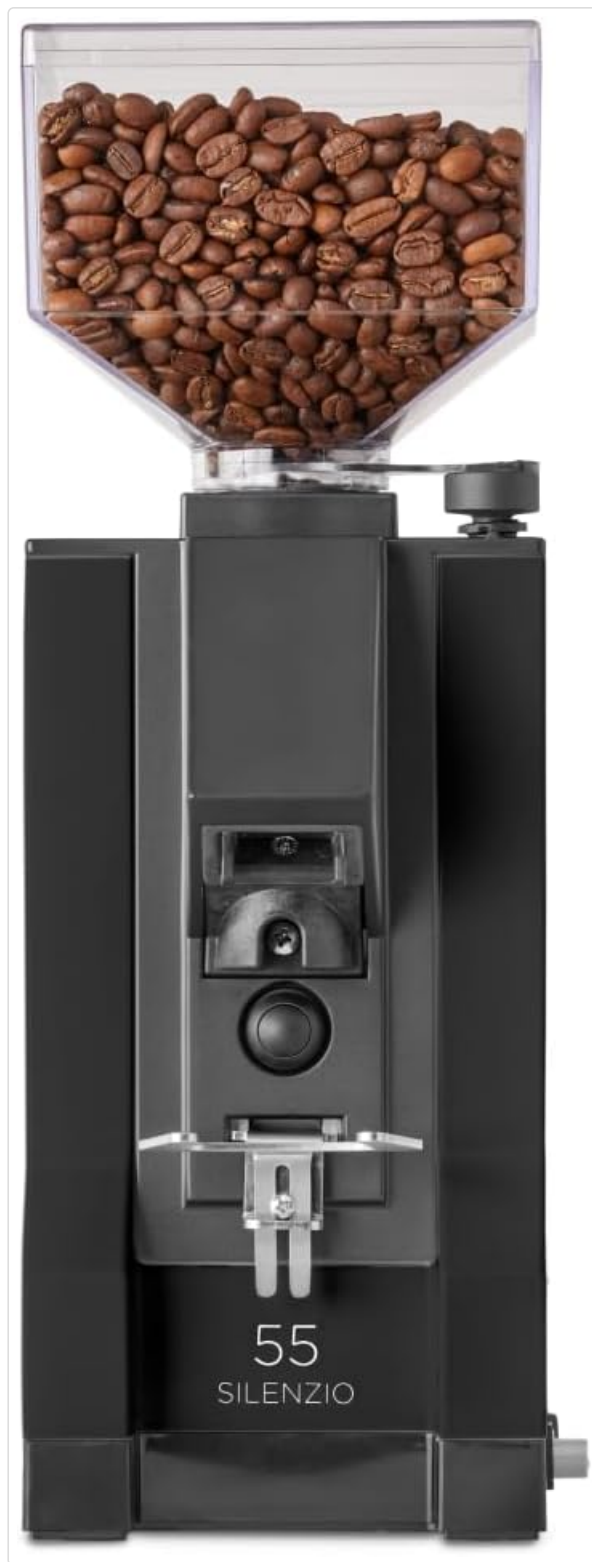
Front view of the Eureka Mignon Silenzio Espresso Grinder. This image shows the grinder's compact design with the bean hopper on top and the grinding chute at the front.