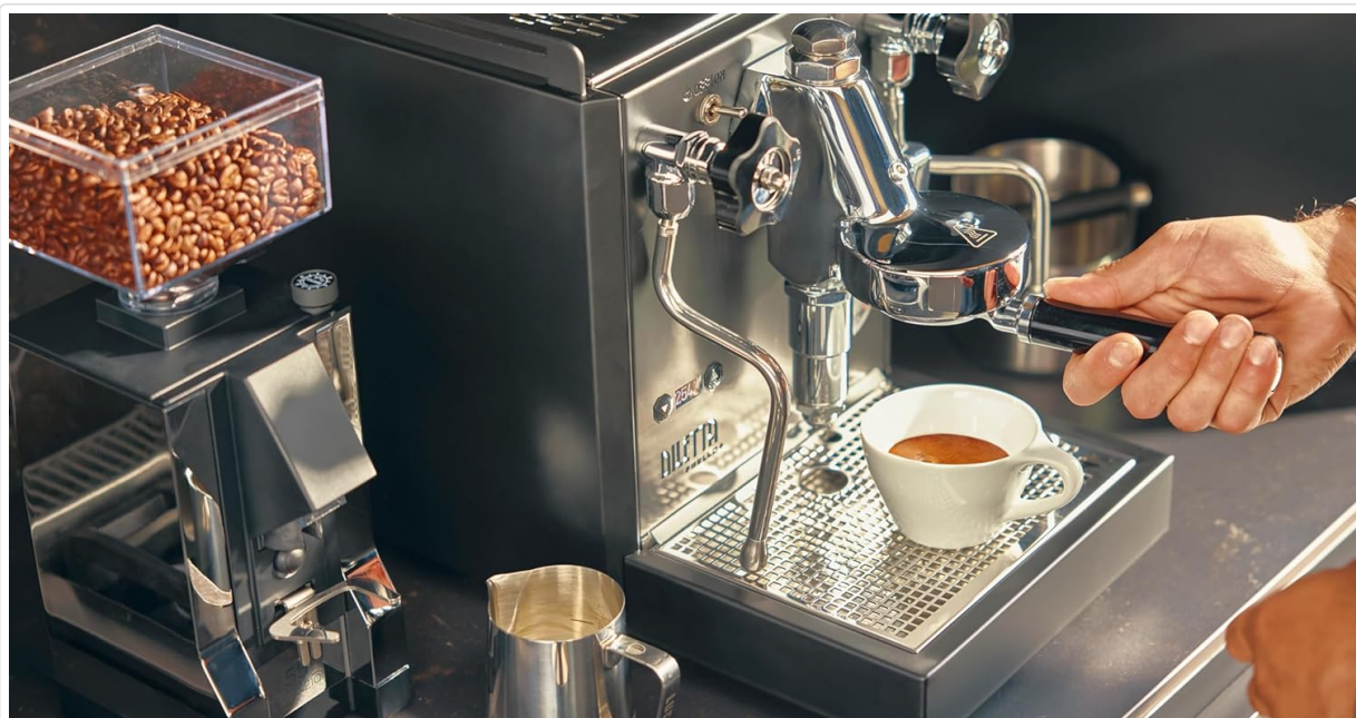
The Eureka Mignon Silenzio grinder in operation, dispensing freshly ground coffee into a portafilter. This demonstrates the grinder's functionality for direct dosing.