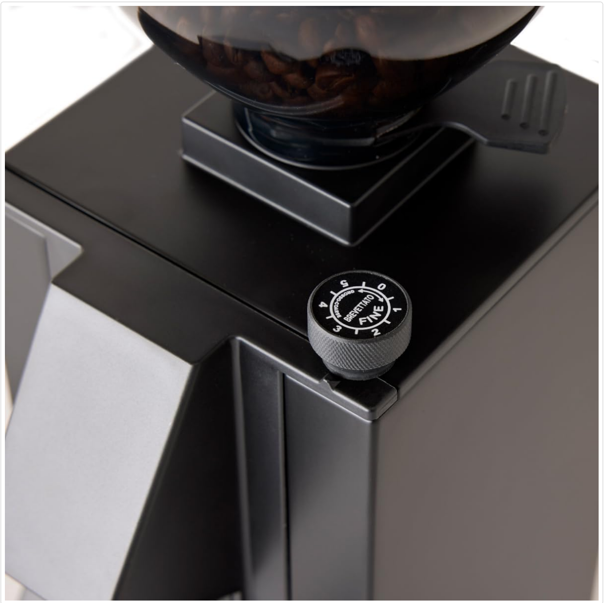
Close-up of the timed dosing dial. This dial allows users to set the duration of the grinding cycle for consistent coffee doses.