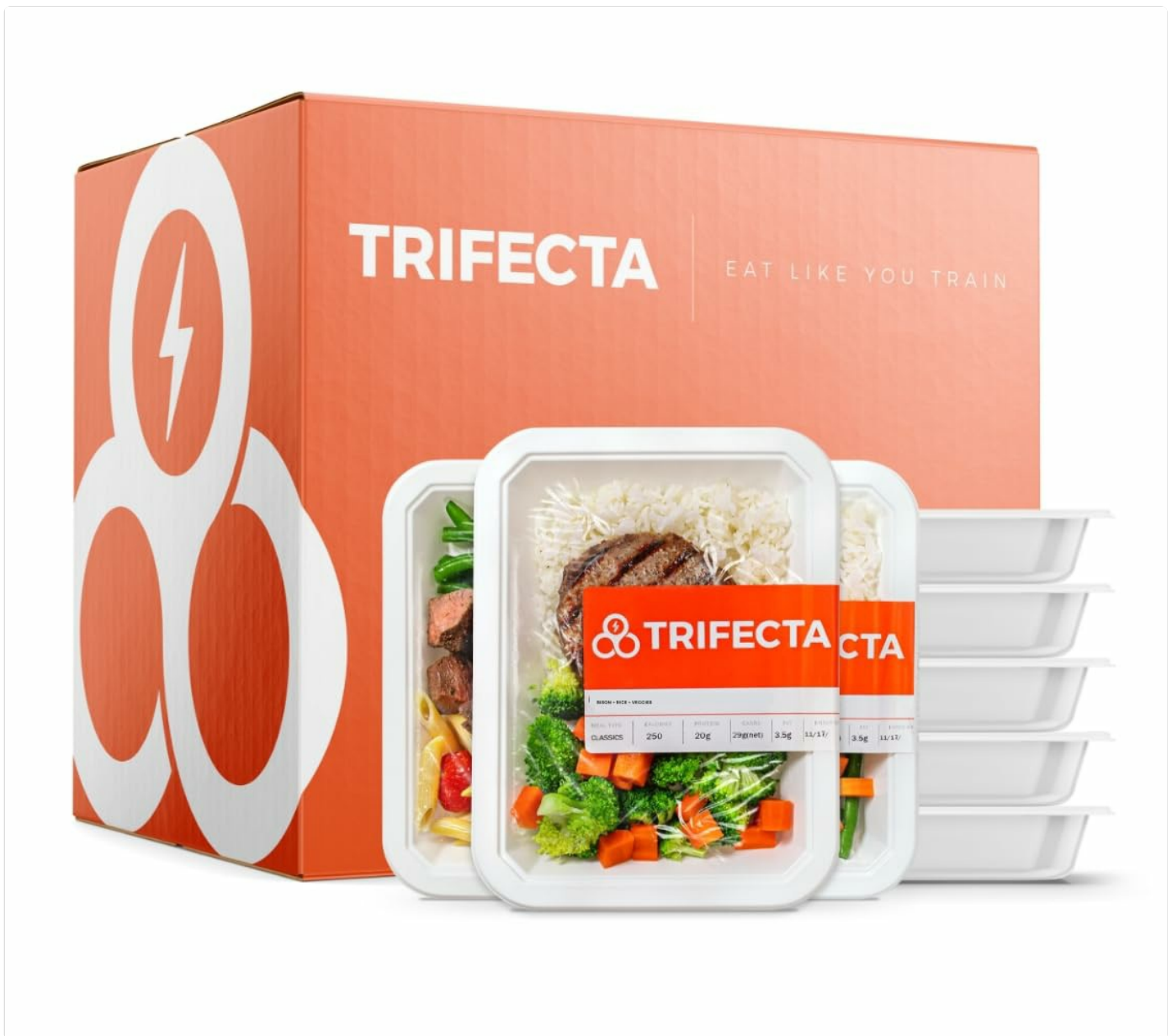
Image: The Trifecta Keto Meal Box, showcasing the main packaging and several individual meal containers ready for preparation.