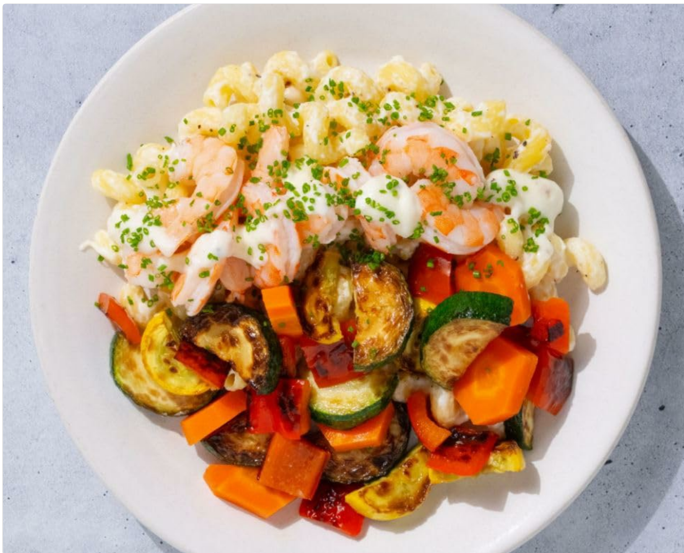
Image: An example of a prepared Trifecta meal, featuring cooked shrimp, pasta, and roasted vegetables, ready for consumption.