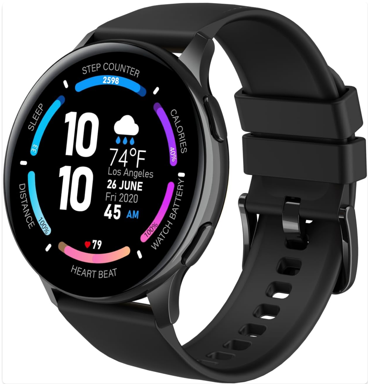
The 3Plus Callie Smartwatch, showcasing its sleek design and vibrant display.