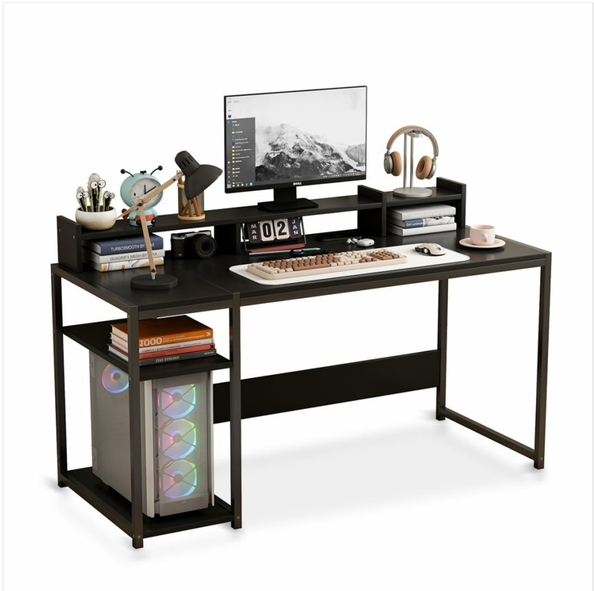
Image: The Lafulaifu Computer Desk, showcasing its spacious desktop and integrated shelving for various uses.