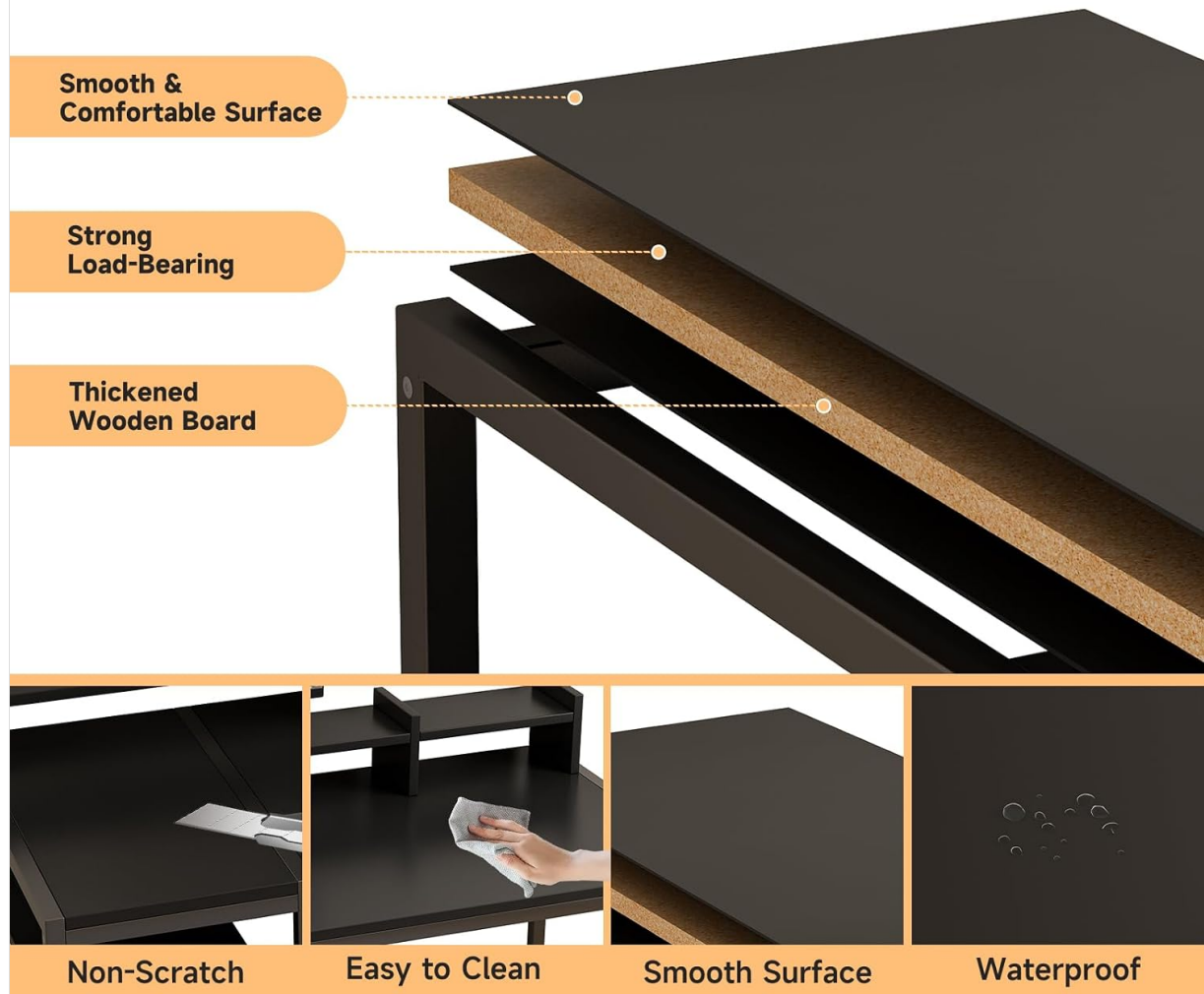
Image: Detailed view of the desktop material, highlighting its smooth, durable, and easy-to-maintain characteristics.