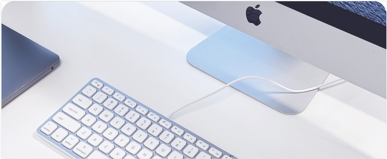
Figure 4.2: Integrated USB hub with 2x USB-C and 1x USB-A ports.