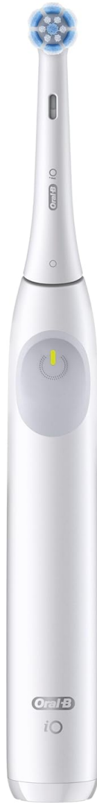
Image: Close-up of the Oral-B iO Simple Clean toothbrush handle with a brush head.