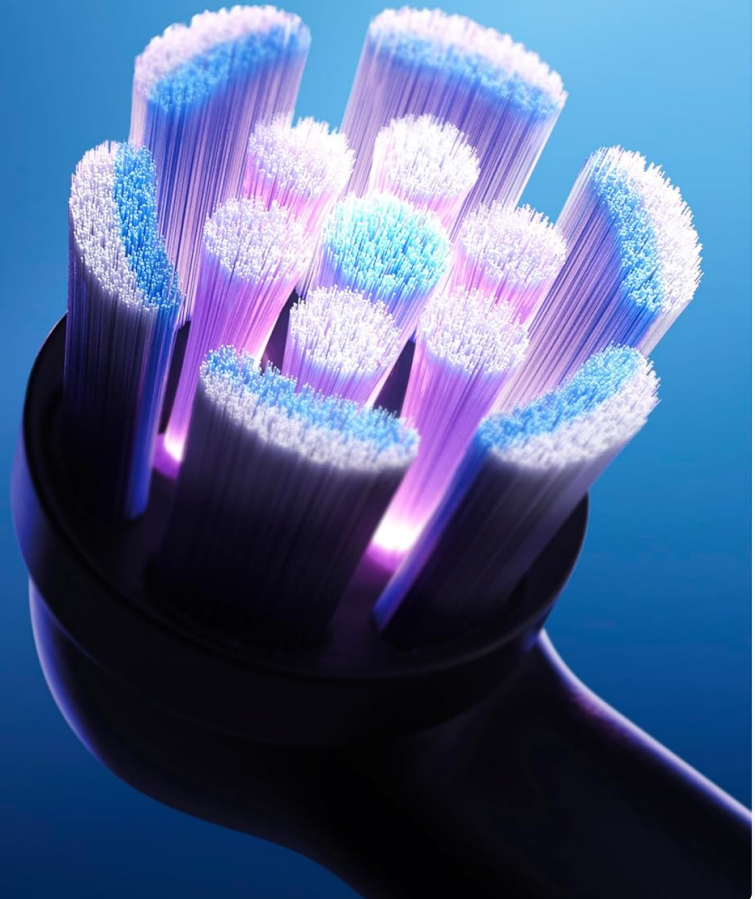
Image: Detailed view of the Oral-B iO brush head, illustrating the soft and high-density bristles designed for effective and gentle cleaning.