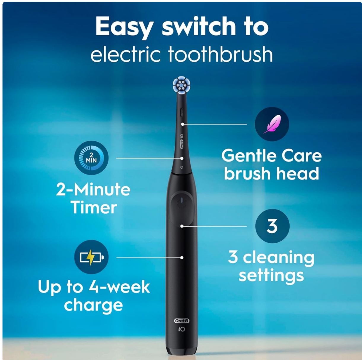
Image: Key features of the Oral-B iO Simple Clean toothbrush, including its timer, brush head type, cleaning modes, and battery life.