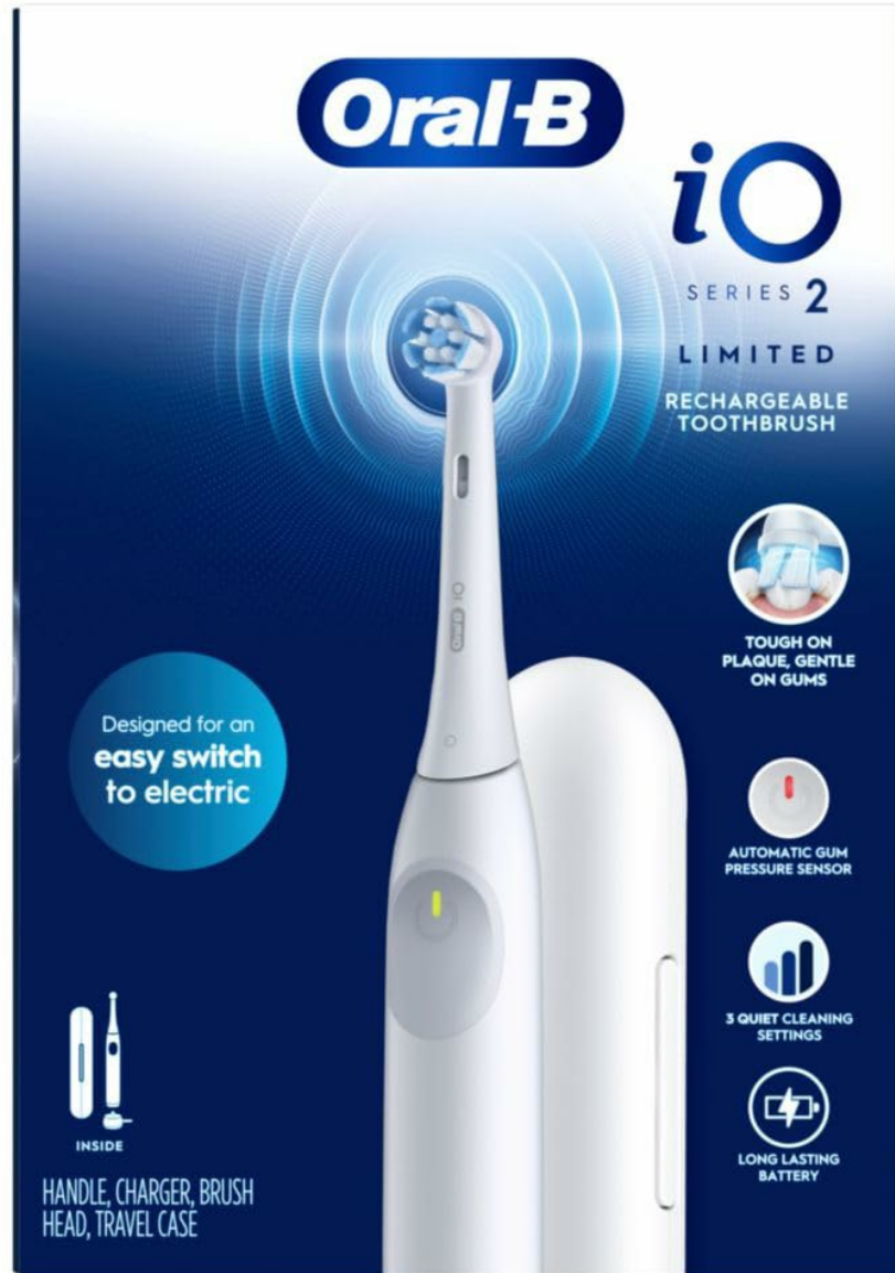
Image: The Oral-B iO Simple Clean toothbrush handle, charging base, and travel case.