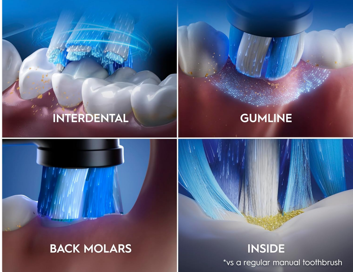
Image: Illustration of the Oral-B iO Round Brush Head's cleaning action on various tooth surfaces, including interdental, gumline, back molars, and inside surfaces.