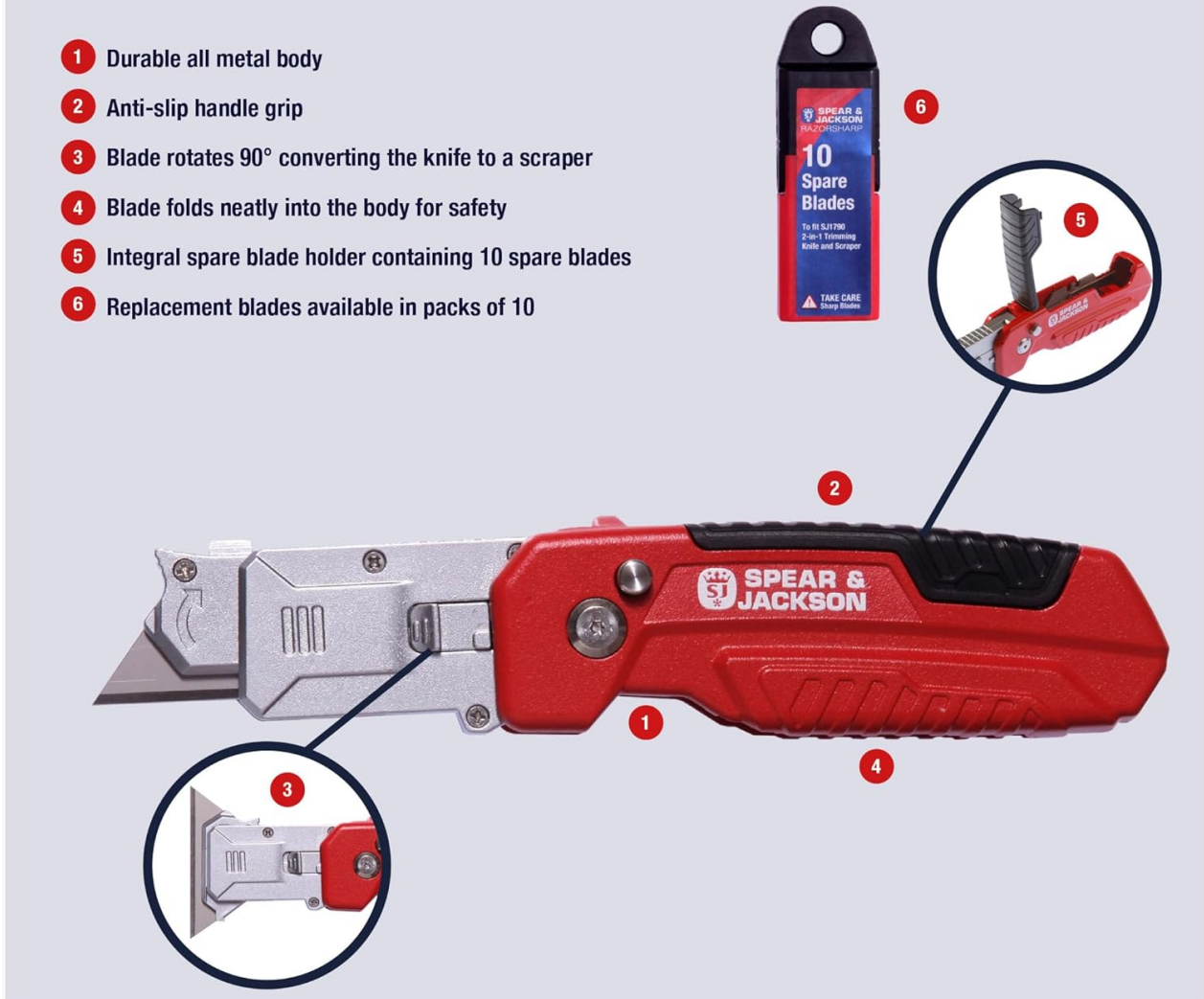
Image 2.1: Features and benefits of the SJ1790, highlighting the integral spare blade holder and the mechanism for blade rotation.