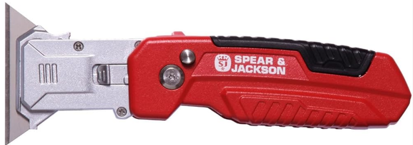
Blade shown as Scraper