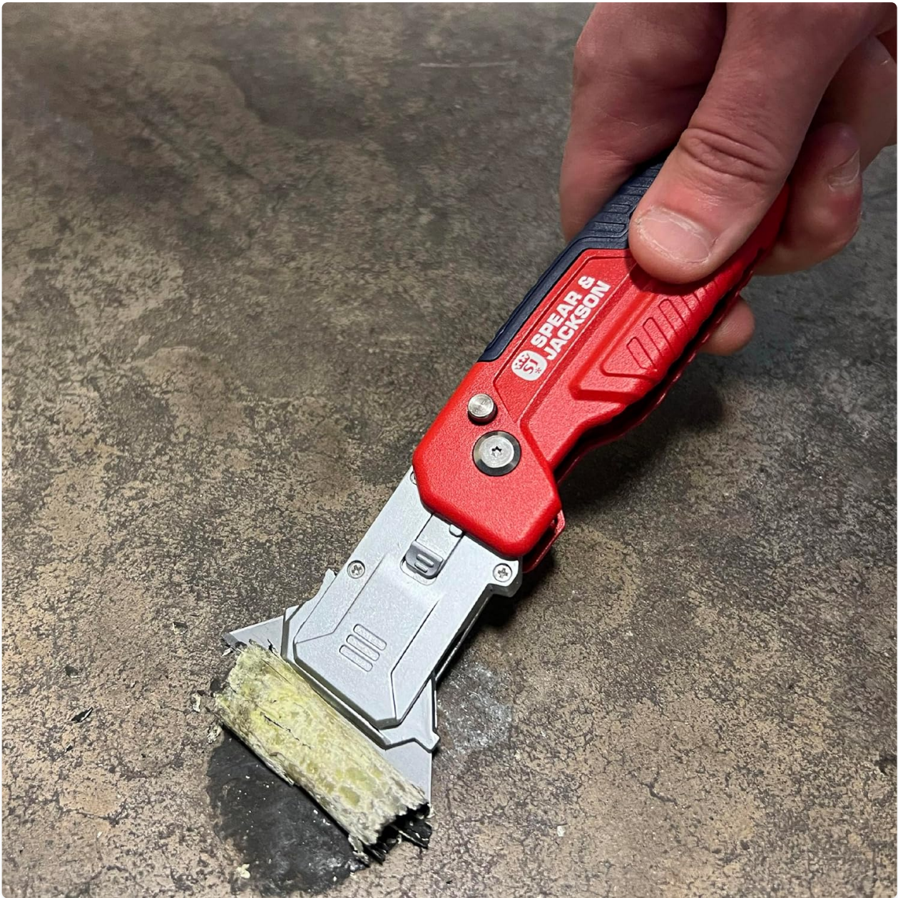
Image 3.2: The SJ1790 being used in scraper mode for removing material.