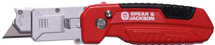
Blade shown as trimming knife