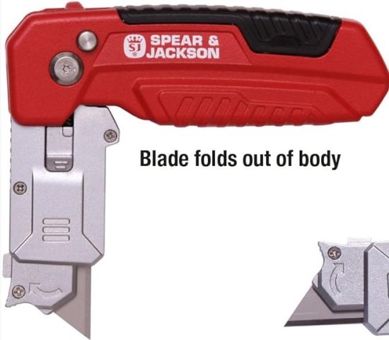
Blade folds out of body