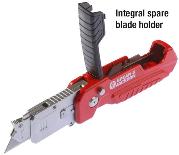
Integral spare blade holder