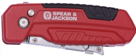
Blade retracts for safe storage