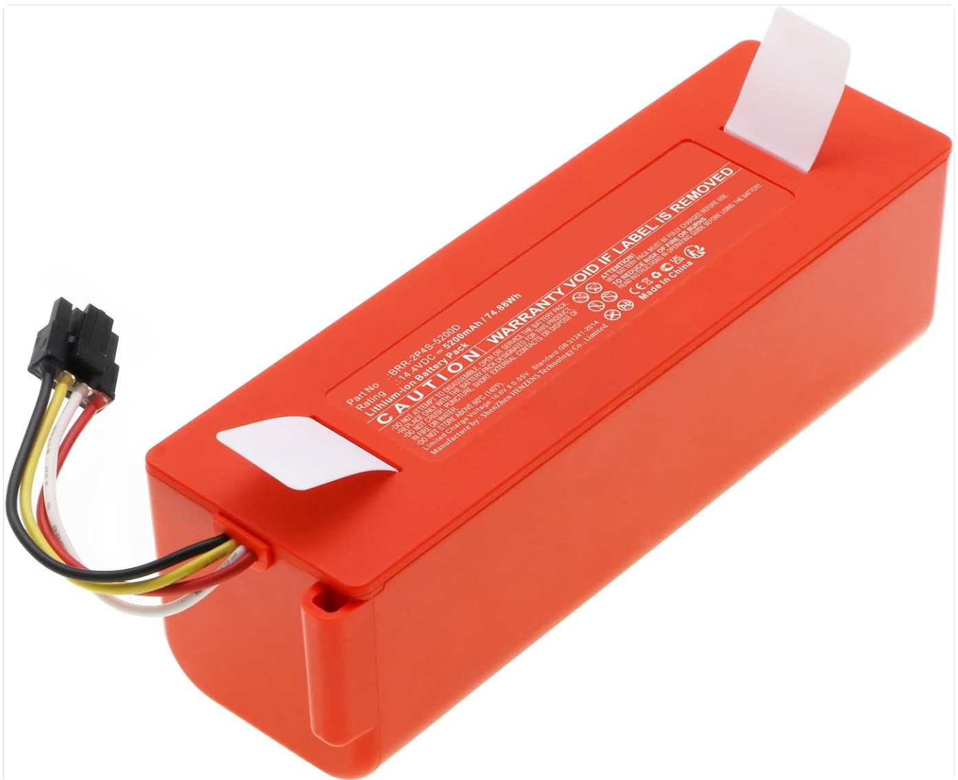
Image: The Synergy Digital Vacuum Cleaner Battery, showing its compact orange casing and connector wires.