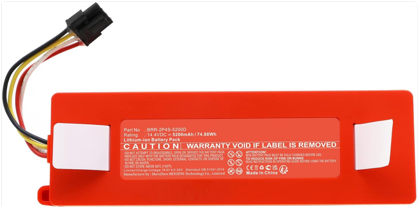
Image: Top view of the battery showing important safety and warranty labels.