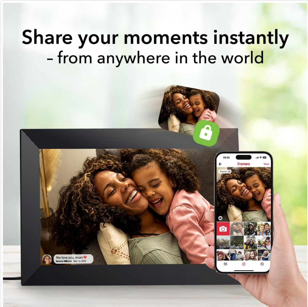
Image: A digital photo frame displaying a photo, with a smartphone showing the Frameo app interface for sharing moments instantly.

Use the Frameo app to select photos and videos from your mobile device. You can select multiple items at once. Before sending, you can adjust the cropping of photos and add captions to provide context for your memories. The Frameo app supports multi-user connections, allowing multiple individuals to send media to the same frame. All transfers are end-to-end encrypted for privacy.