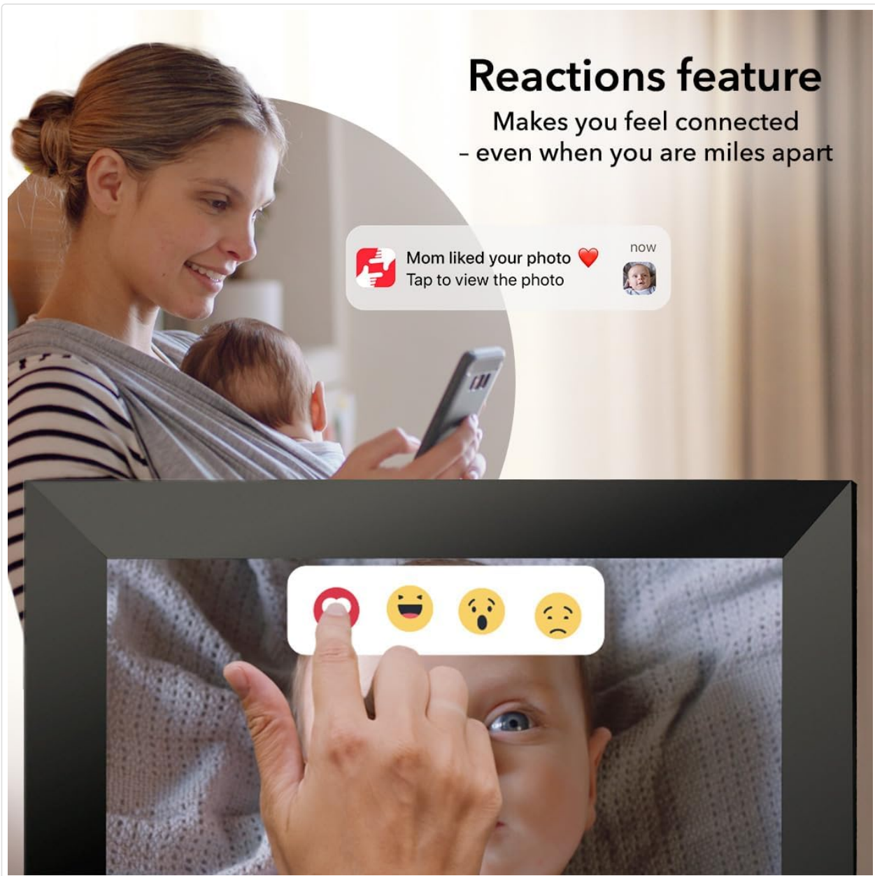
Image: A person interacting with the digital photo frame, which displays a photo and reaction emojis, demonstrating the 'Reactions' feature.