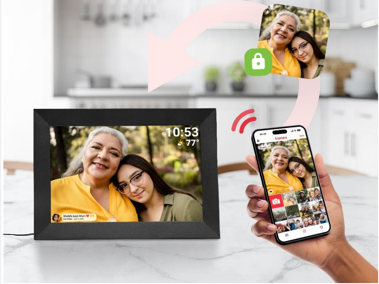
Image: The digital photo frame and a smartphone, illustrating how pictures from the phone are transferred to the frame.