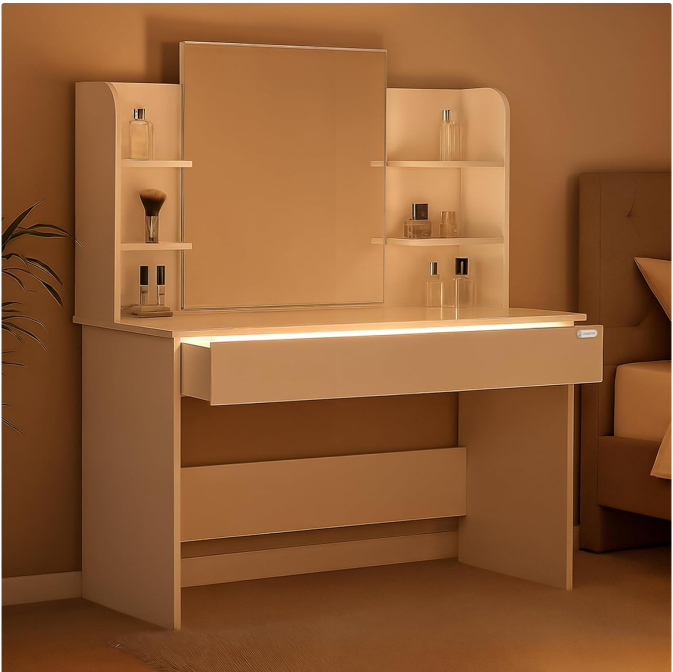
Image 1.1: The Casaria Lucia Dressing Table with its accompanying stool.