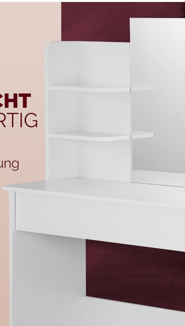
Image 6.1: The dressing table is made from scratch-resistant and durable melamine resin coated chipboard, making it easy to clean.