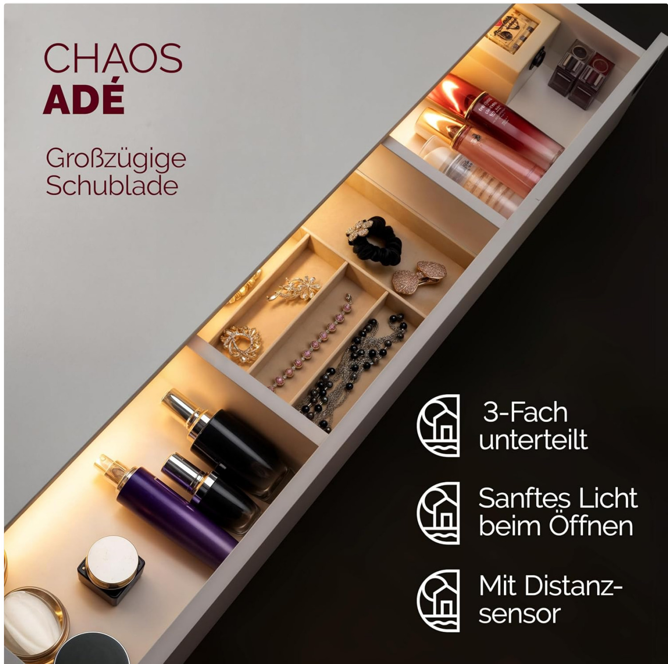
Image 5.1: The illuminated drawer interior with three compartments for organization.

drawer is opened, the sensor detects the movement and illuminates the interior. When the drawer is closed, the light will automatically turn off.