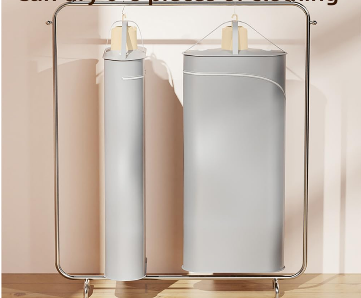
Image: Illustration of the 90L capacity, capable of drying 6-8 pieces of clothing.