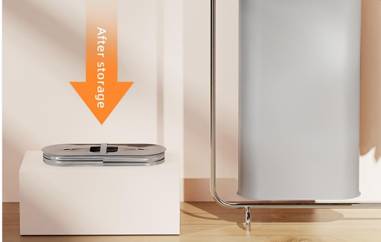
Image: The main dryer machine unit and the accompanying dryer bag.

The clothes dryer can be used by hanging it directly No installation required