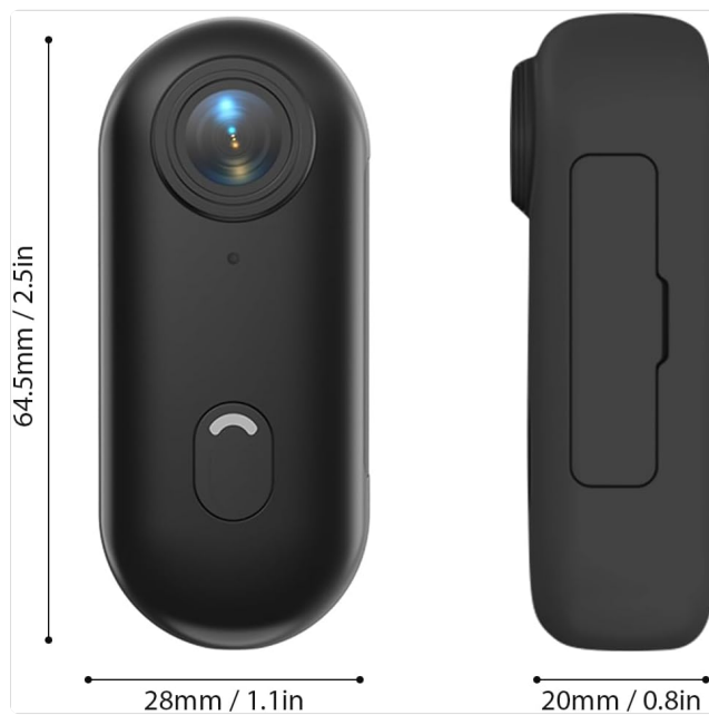
Physical dimensions of the camera.