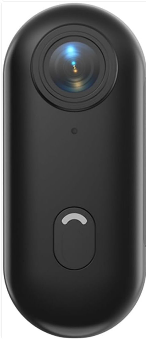
Front view of the Andoer Tiny Action Camera.