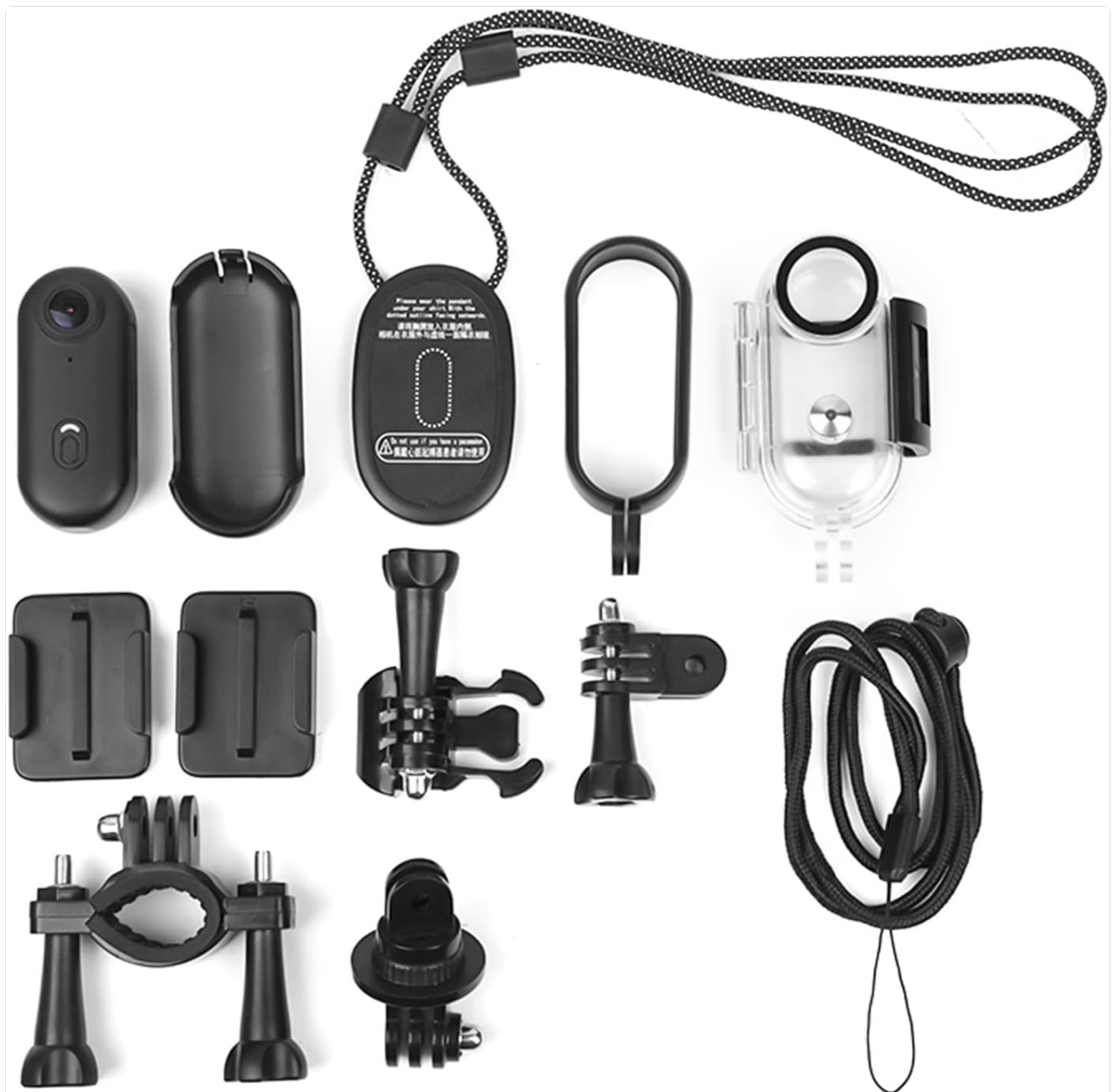
Detailed view of the camera and its included accessories.