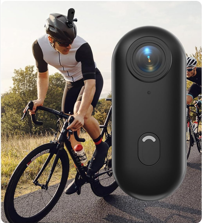
Loop recording functionality ensures continuous capture.

Open loop recording to achieve automatic coverage, maximum Support 256G to meet your shooting needs