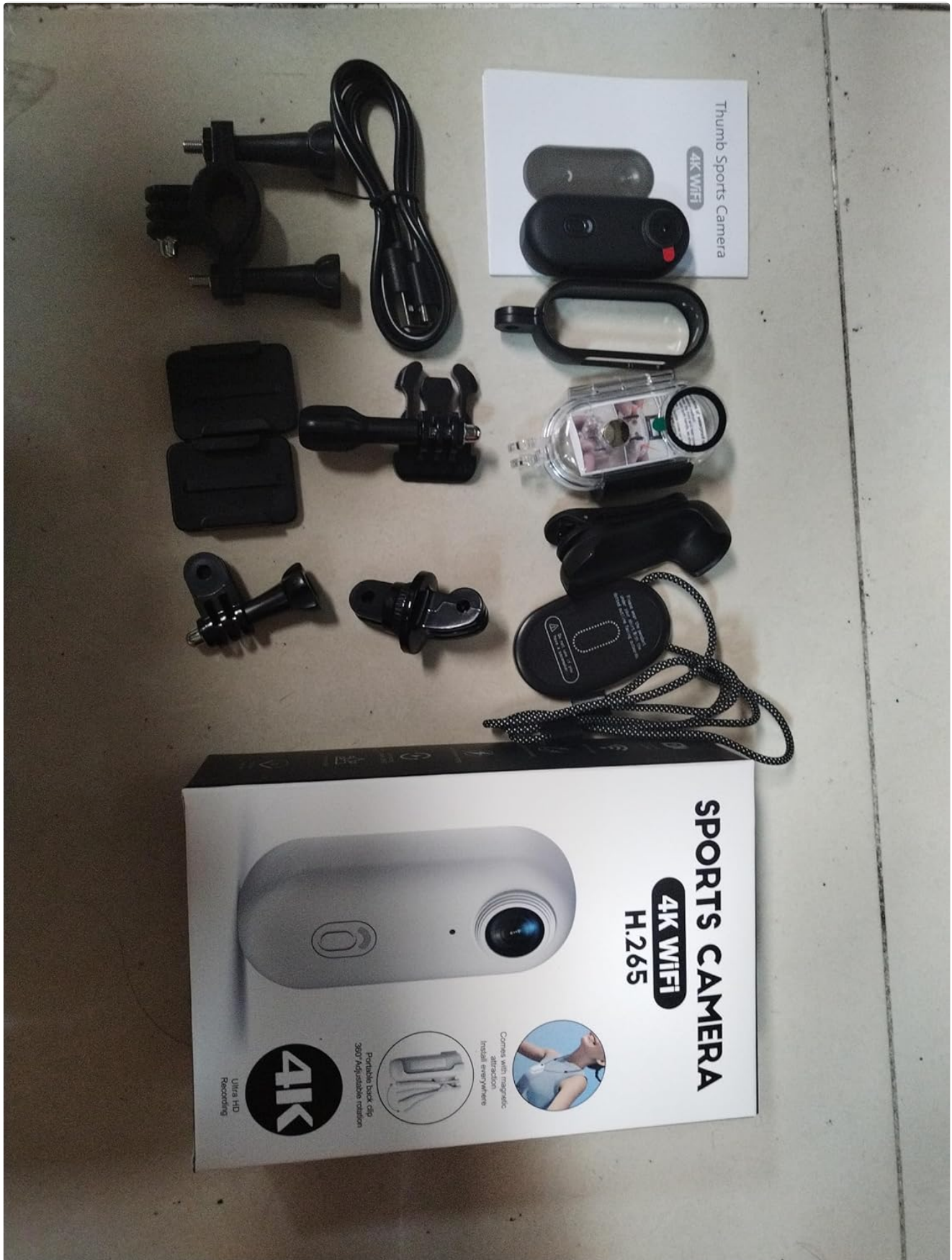
Illustration of the complete package contents.