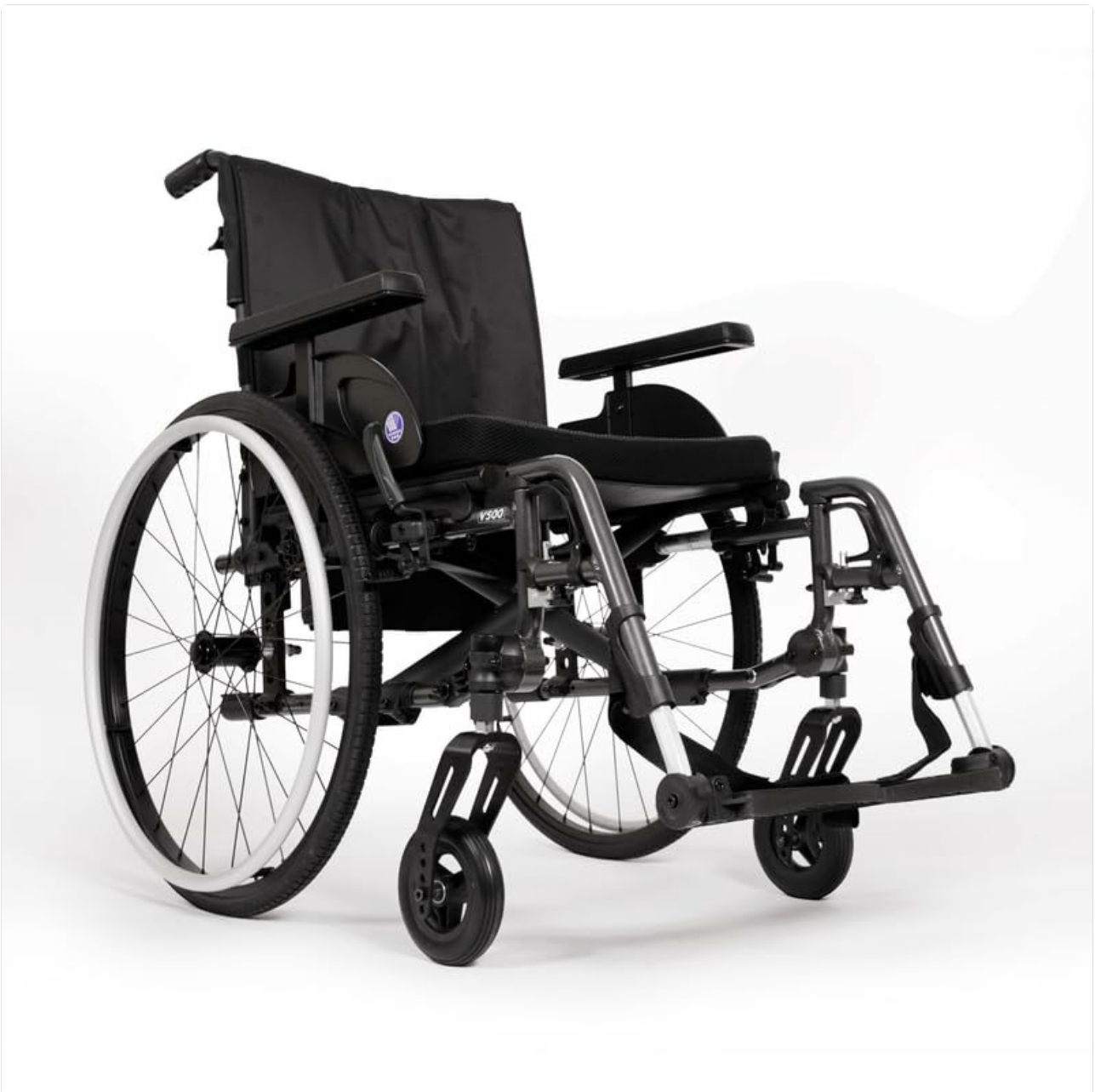
Image: The VERMEIREN V500 Premium Active Wheelchair, showcasing its sleek design and robust frame.

The V500 offers enhanced comfort and functionality with ergonomic handgrips, adjustable and removable armrests, and adaptable leg rests. Its quick-release rear wheels facilitate easy transport and storage, making it a dependable and user-friendly choice.