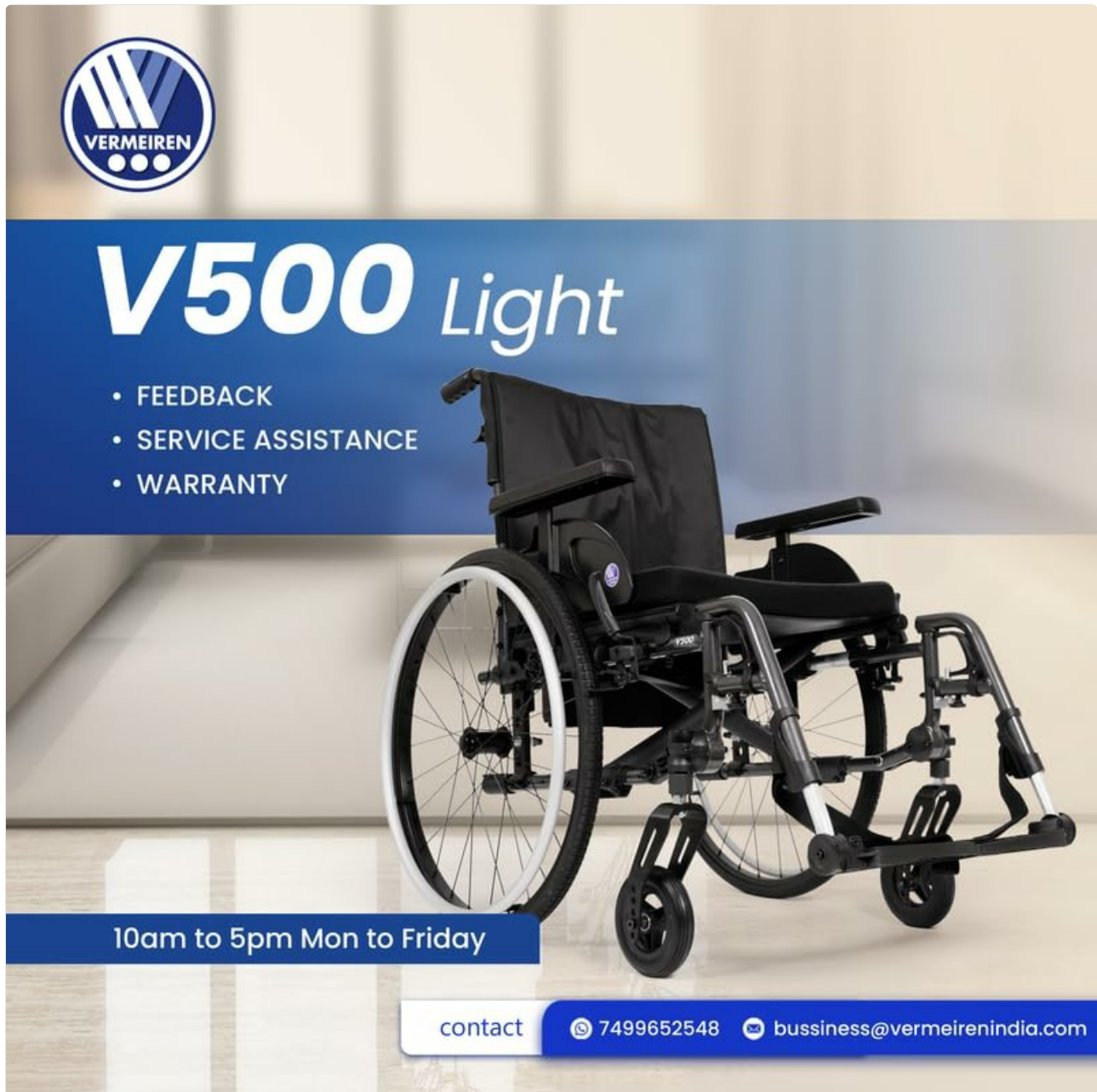
Image: Contact details for feedback, service assistance, and warranty inquiries, including phone number, email, and operating hours.

VERMEIREN is a global brand with a strong presence in Belgium, Poland, China, and India, committed to providing quality medical equipment and support.