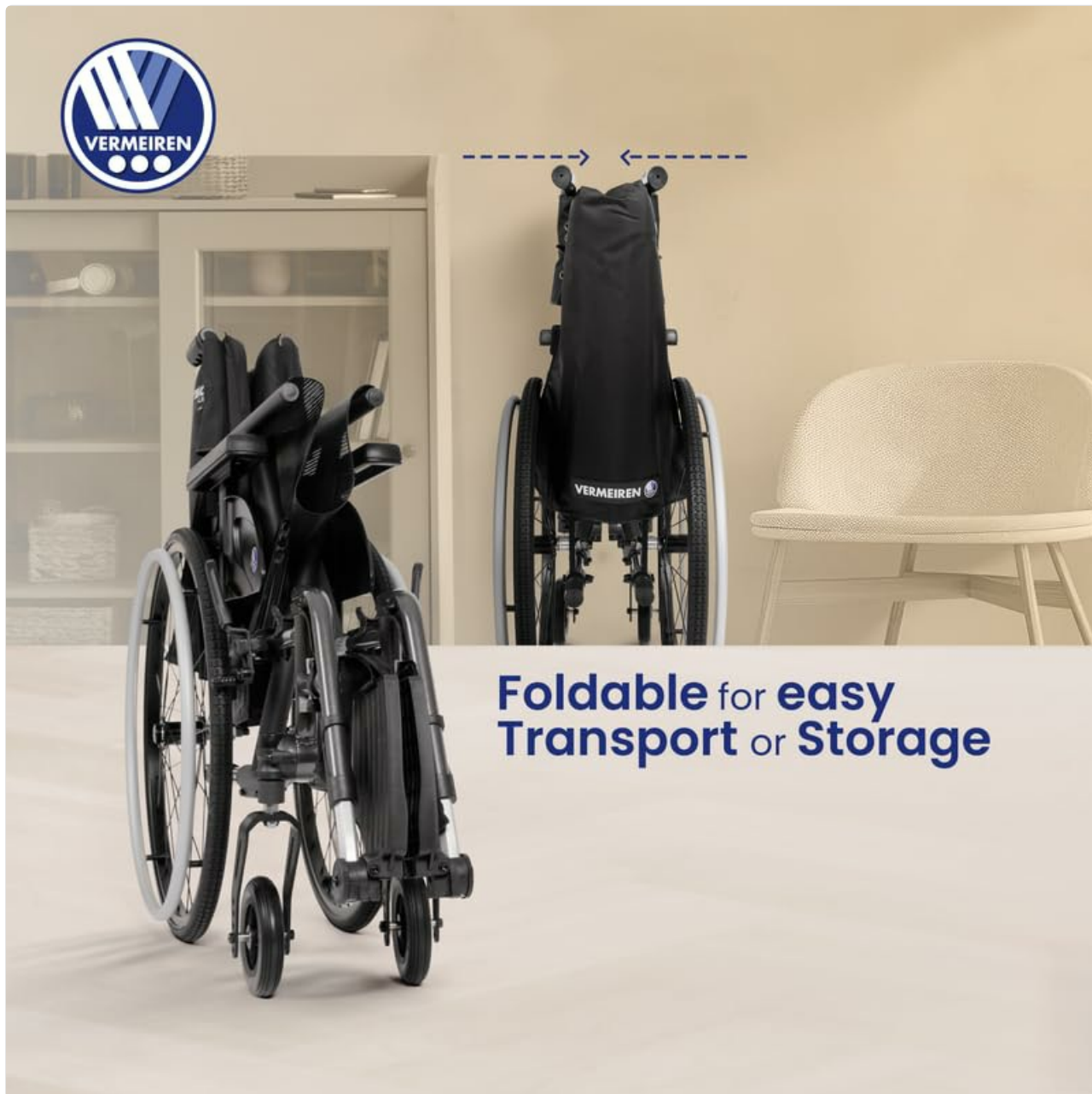
Image: The V500 wheelchair in its folded state, demonstrating its compact design for easy transport and storage.