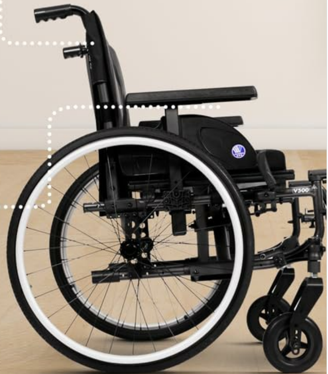
Image: Close-up view highlighting the adjustable handles and removable armrests, key features for user comfort and customization.