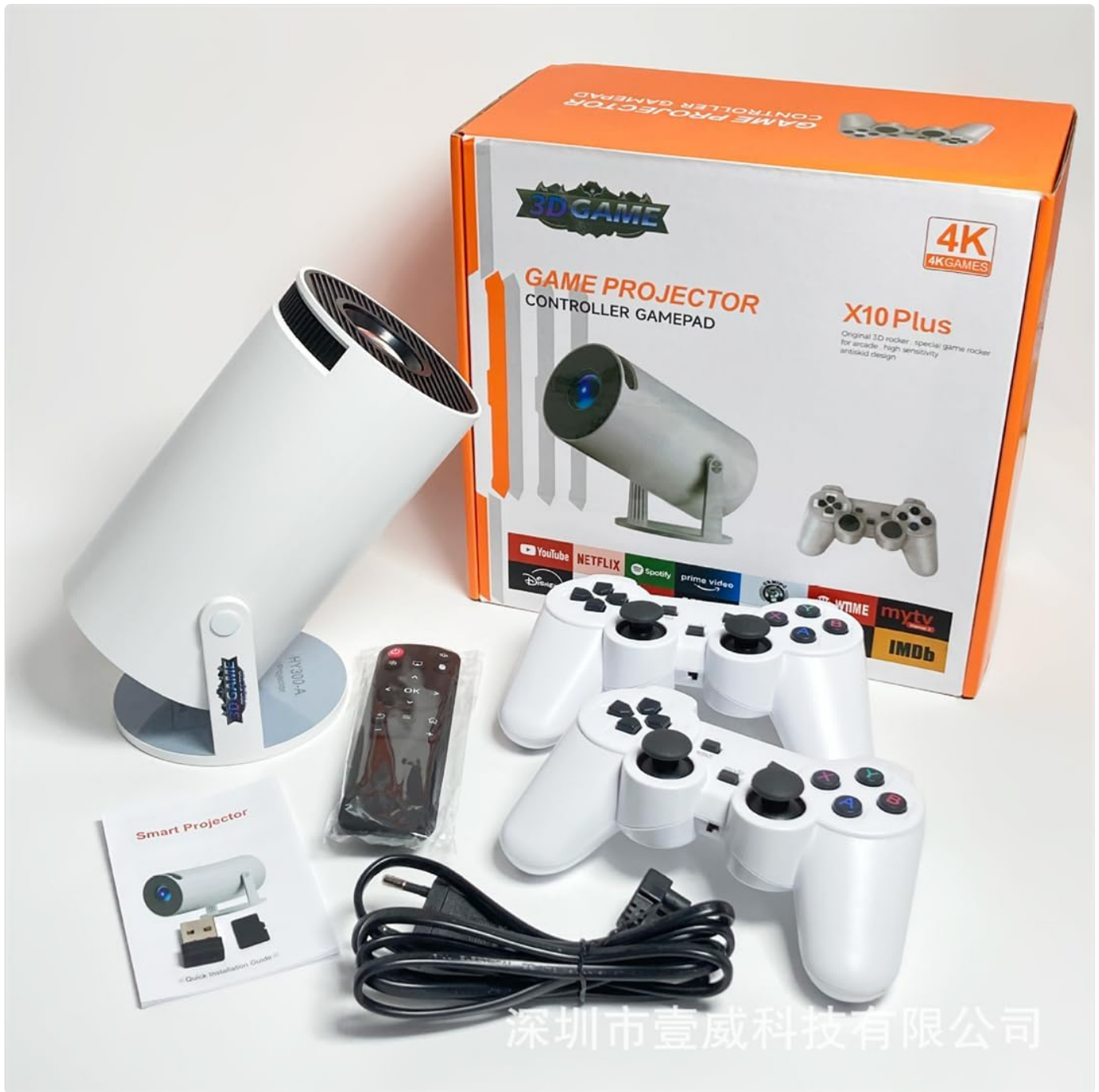
Image: Contents of the KoDeer X10 Plus package, including the projector, two wireless controllers, remote control, TF card, power cable, and user manual.