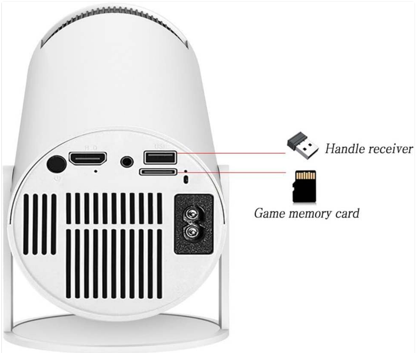
Image: Rear view of the KoDeer X10 Plus projector, highlighting the HDMI output, USB ports for the wireless receiver, and power input. Labels indicate the 'Handle receiver' (USB wireless receiver) and 'Game memory card' (TF card) slots.