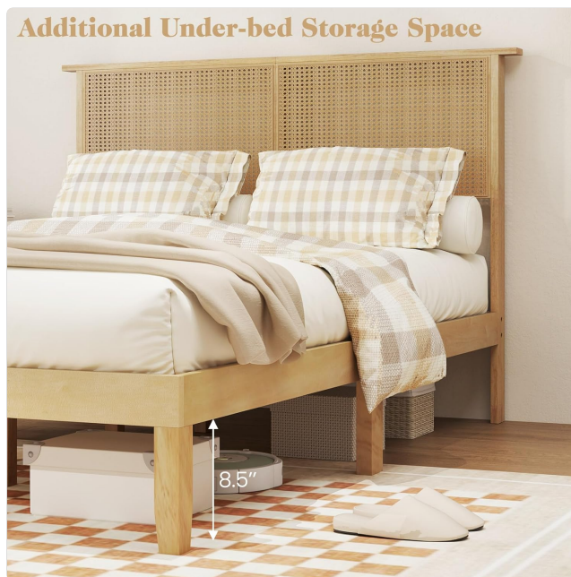
Image: A view of the bed frame's underside, illustrating the 8.5-inch clearance for storage or cleaning, with storage bins and a robotic vacuum visible.