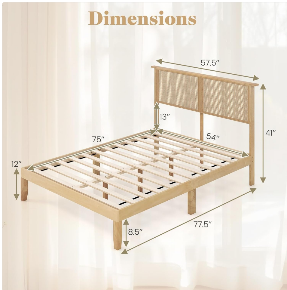
Image: A detailed diagram illustrating the overall dimensions of the KOMFOTT bed frame, including length, width, height, headboard height, and under-bed clearance.