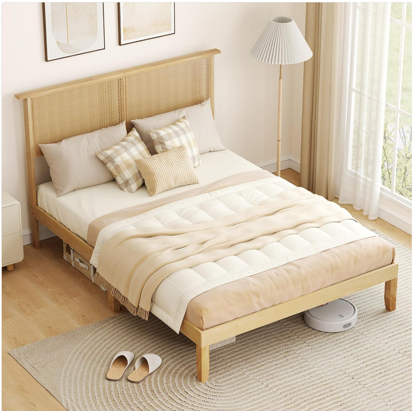
Image: The KOMFOTT Full Size Wood Platform Bed Frame, featuring a natural wood finish and a rattan headboard, shown fully assembled in a bedroom setting.