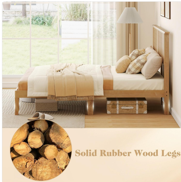
Image: Detail showing the solid rubber wood legs of the bed frame, with an inset image of raw rubber wood logs highlighting the material's quality.