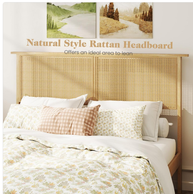
Image: A close-up of the bed's headboard, showcasing the natural PE rattan weave and its aesthetic appeal.