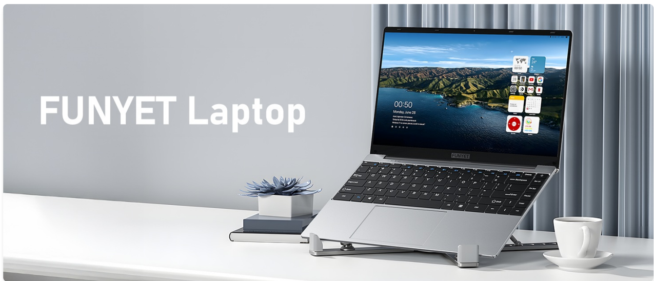
Image: The FUNYET NY-02 laptop displayed on a modern desk setup.

Welcome to the FUNYET NY-02 16-inch Laptop User Manual. This guide provides essential information to help you set up, operate, maintain, and troubleshoot your new laptop. Please read this manual thoroughly to ensure optimal performance and longevity of your device. Keep this manual for future reference.