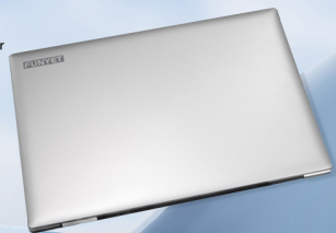
Image: Graphic depicting the laptop's ultra-long endurance battery with 6000mAh capacity.