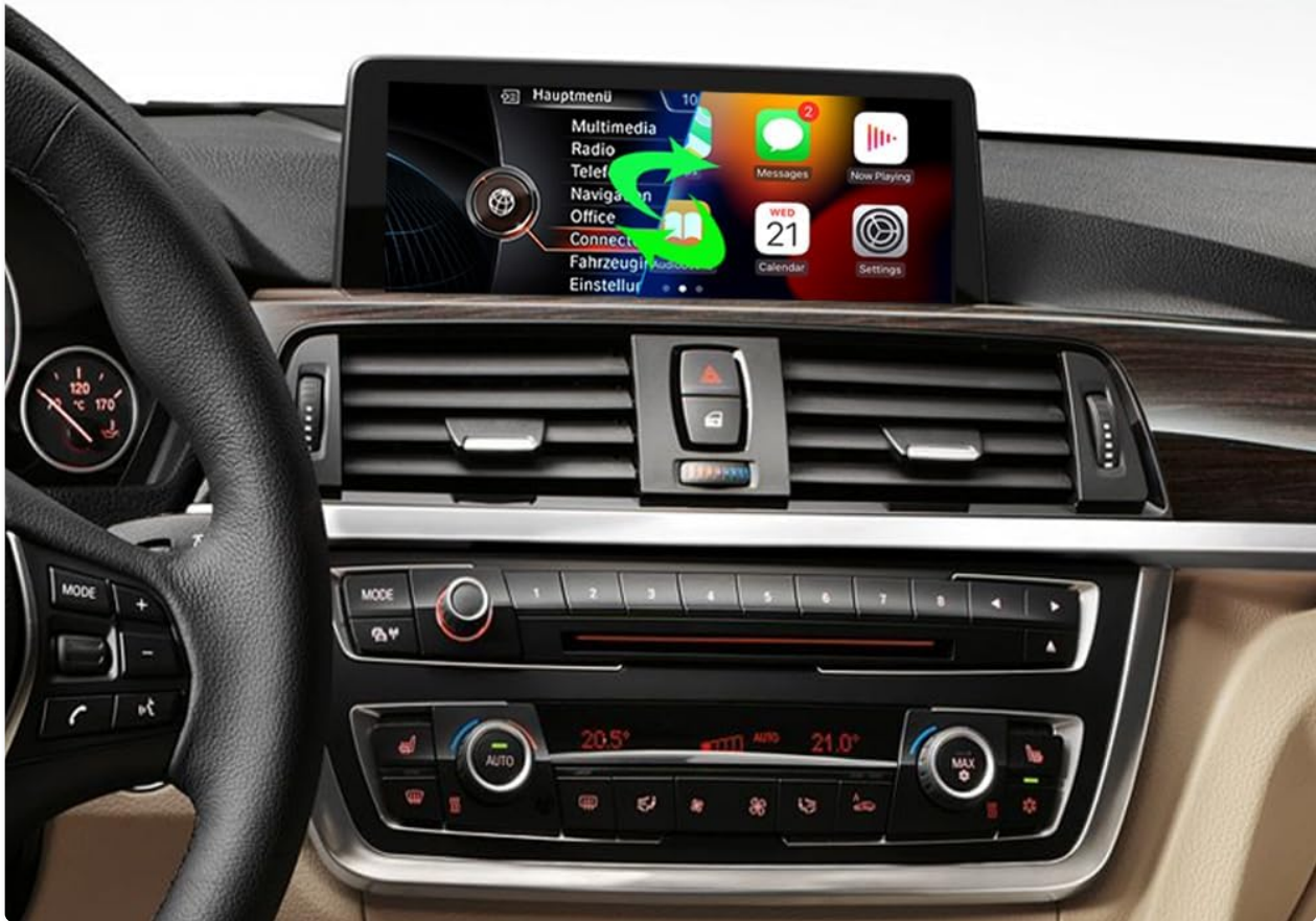
Image 5.1: Demonstrates how to switch between the original BMW system and the CarPlay system by pressing the iDrive "MENU" button.

Just press Menu button on idrive,you can switch original system and carplay system freely