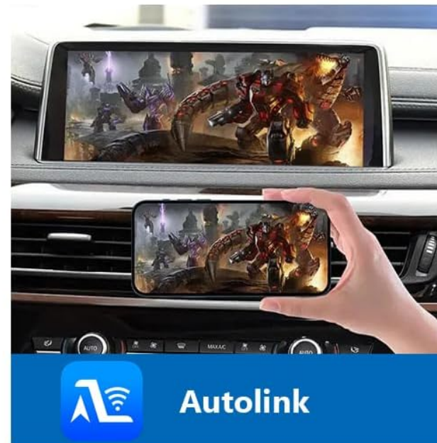
Image 5.2: Illustrates the various connectivity options including CarPlay, Android Auto, Airplay, and Autolink.