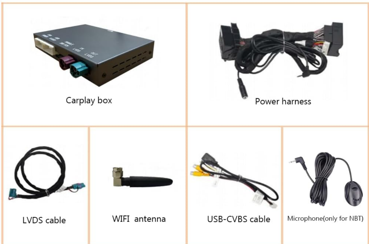
Image 3.1: Overview of the included components: CarPlay box, power harness, LVDS cable, Wi-Fi antenna, USB-CVBS cable, and microphone.