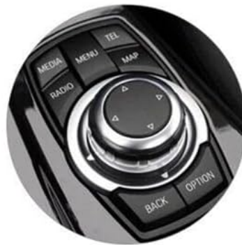
Support iDrive knob control

Image 5.3: Highlights key product features such as CarPlay, Android Auto, Wi-Fi, Bluetooth, Maps, Music, and Phone, along with integration for steering wheel and iDrive knob controls.