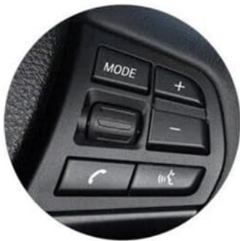
Support Steering wheel control

The upgrade is not just to assemble the intelligent system for your car, but also supports the original car operation control system