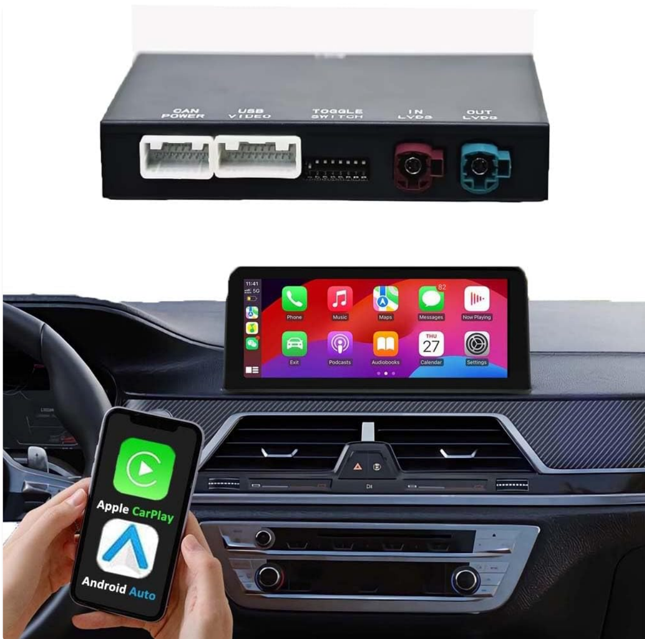
Image 1.1: The AUTOTOP Wireless CarPlay Android Auto Adapter module and its integration with a BMW's in-car display, showing Apple CarPlay interface.