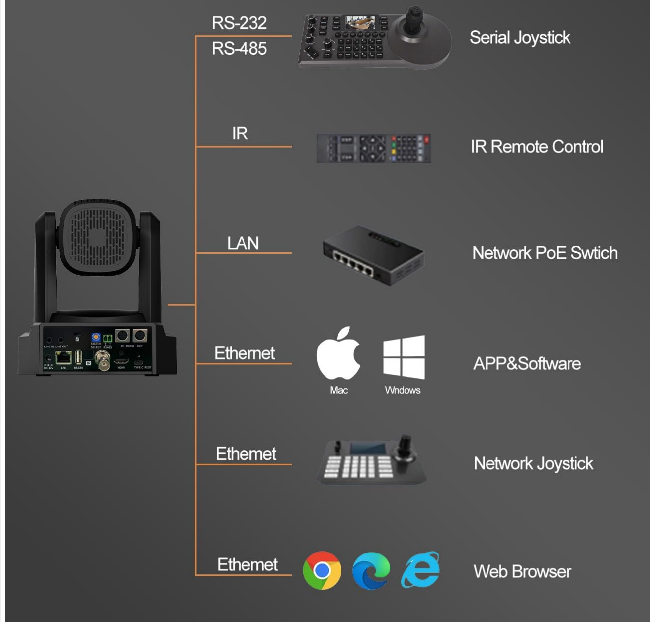
Image: This diagram illustrates multiple ways to control the camera, including RS-232/RS-485 with a serial joystick, IR remote control, LAN with a network PoE switch, Ethernet with APP/Software (Mac/Windows), Ethernet with a network joystick, and Ethernet via a web browser.

The camera offers flexible control options: