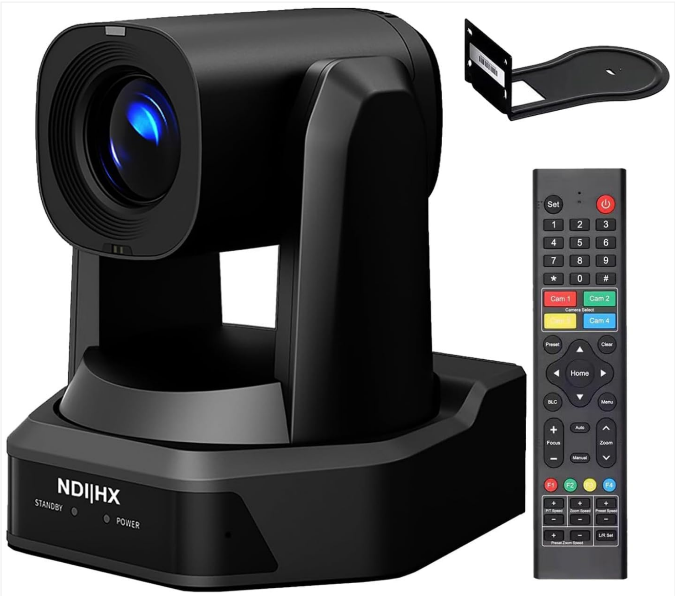
Image: This image displays the main camera unit, highlighting its lens, pan/tilt mechanism, and base. The included remote control and a wall-mount bracket are also shown.

The camera features a high-quality optical lens, a pan-tilt mechanism for movement, and a base with status indicators (STANDBY, POWER). The rear panel contains all input/output ports for connectivity.