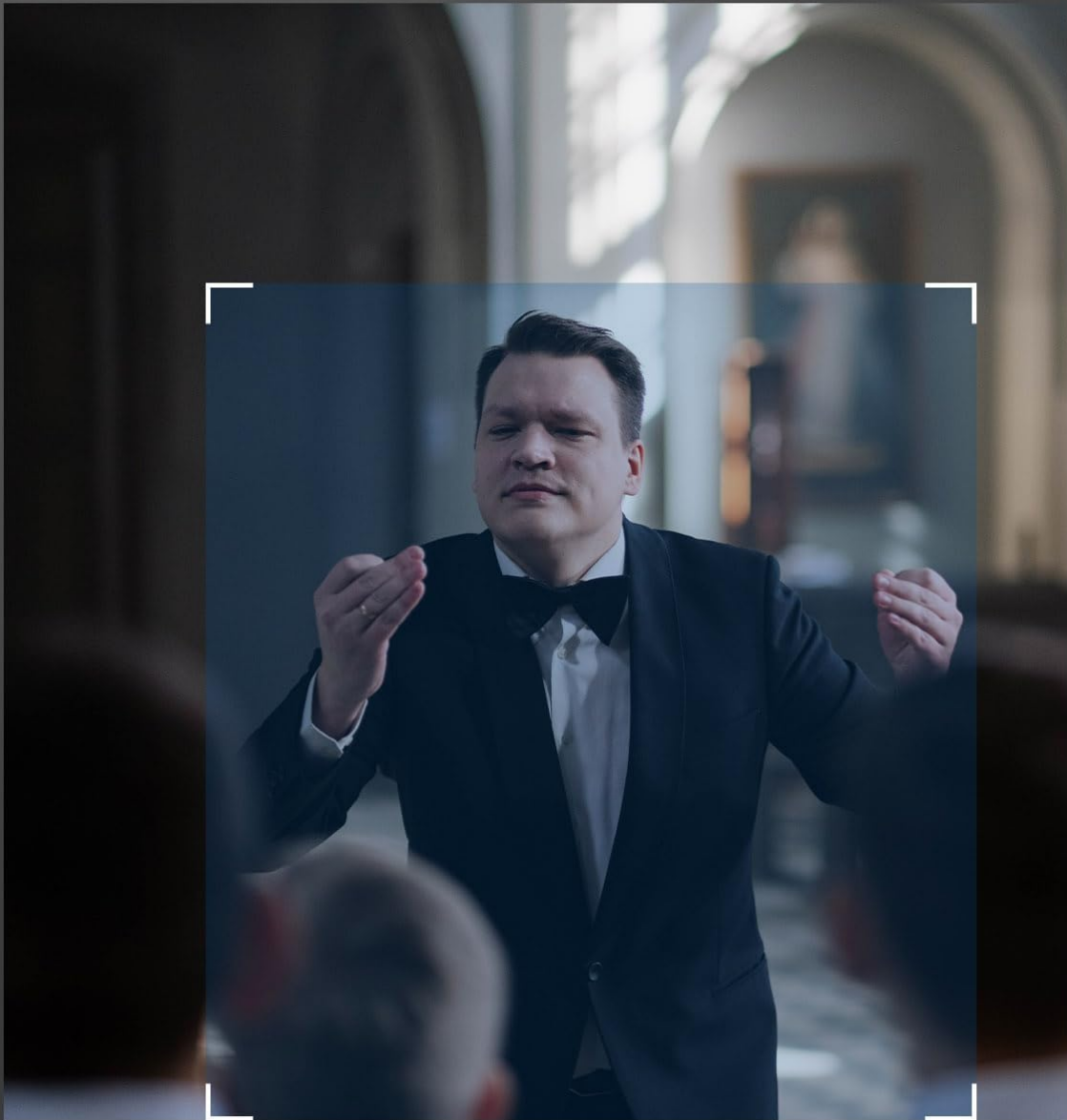
Image: This image illustrates the AI Human Auto-Tracking feature, showing a green box around a person, indicating that the camera is actively tracking the subject's movement.

The AI auto-tracking feature allows the camera to automatically follow a designated speaker or subject. Refer to the camera's web interface or advanced control software for specific instructions on activating and configuring AI tracking modes.