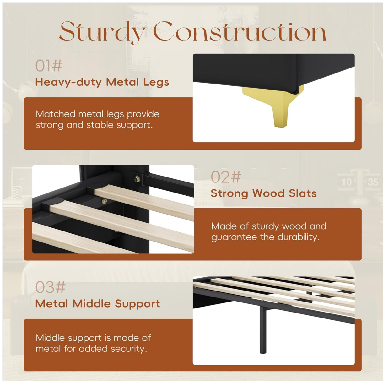
Figure 3.1: Sturdy Construction Components. This image highlights the heavy-duty metal legs, strong wooden slats, and the metal middle support system that contribute to the bed frame's stability and durability.