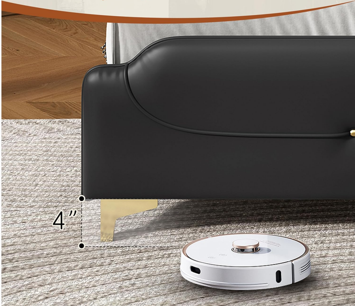
Figure 5.2: Underbed Clearance. This image demonstrates the 4-inch clearance beneath the bed frame, indicating it is suitable for robotic vacuum cleaners for easy cleaning.