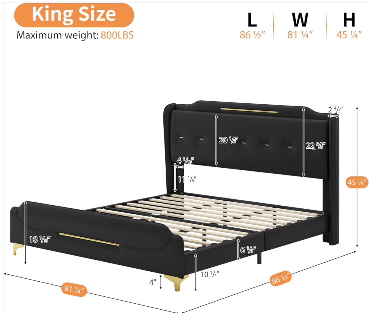
Figure 5.1: King Size Bed Frame Dimensions. This diagram illustrates the overall dimensions of the King size bed frame, including length, width, height, and the stated maximum weight capacity of 800 LBS.