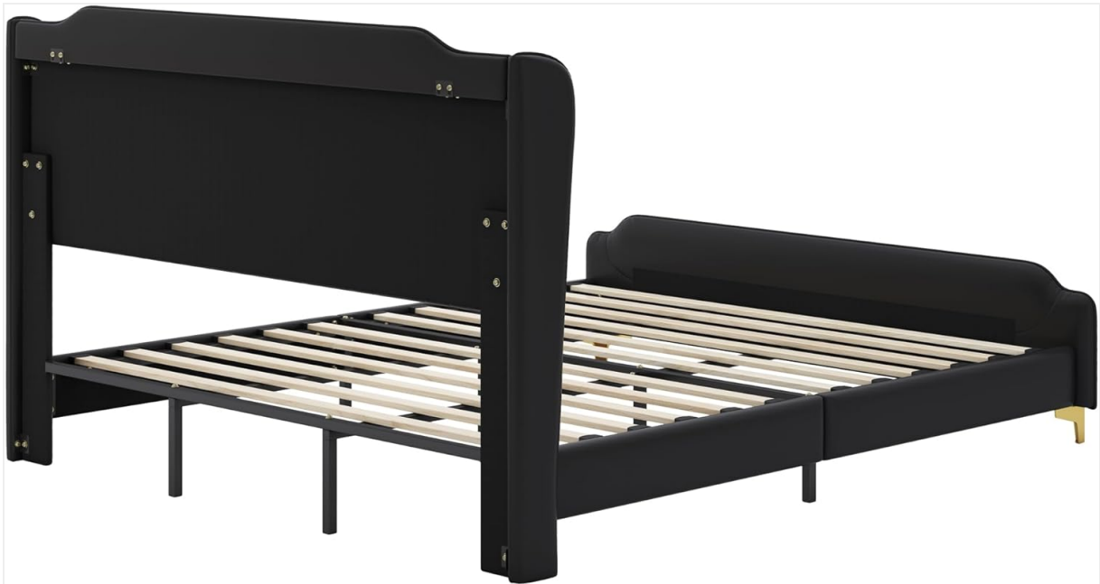
Figure 4.1: Partial Assembly View (Rear). This image shows the rear of the bed frame during an intermediate assembly stage, illustrating the connection points for the headboard and side rails before full upholstery is applied or final decorative elements are added.