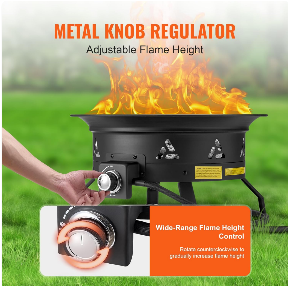
Figure 4: The metal knob regulator allows for adjustable flame height.