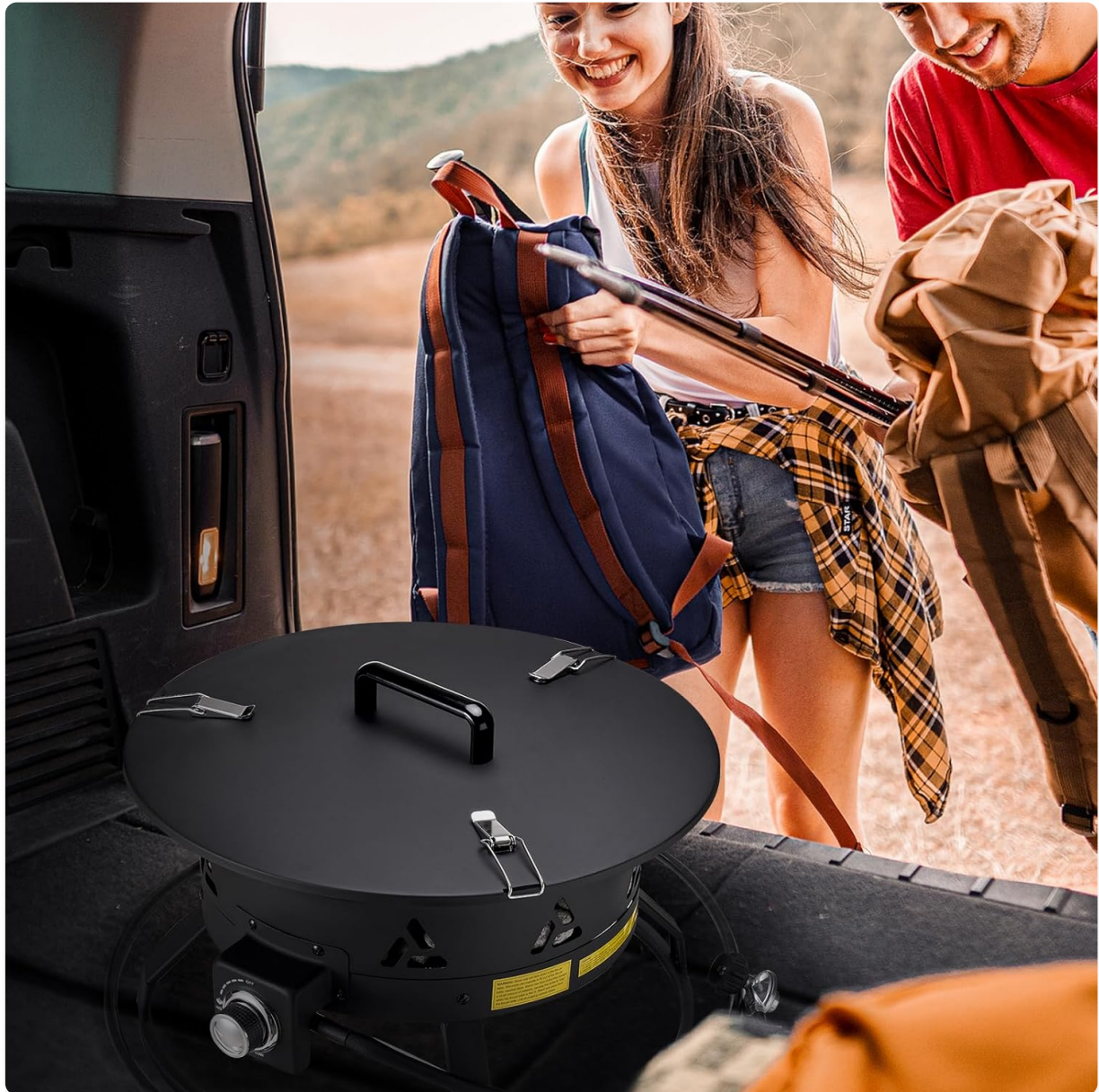
Figure 5: The portable design allows for easy storage and transport, such as in a car trunk.