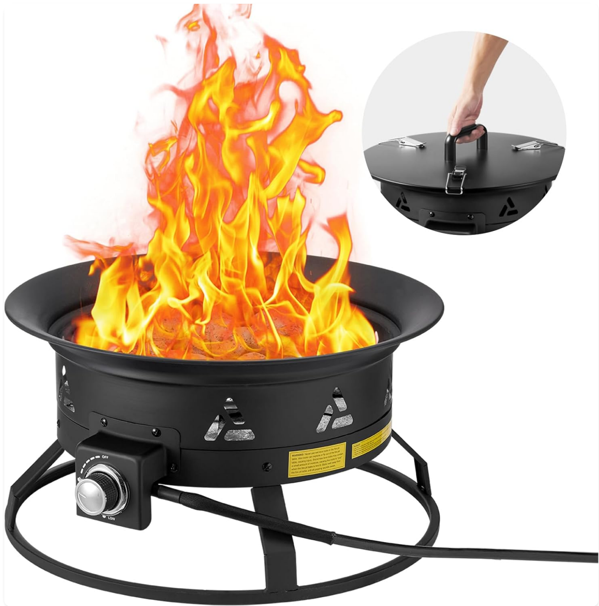
Figure 1: VEVOR Propane Fire Pit in operation, highlighting the integrated handle on the lid for portability.

Your browser does not support the video tag.