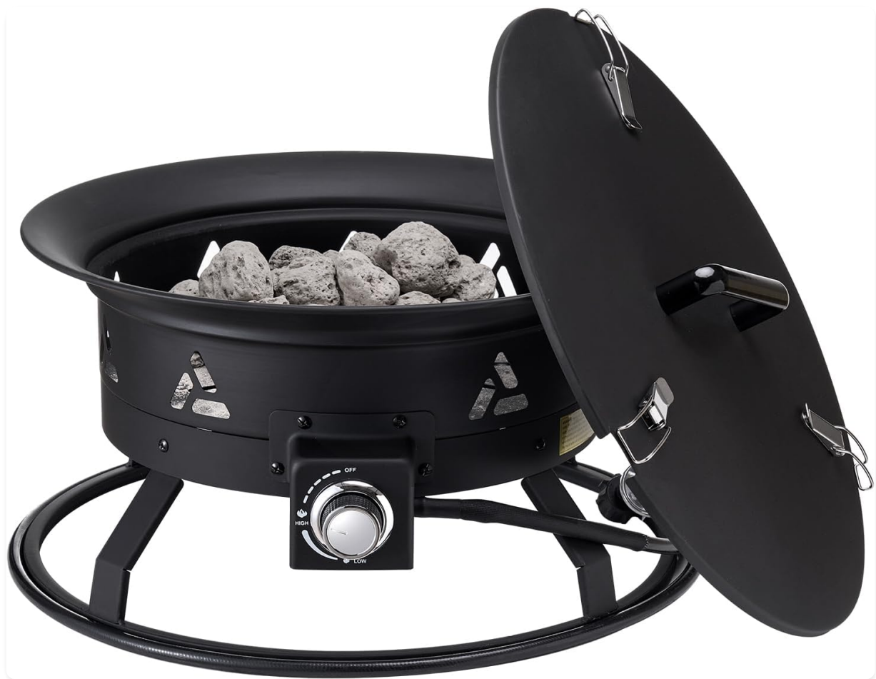
Figure 3: Lava rocks distributed over the burner, ready for operation.