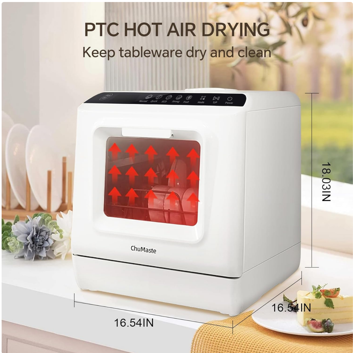
Figure 4.1: The dishwasher highlighting its dimensions (16.54 inches wide, 16.54 inches deep, 18.03 inches high) and the PTC hot air drying feature.