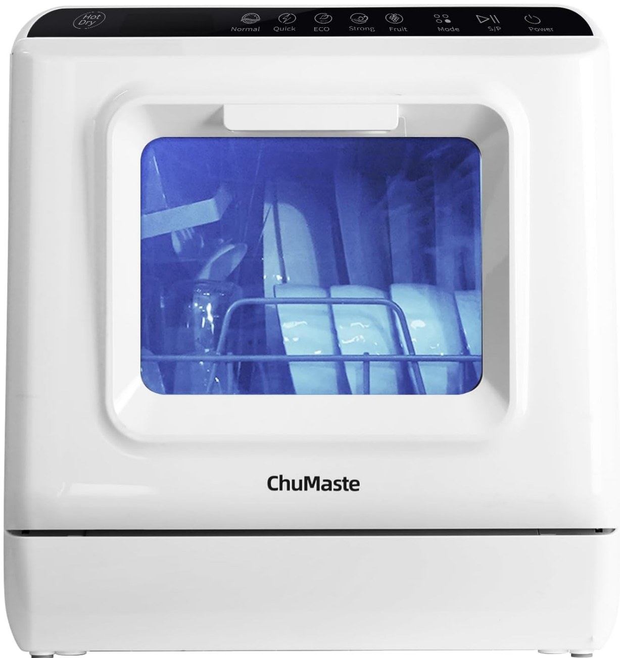
Figure 3.1: Front view of the ChuMaste CM-01 Countertop Dishwasher, showing its compact design and control panel.