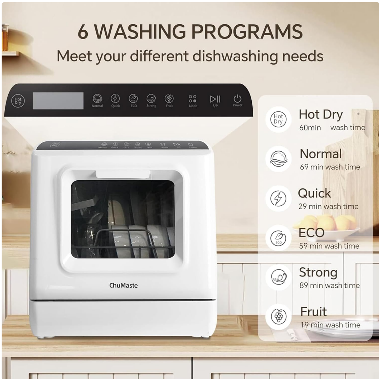
Figure 3.2: The dishwasher's control panel displaying the six available wash programs: Hot Dry, Normal, Quick, ECO, Strong, and Fruit.