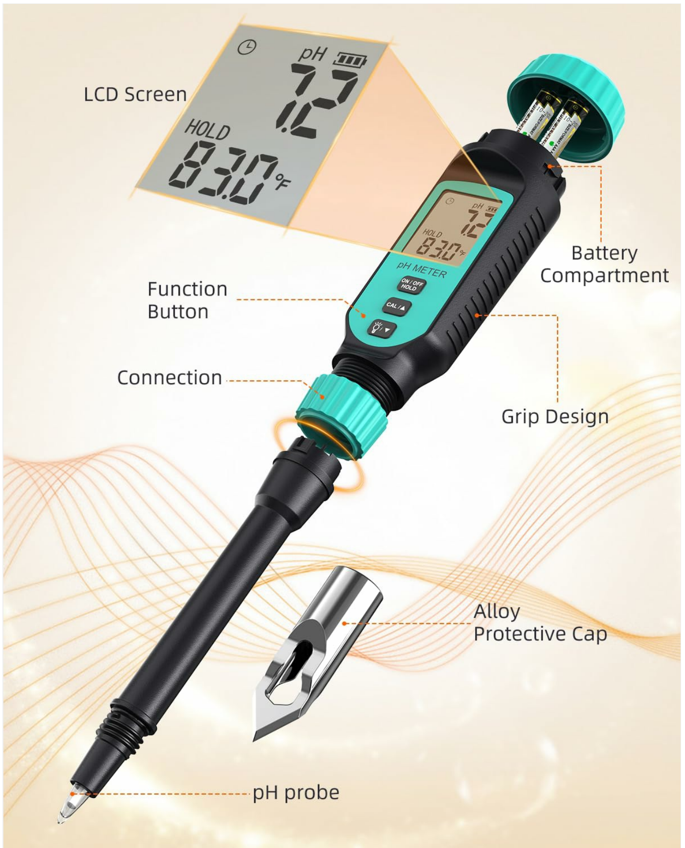
Image: An exploded view diagram labeling the LCD screen, function buttons, battery compartment, grip design, connection point, pH probe, and alloy protective cap.