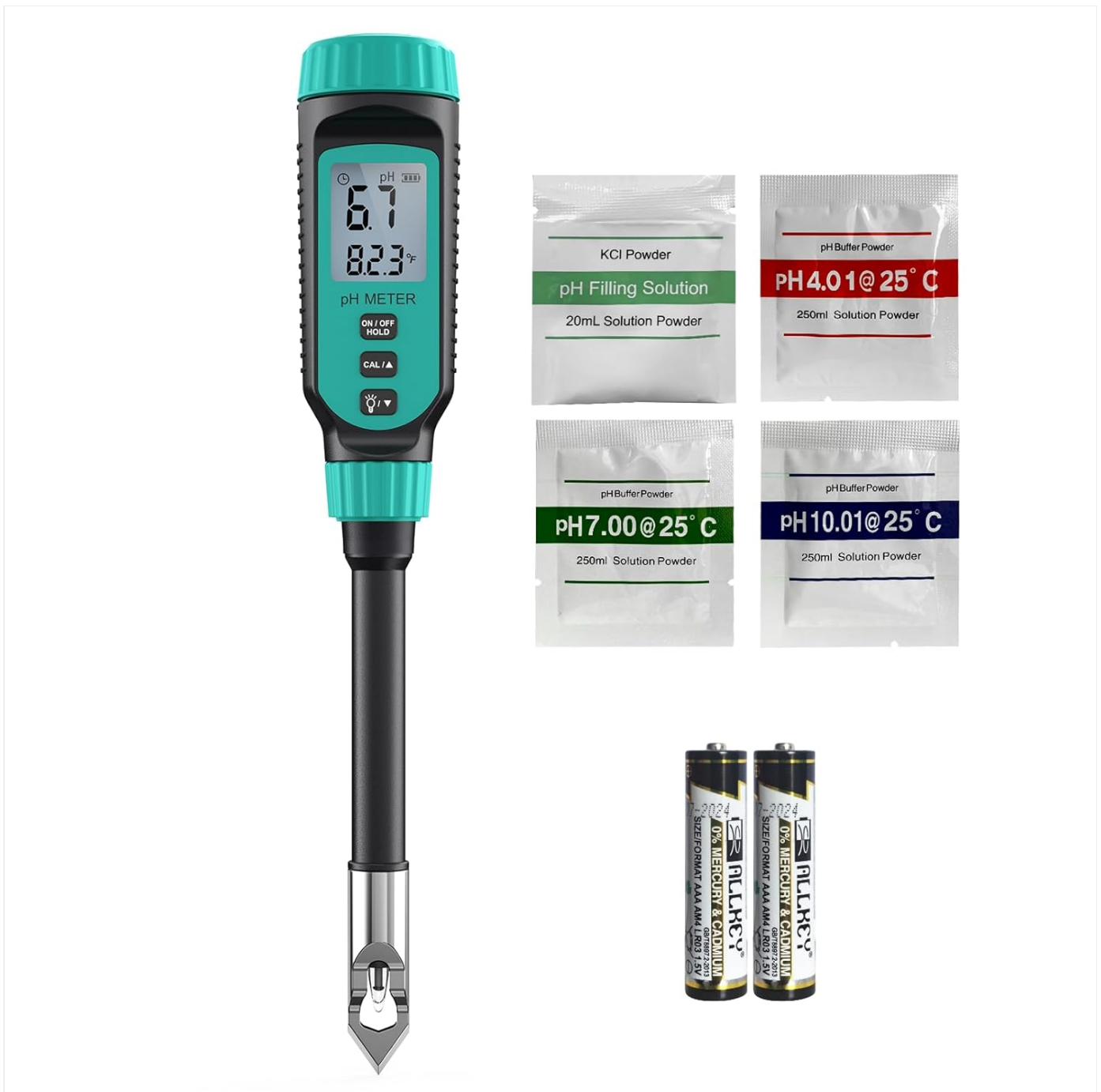
Image: The Tadeto Soil pH Tester, Model TE027, shown with included calibration powders and batteries.