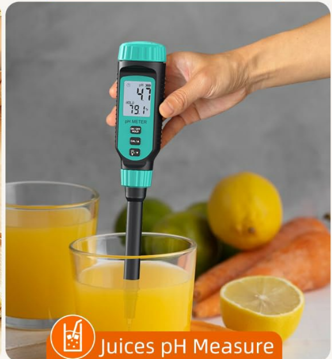
Image: The Tadeto Soil pH Tester being used to measure pH in soil, chemical solutions, baby food, and fruit juices, demonstrating its wide range of applications.