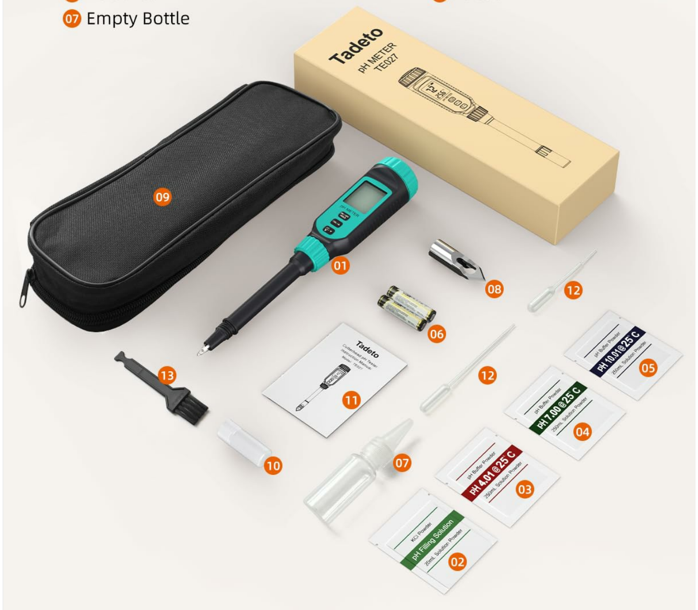
Image: A visual representation of all components included in the Tadeto Soil pH Tester package, neatly arranged.